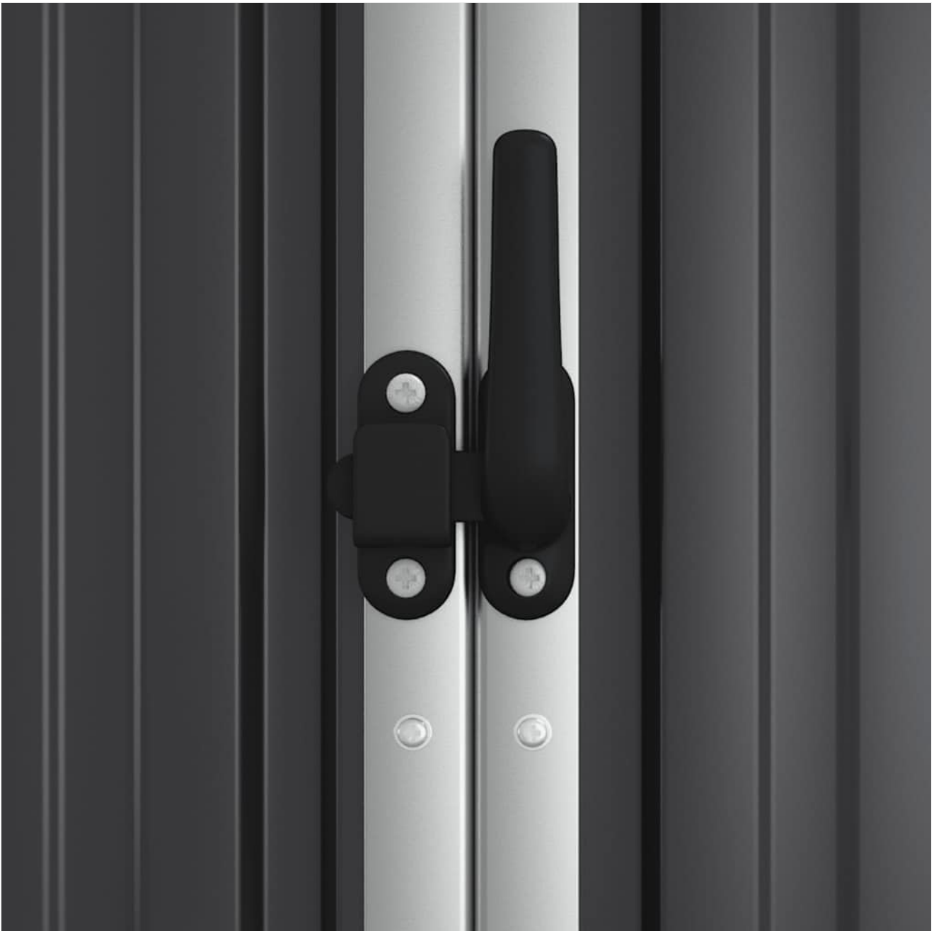
Image 3.1: A close-up view of the door handle mechanism, designed for easy opening and secure closing of the shed doors.