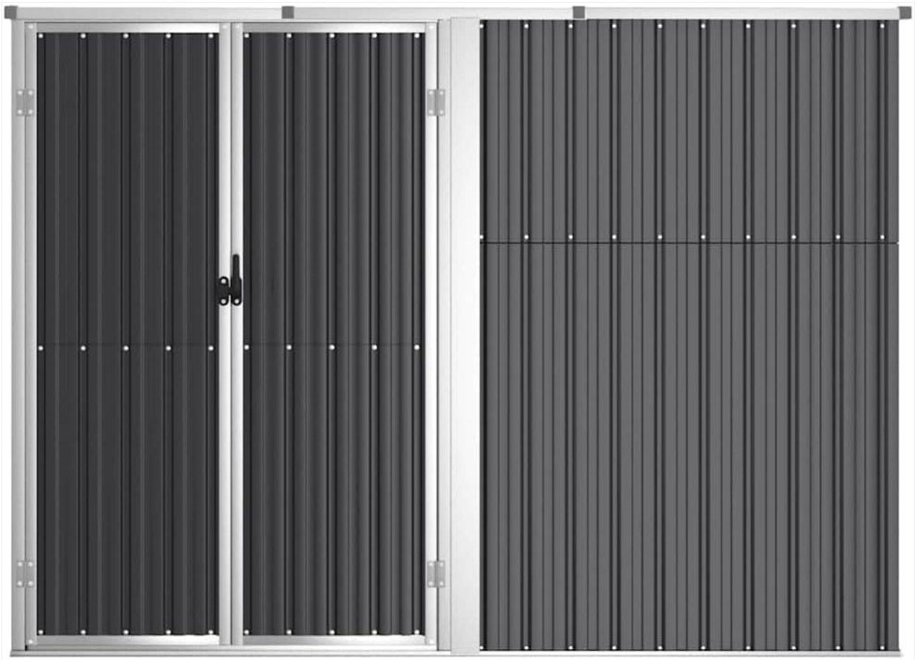
Image 3.2: The front view of the garden tool shed, illustrating the double doors in a securely closed position.