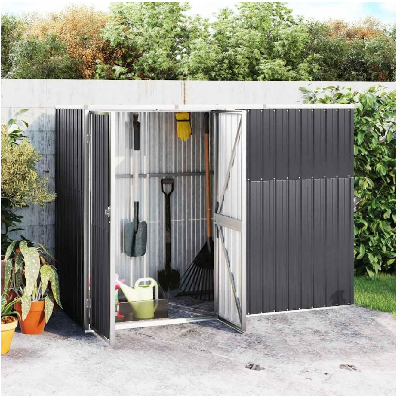
Image 1.1: The vidaXL Garden Tool Shed with its doors open, showcasing the interior storage capacity for various garden tools and equipment.