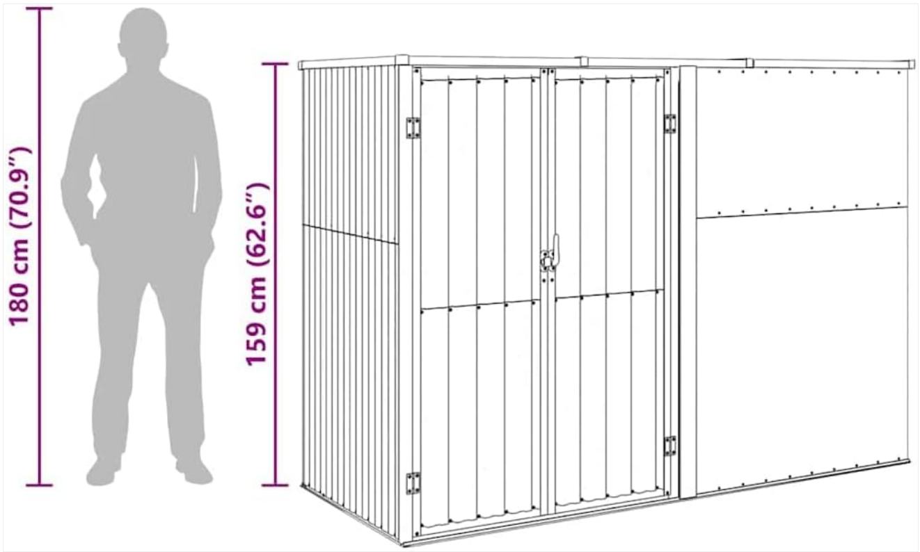
Image 2.2: A visual representation of the shed's height in comparison to an average adult, illustrating its practical size.