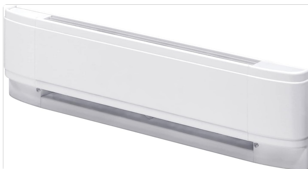
Figure 1: Front view of the Dimplex LC2507W31 Linear Convactor Electric Baseboard Heater.

The Dimplex LC2507W31 is a 25-inch linear convactor electric baseboard heater designed to provide efficient and quick heating for various indoor spaces. Its compact and sleek design allows for discreet installation while delivering consistent warmth.