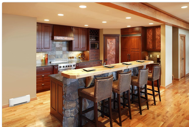
Figure 6: The Dimplex LC2507W31 heater installed in a kitchen, illustrating its versatile placement options.