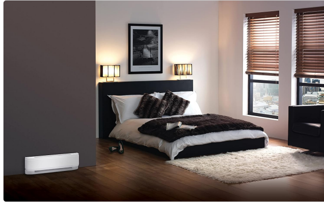
Figure 4: The Dimplex LC2507W31 heater discreetly installed in a bedroom, demonstrating its compact footprint.