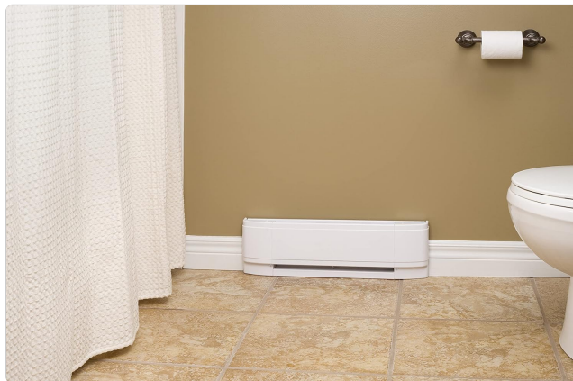
Figure 5: The Dimplex LC2507W31 heater installed in a bathroom, showcasing its suitability for various room types.