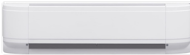
Figure 2: Detailed front view of the Dimplex LC2507W31 heater, highlighting its sleek design.