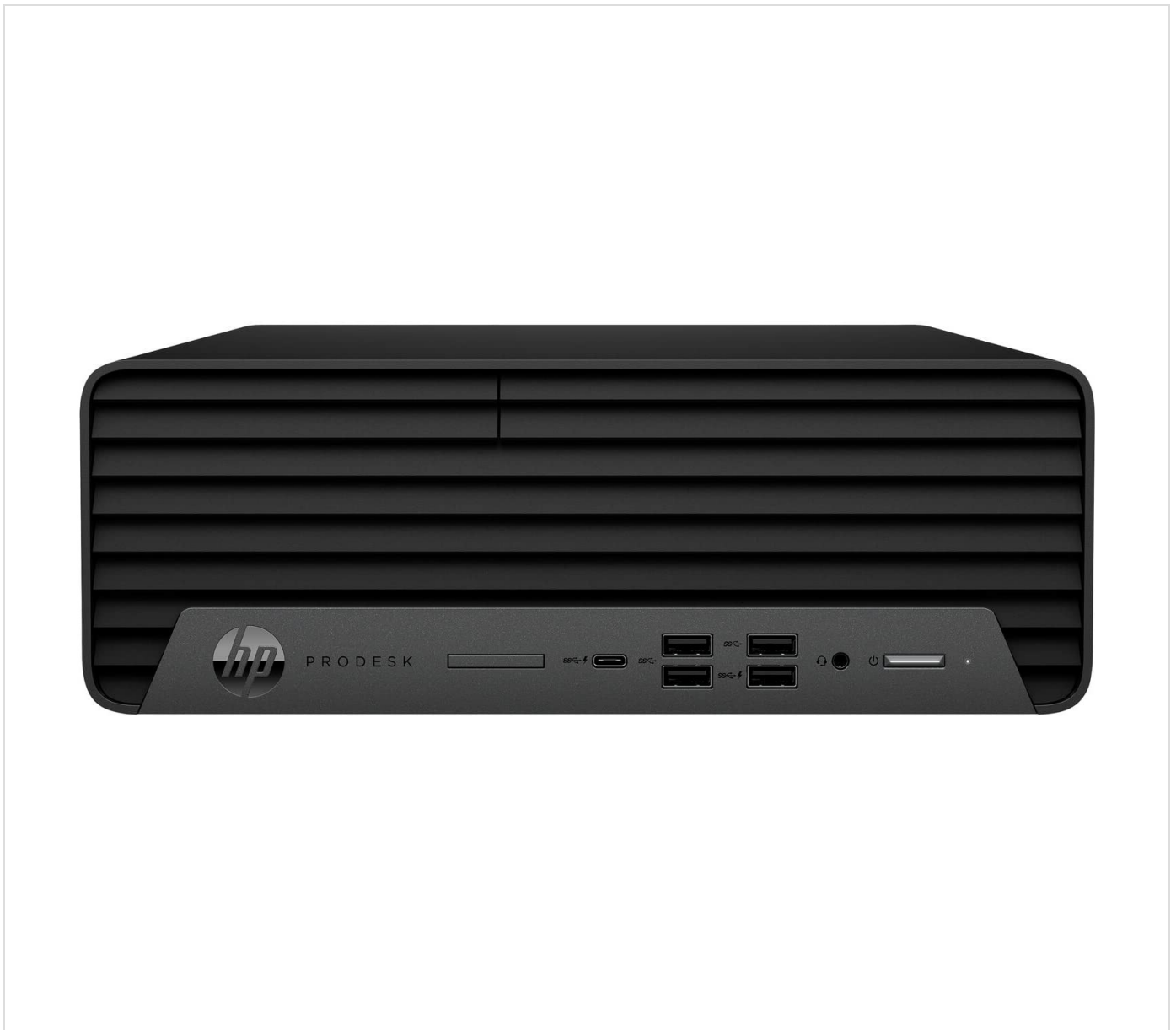
Figure 4.1: Front view of the HP ProDesk 600 G6-SFF.

The front panel provides convenient access to frequently used ports and controls.