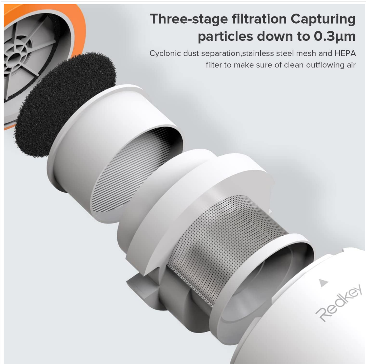
Image 4.1: Overview of the Redkey P6C vacuum cleaner and its included attachments.

The Redkey P6C features a modular design allowing it to transform from a stick vacuum to a handheld unit. Key components include the motor unit, dust cup, filtration system, and various attachments for specialized cleaning.