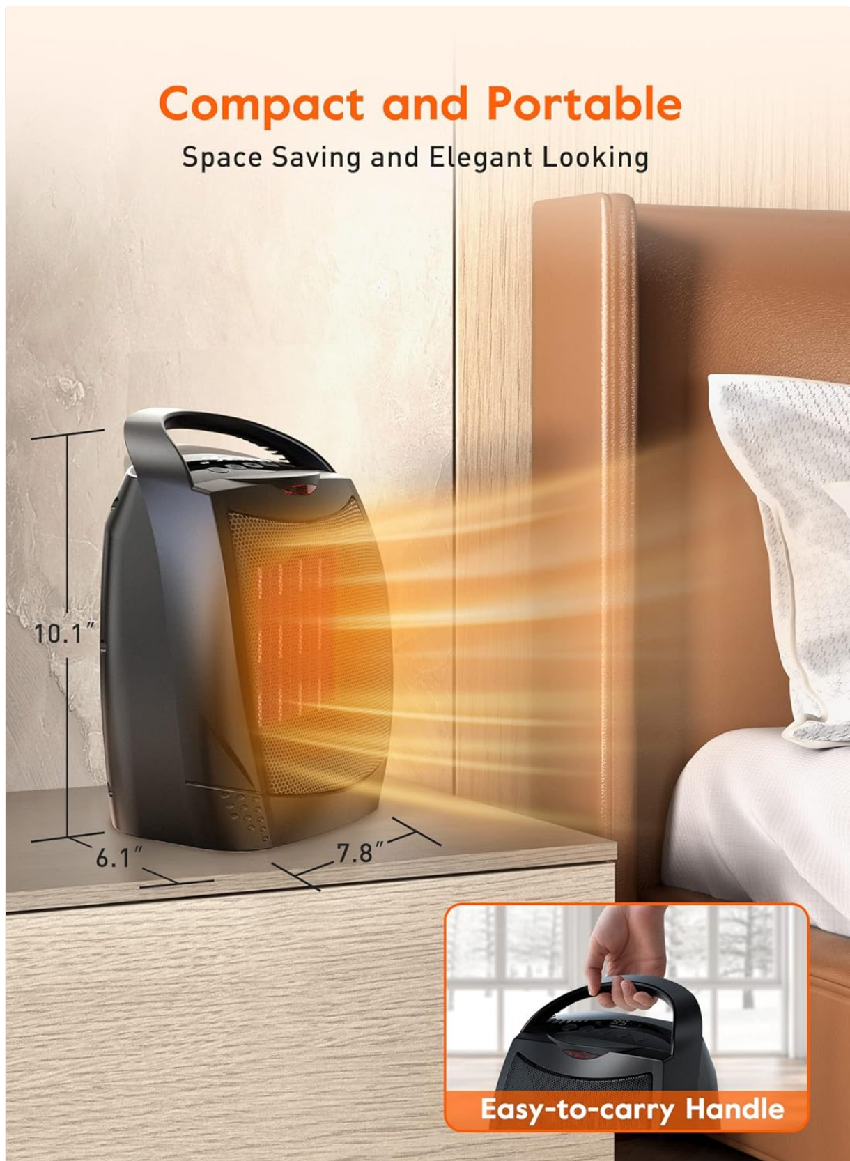
Image: The GiveBest Digital Space Heater showcasing its compact dimensions (10.1"H, 6.1"D, 7.8"W) and the integrated easy-to-carry handle.

The GiveBest Digital Space Heater is a compact and portable heating solution designed for personal spaces. Its dimensions are 6.1 inches (D) x 7.8 inches (W) x 10.1 inches (H), and it weighs approximately 3 pounds, making it easy to move with its built-in carry handle. The unit features a digital display for easy temperature and mode adjustments.