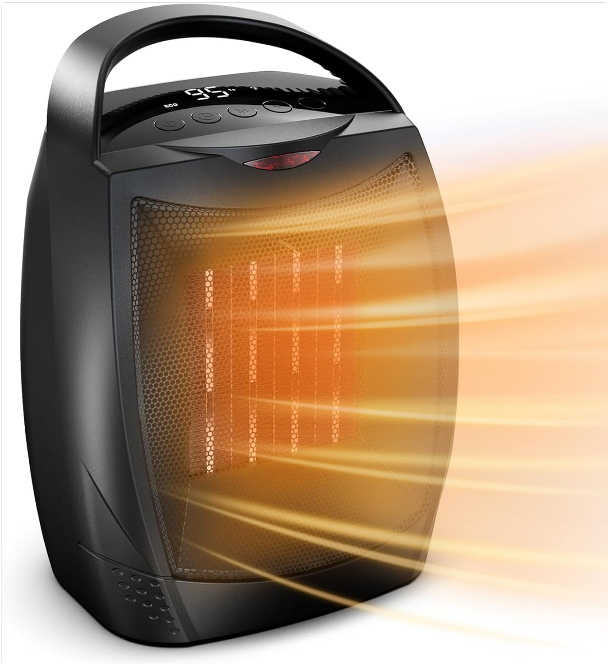
Image: The GiveBest Digital Space Heater in operation, showing heat being emitted from the front grille.