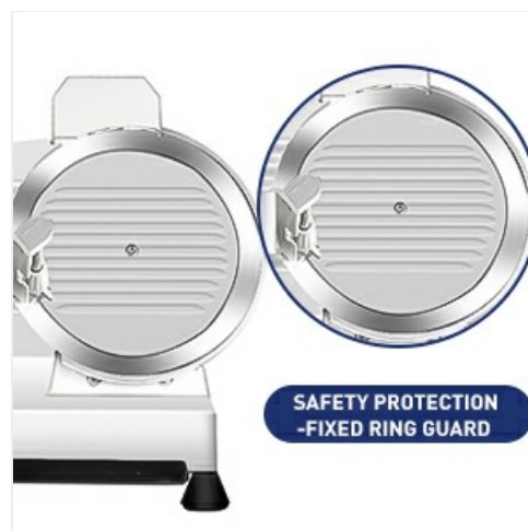
Image: Detail of the fixed ring guard, a safety component designed to prevent unintentional contact with the blade.