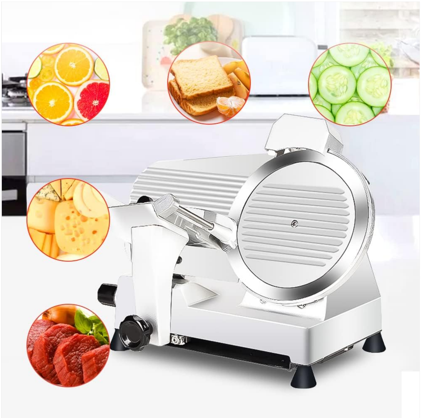
Image: The TUDALLK Electric Meat Slicer in operation, showing its capability to slice various food items such as meats, cheeses, bread, and vegetables.