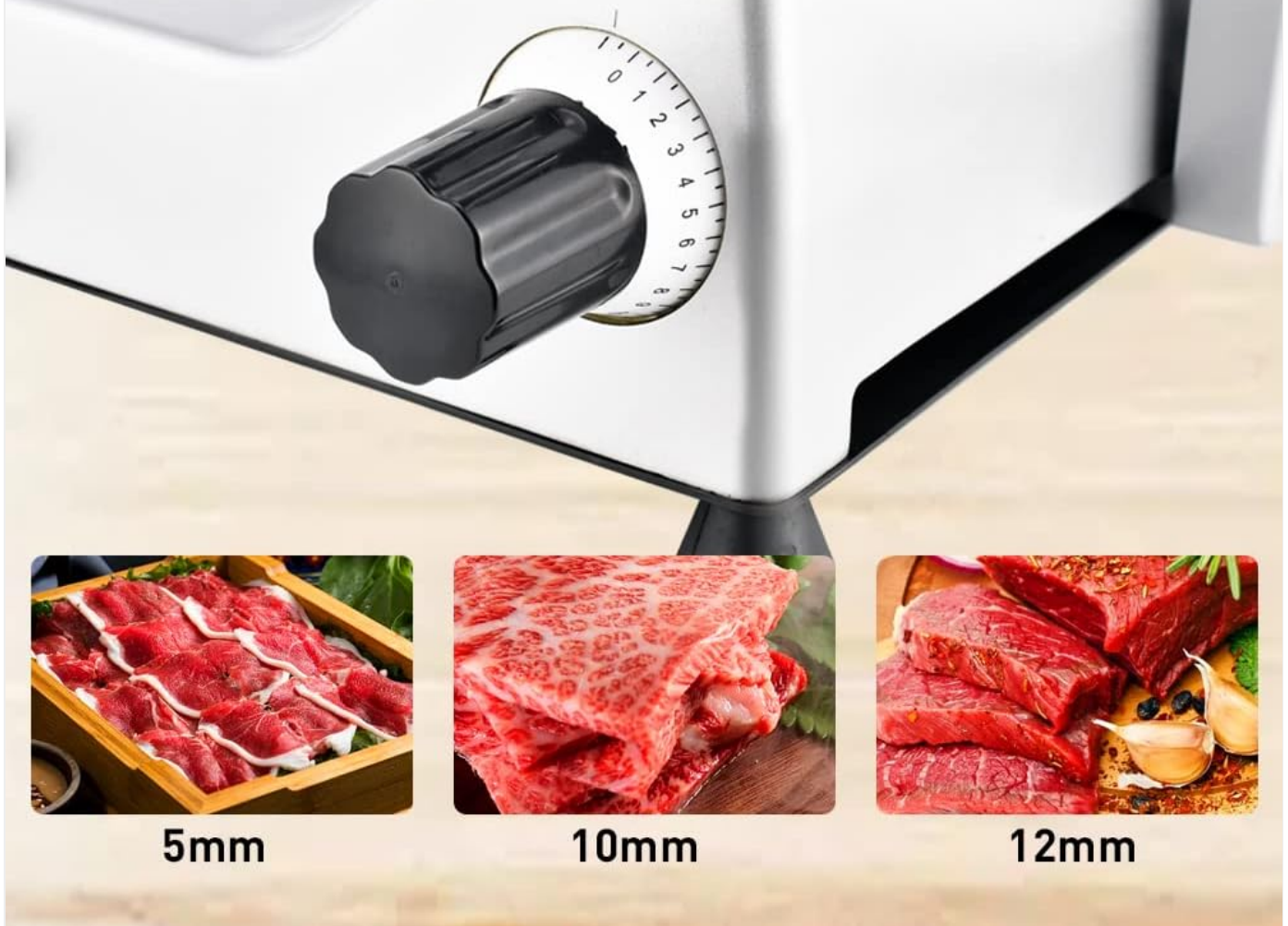
Image: The thickness adjustment knob, illustrating how to select slice thickness from 0mm to 12mm, with visual examples of meat slices at different thicknesses.