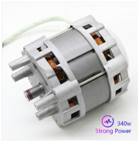
Image: An internal view of the 340W motor, indicating its strong power for slicing.