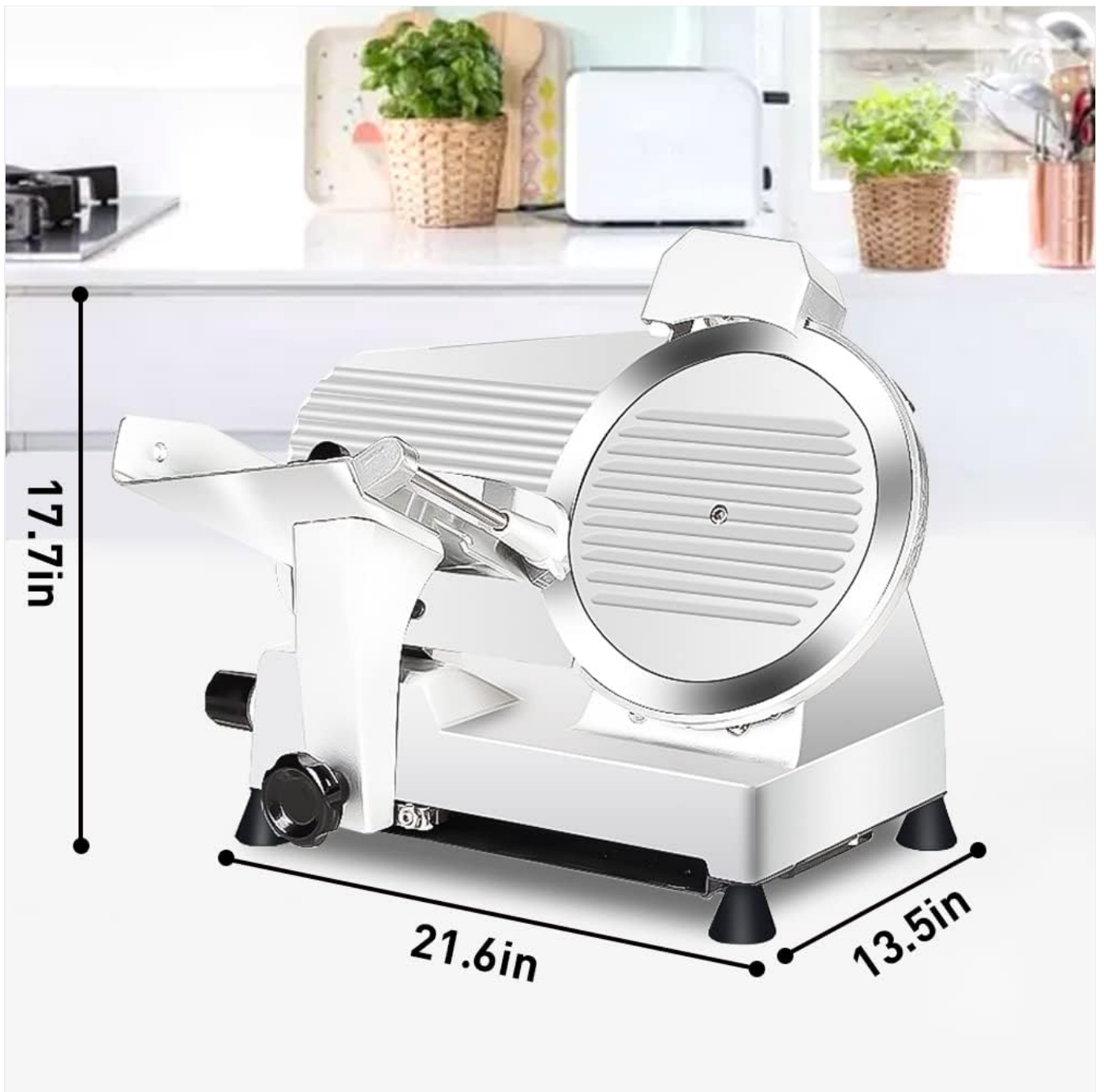
Image: Diagram showing the dimensions of the TUDALLK Electric Meat Slicer: 21.6 inches length, 13.5 inches width, and 17.7 inches height.