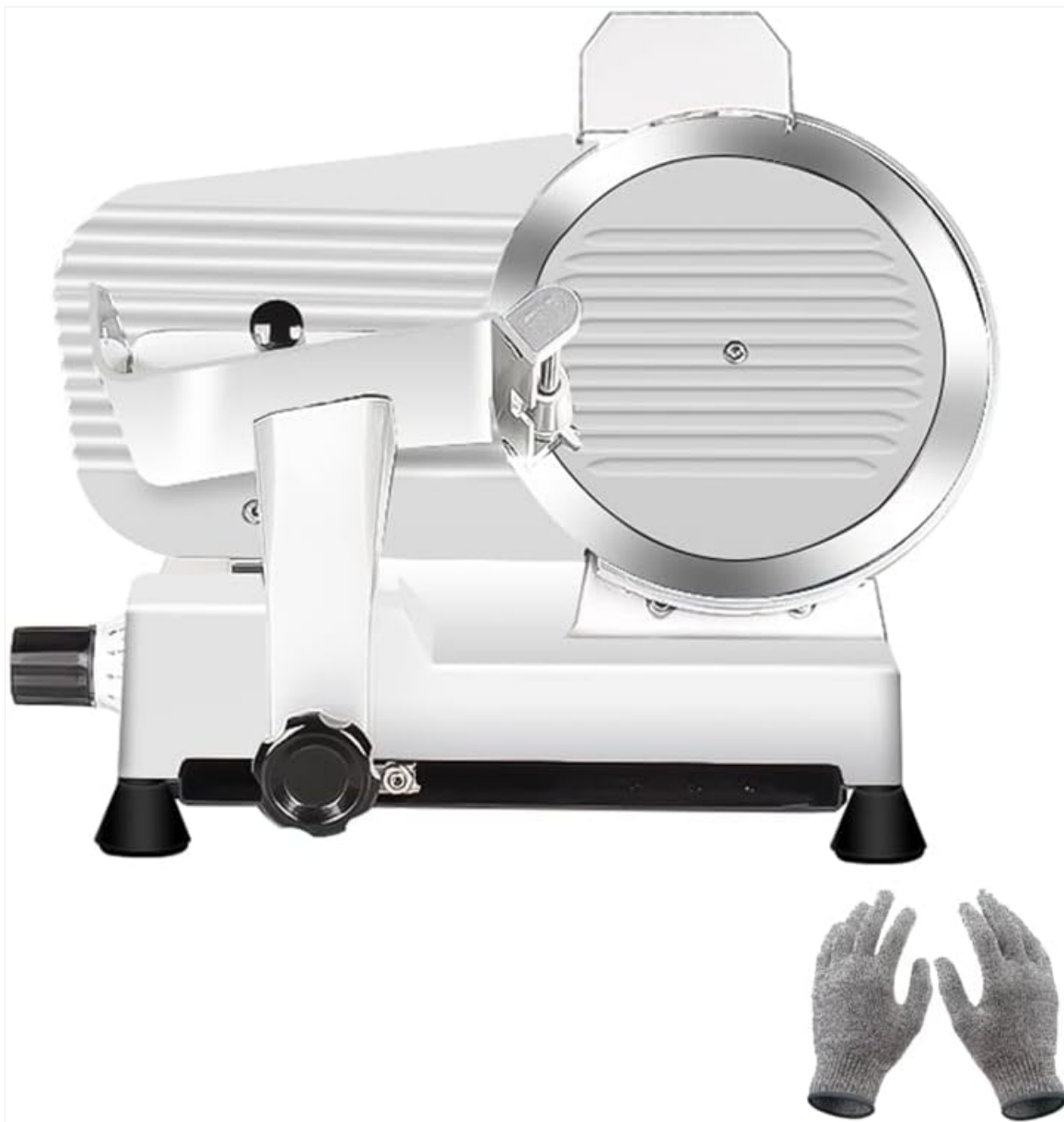
Image: The TUDALLK Electric Meat Slicer, ready for setup. Protective gloves are shown as a safety reminder.