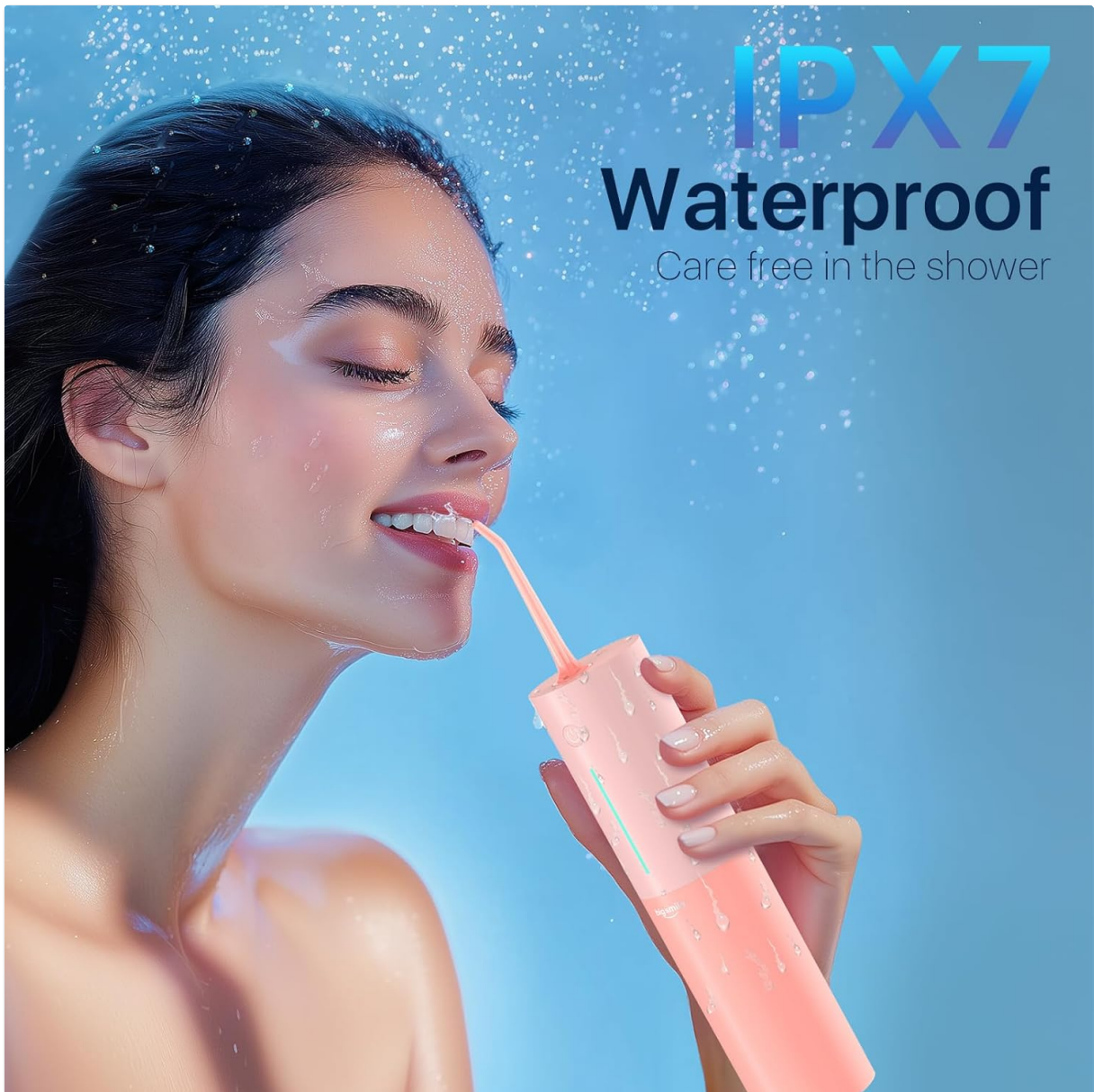
Image: A woman using the Bigsmile Water Flosser in a shower setting, demonstrating its IPX7 waterproof capability for convenient use.

The device is IPX7 waterproof, meaning it can withstand water pressure at a depth of 1 meter. This allows for use in the shower, but proper drying after use is still recommended.