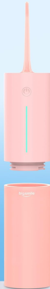
Image: The Bigsmile Water Flosser showing its 200ml detachable water reservoir, highlighting ease of filling and cleaning.