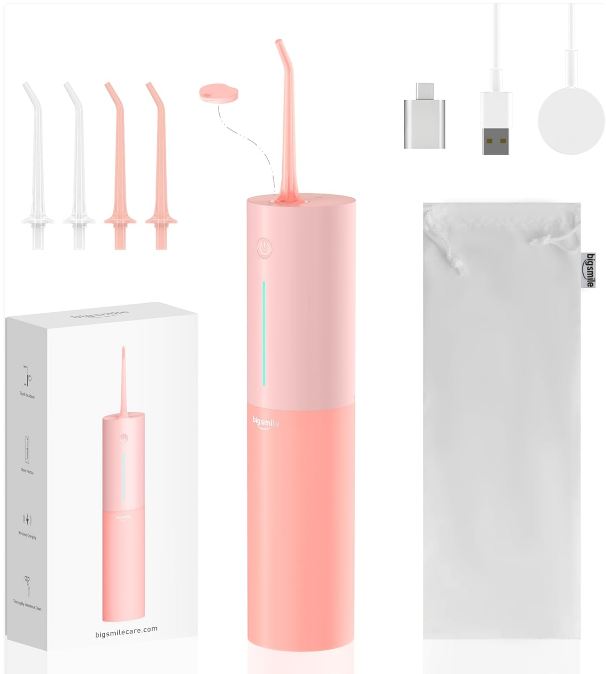
Image: All components of the Bigsmile Water Flosser package laid out, including the flosser unit, four tips, travel bag, magnetic charger, silicone dust cover, and USB adapter.

Note: A USB wall charger is not included.