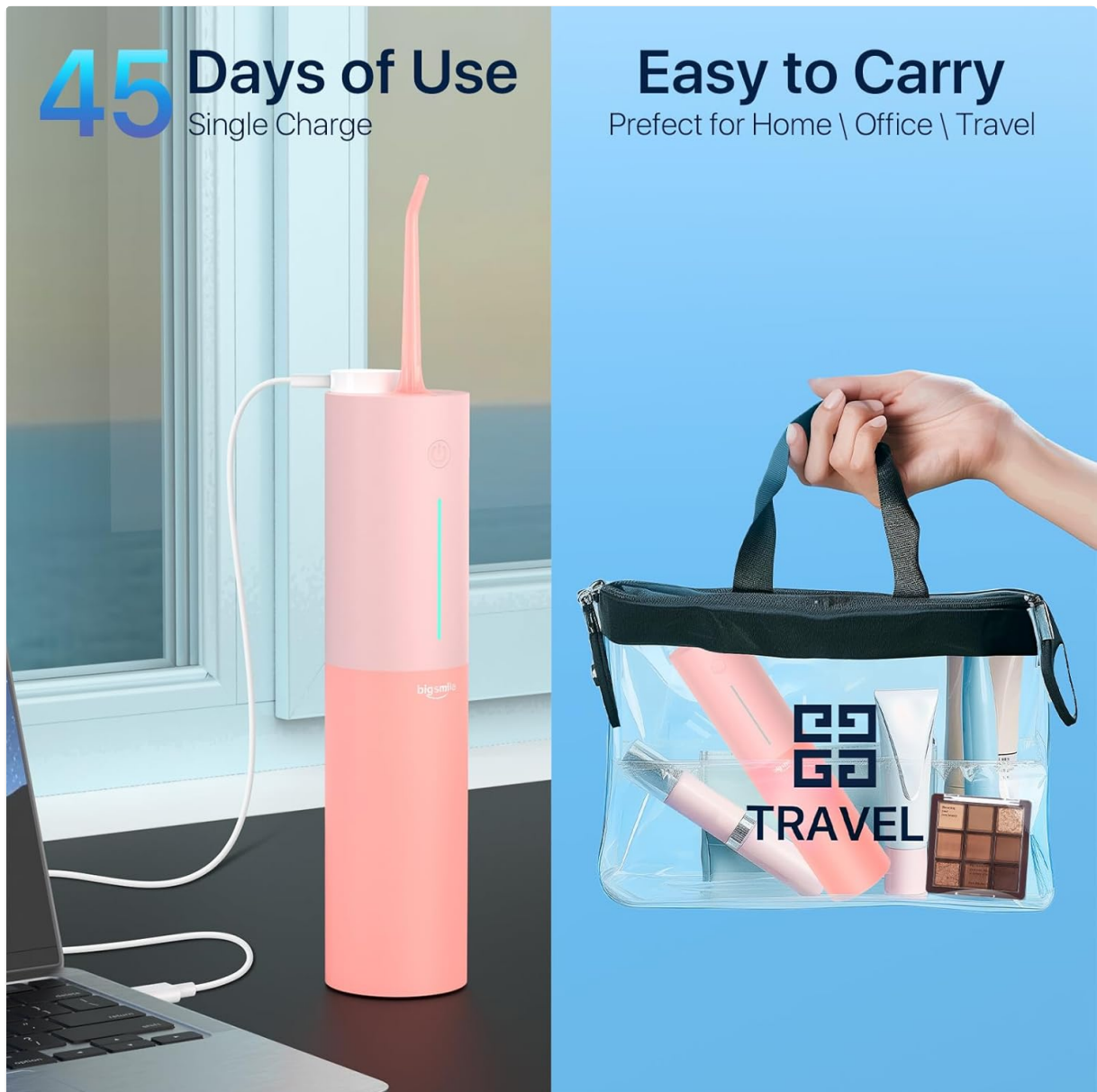
Image: The Bigsmile Water Flosser shown charging via its magnetic wireless charger, alongside its travel bag, illustrating its portability.