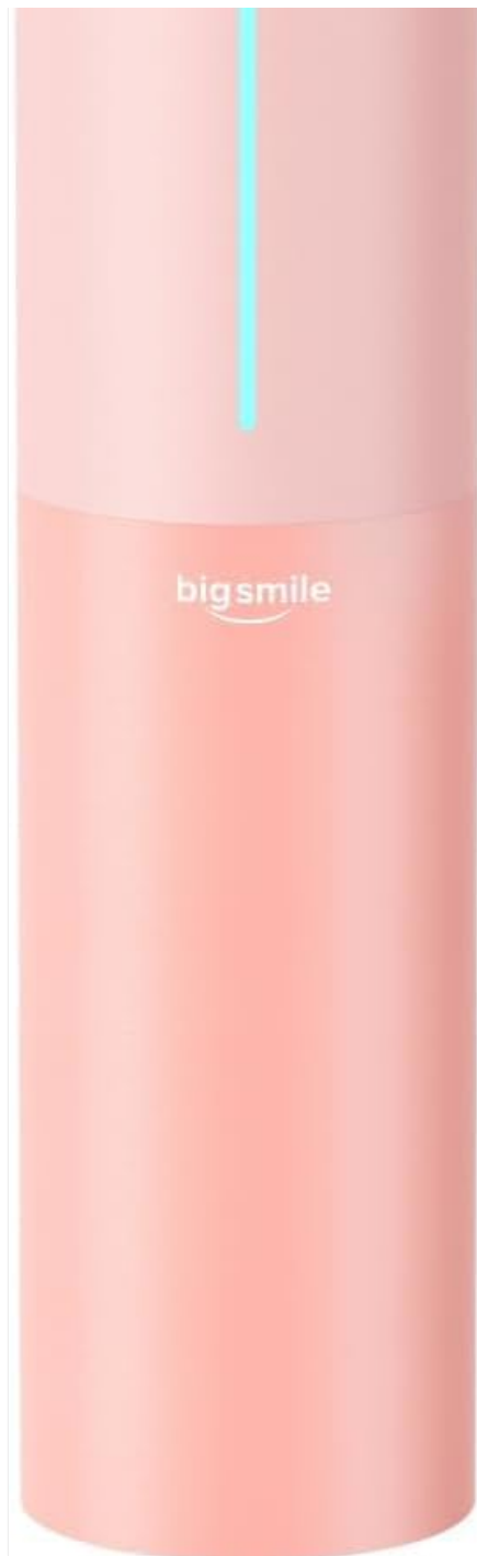
Image: The Bigsmile Pink Water Flosser, a cordless dental irrigator, shown upright with its nozzle attached.