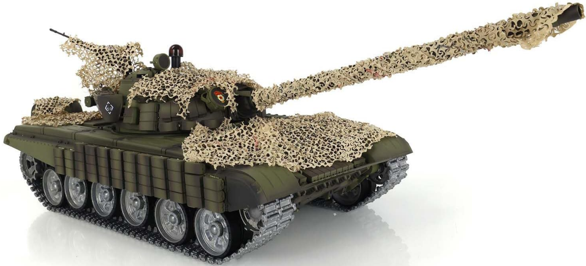
Figure 6.1: Detail of the tank's metal tracks and road wheels, highlighting robust construction.