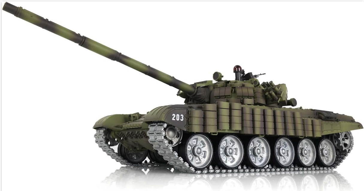
Figure 5.1: Side view of the tank, showing the main gun and turret details.