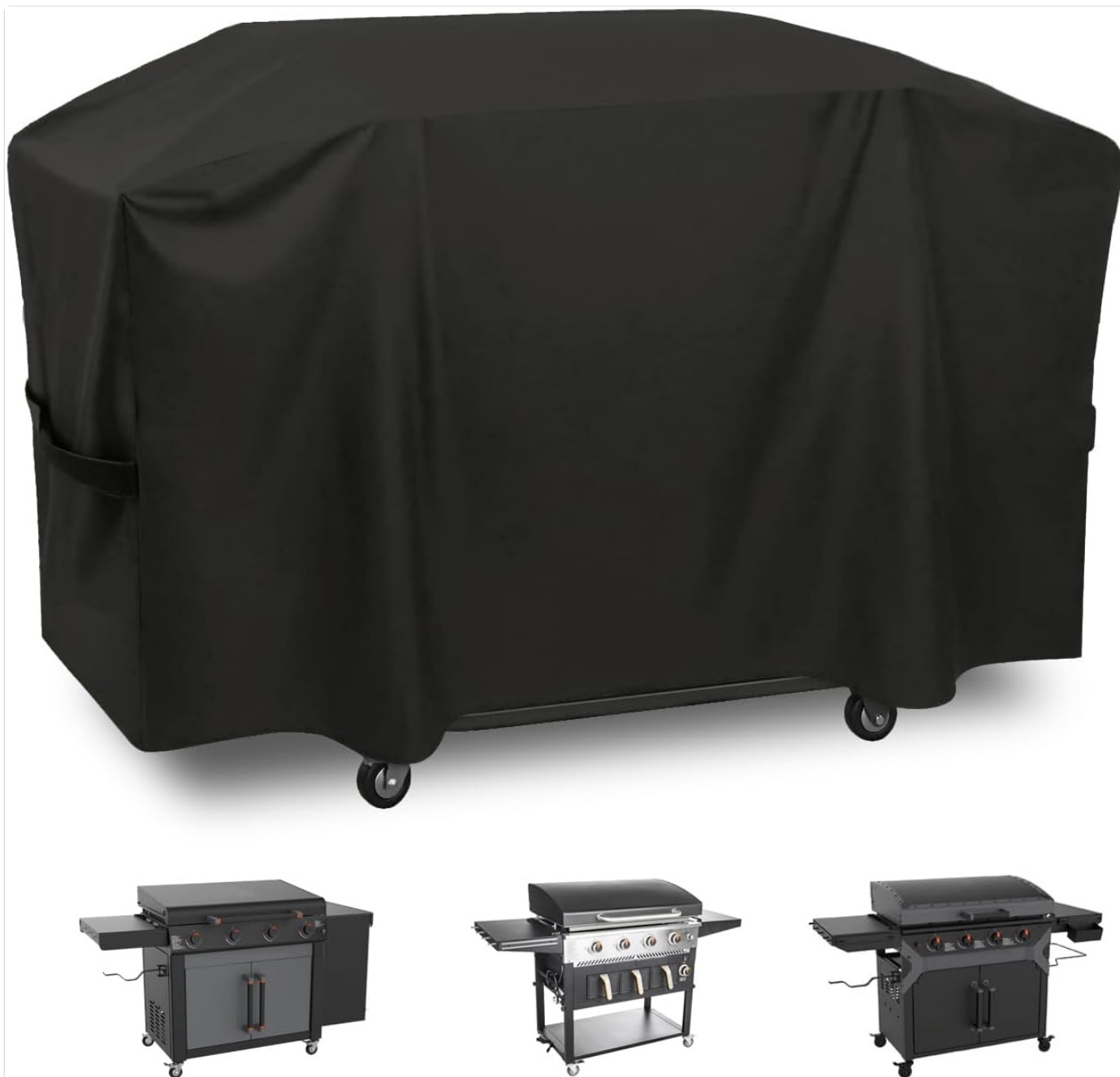
The ZJYWSCH grill cover providing full protection for an outdoor griddle.