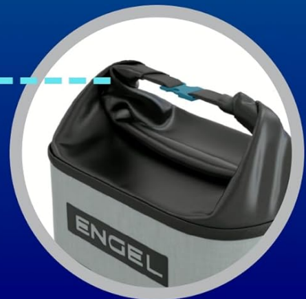
Image: Detailed view of the cooler's roll-top wide mouth opening, showing how it rolls closed to seal watertight and buckles into a carry handle.