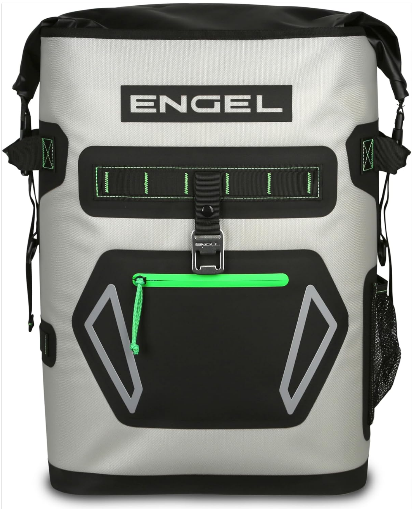
Image: Front view of the Engel BP25 Backpack Cooler in Dark Gray/Lime, showcasing its sleek design and the prominent ENGEL logo.