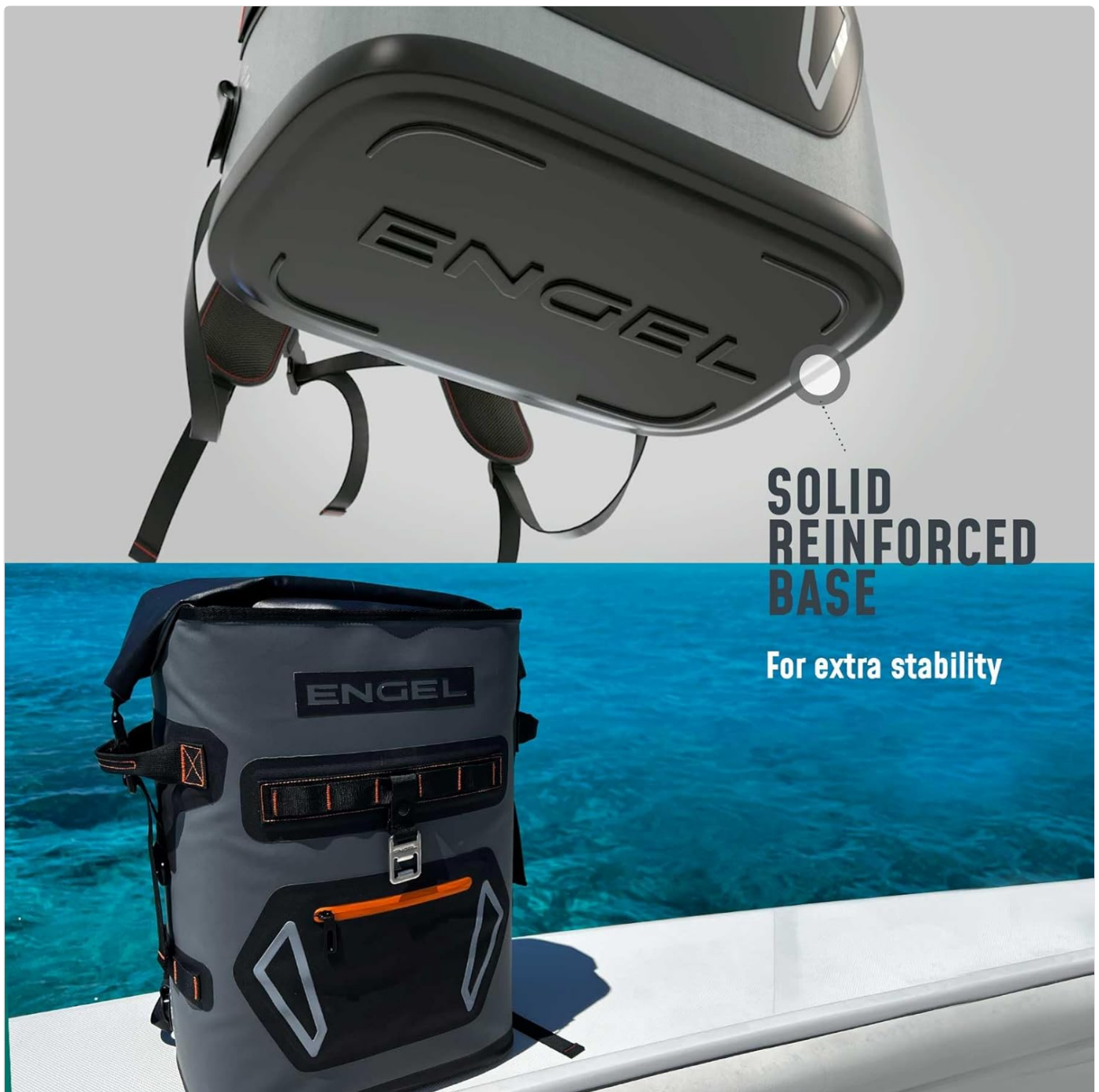
Image: The solid reinforced base of the Engel BP25 cooler, providing extra stability.

Your browser does not support the video tag.