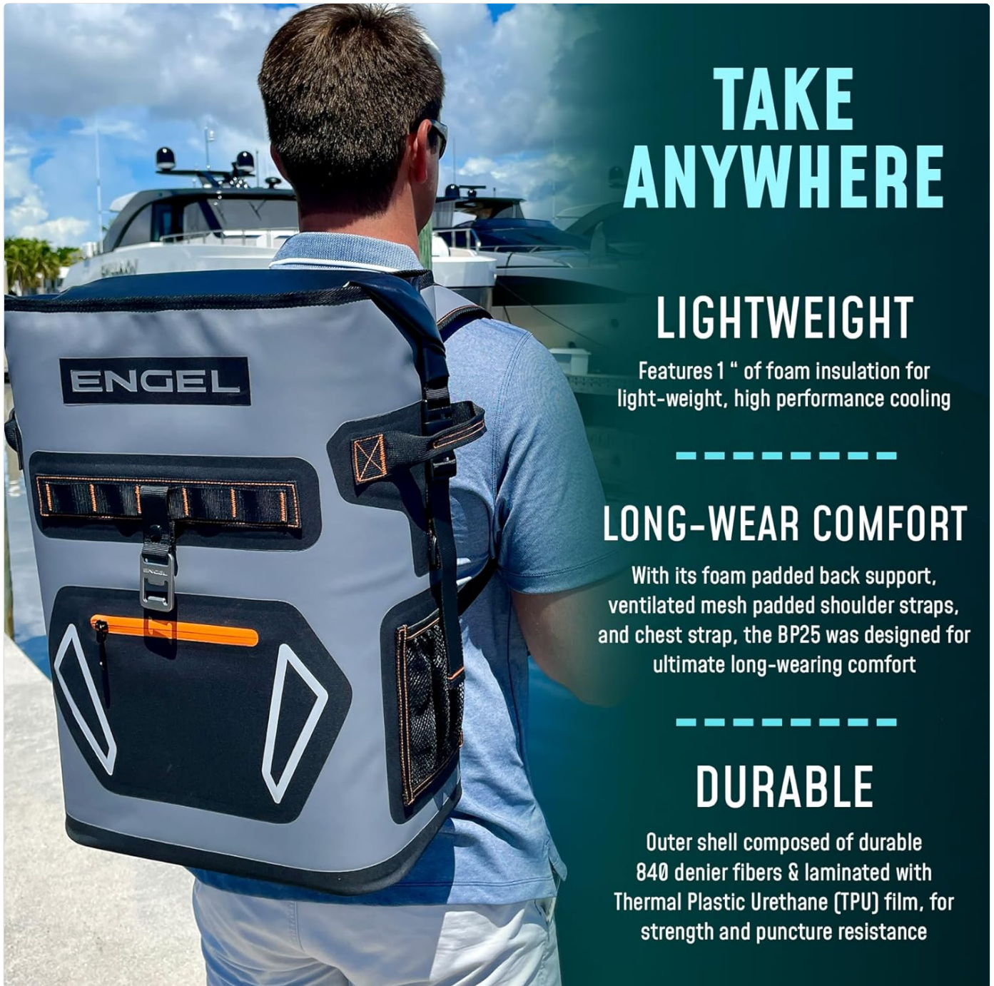
Image: A person wearing the Engel BP25 Backpack Cooler, demonstrating its comfortable fit and highlighting its lightweight, long-wear comfort, and durable construction.

Outer shell composed of durable 840 denier fibers & laminated with Thermal Plastic Urethane (TPU) film, for strength and puncture resistance