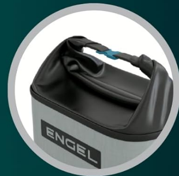
Image: A visual guide illustrating the four different ways to carry the Engel BP25 cooler: back grab handle, side grab handles, shoulder straps with chest straps, and the roll-top sealed into a top handle.

ROLL TOP SEALS & SNAPS INTO A TOP HANDLE