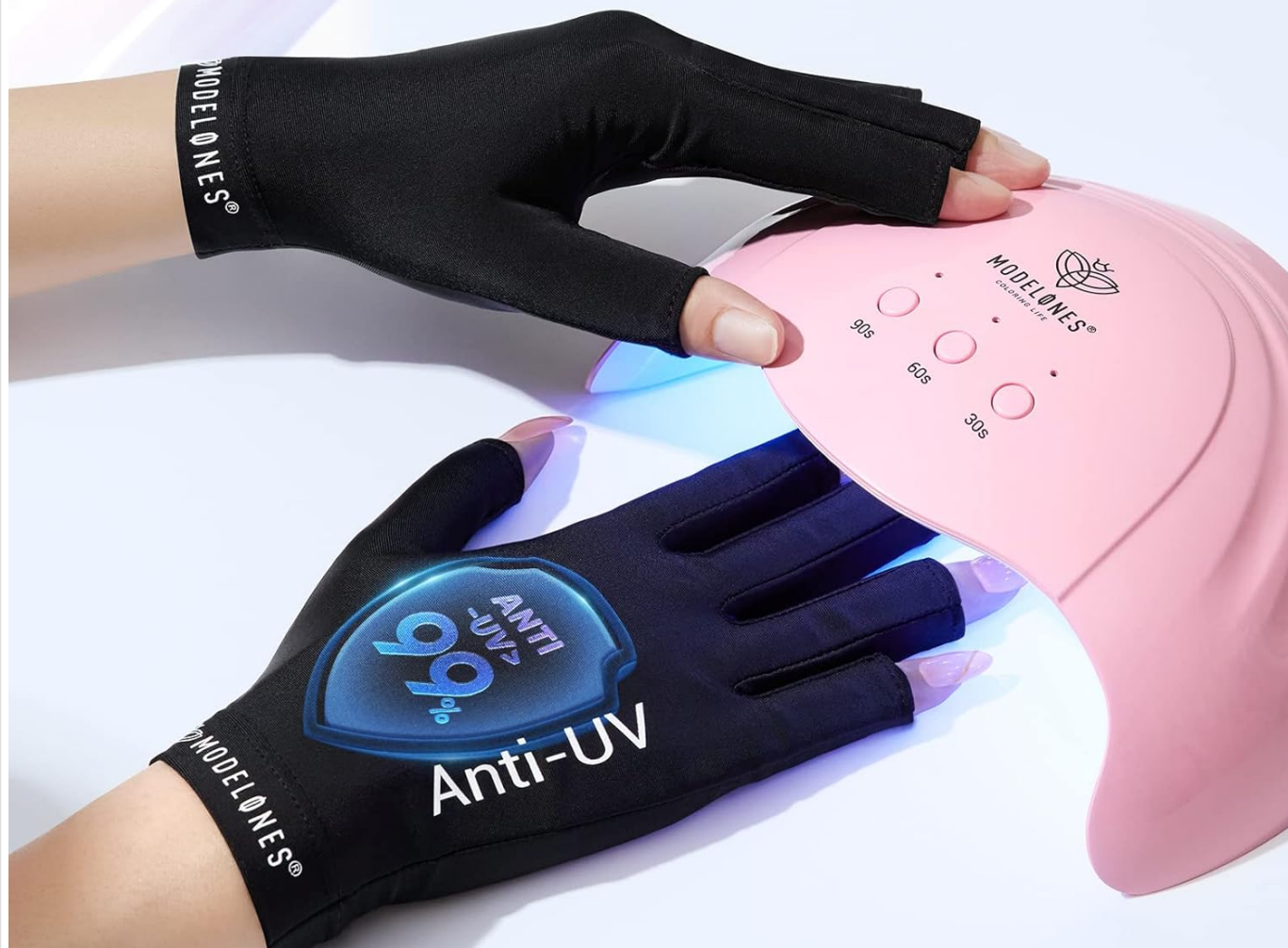
Figure 3: Always wear the provided UV protection gloves during the curing process.