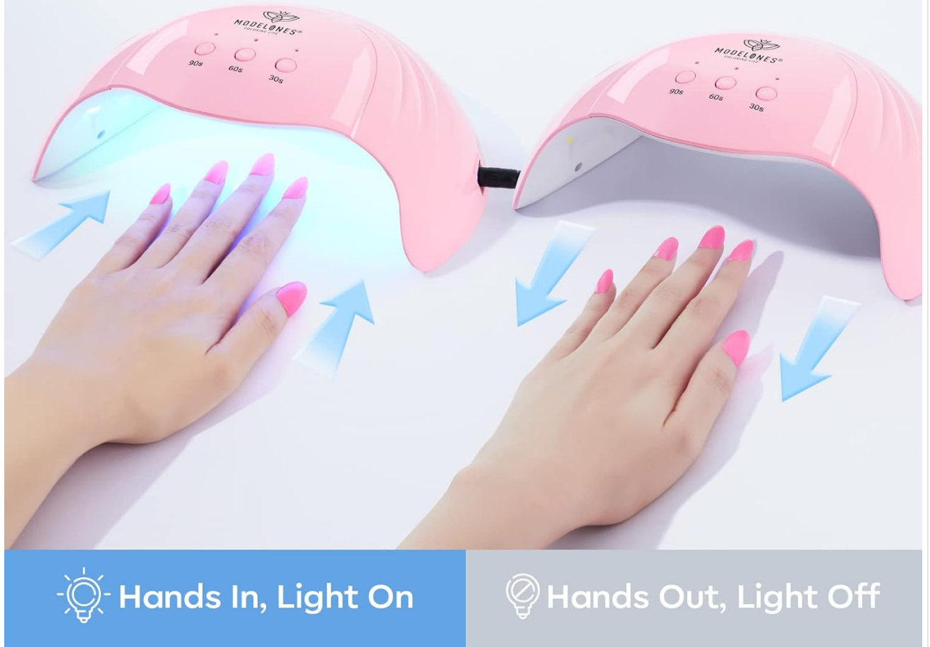
Figure 5: The smart sensor activates the lamp when hands are inserted and turns it off when removed.

It automatically starts once you put it in your hands, making it easier to use and ensuring the best cure for the time you choose.