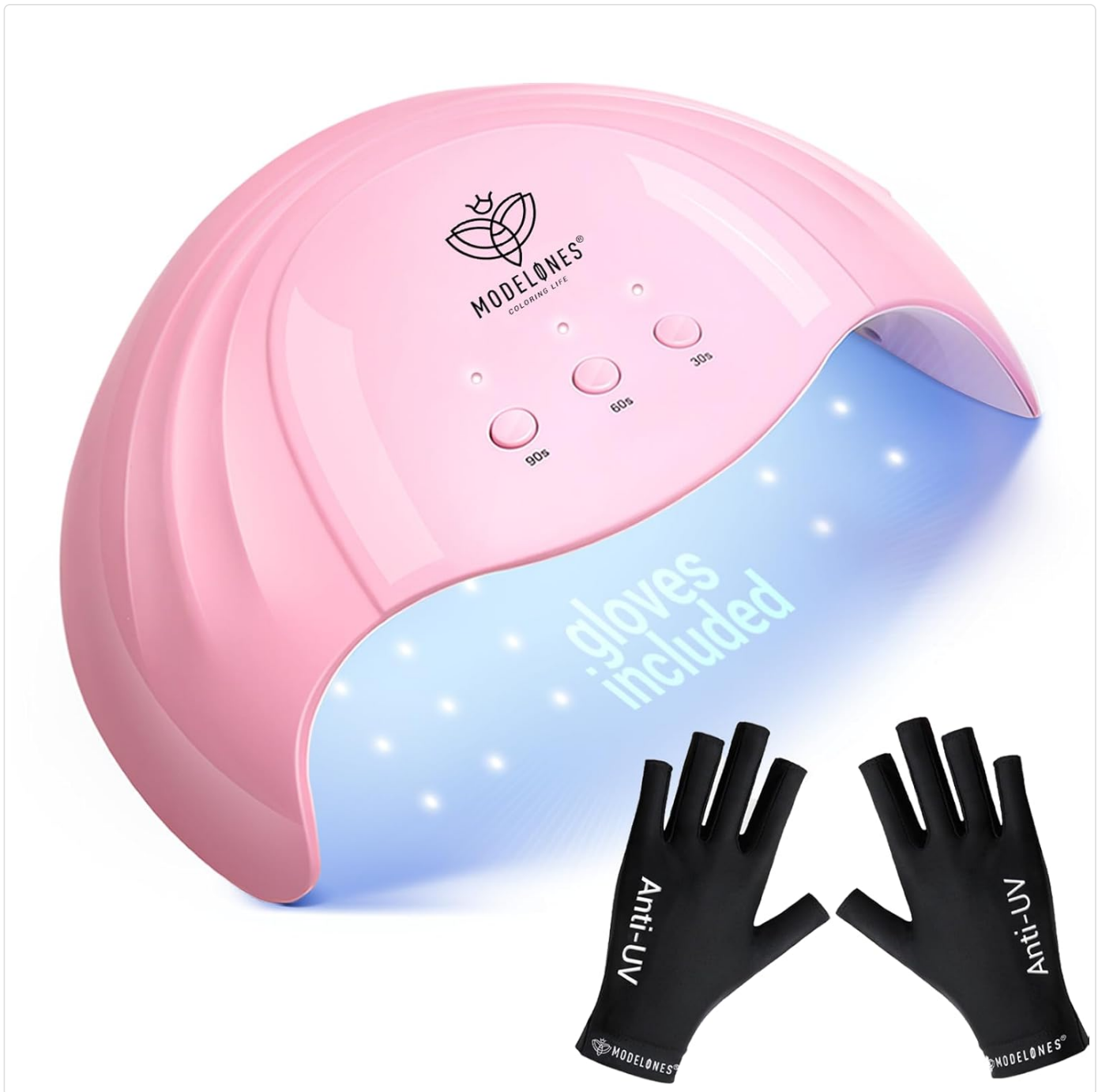
Figure 1: Modelones 48W UV/LED Nail Lamp and included UV Protection Gloves.