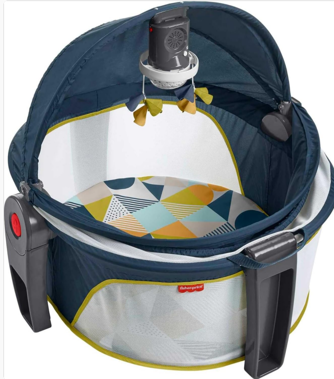
Figure 2.1: The Fisher-Price Portable Baby Bassinet Deluxe On-The-Go Projection Dome in its open configuration.