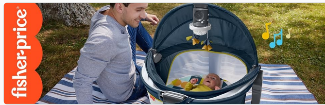
Figure 4.2: Starlight projection creates a soothing environment for sleep.