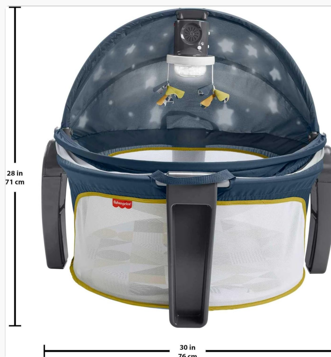
Figure 7.1: Product dimensions for the bassinet.