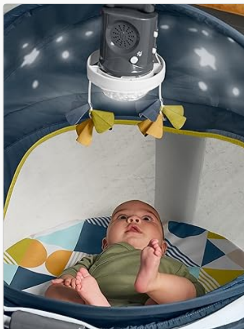
Figure 5.1: The mattress pad is designed for easy wiping.