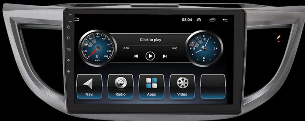
Image 1.1: The Yoidesu 10-inch Car Radio Stereo with its main interface.