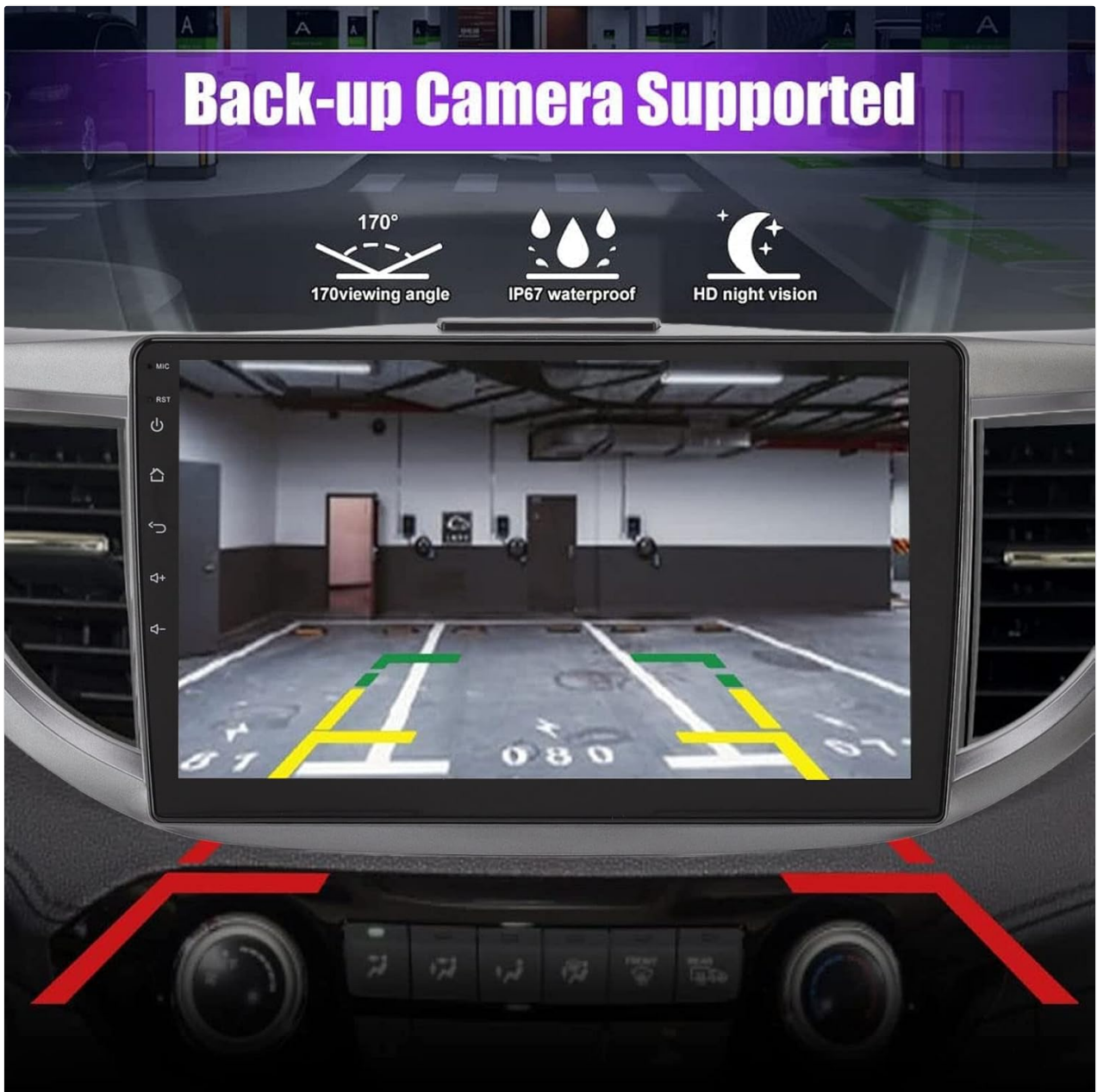
Image 5.2: Rear view camera display with parking assistance lines.

The system supports high-definition rear view camera input (camera sold separately). When the vehicle is shifted into reverse, the rear view image will automatically display on the screen, assisting with safer parking. The system offers excellent night vision capabilities.