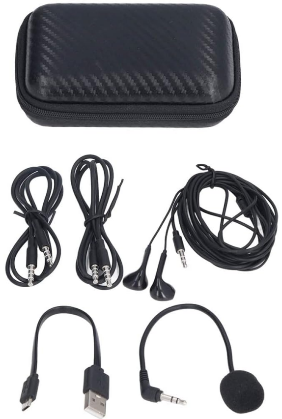
Image: The I9 Voice Changer device shown with all included accessories: the voice changer unit, a small clip-on microphone, in-ear monitoring earphones, a USB charging cable, two audio connection cables, and a compact carbon fiber textured storage case.