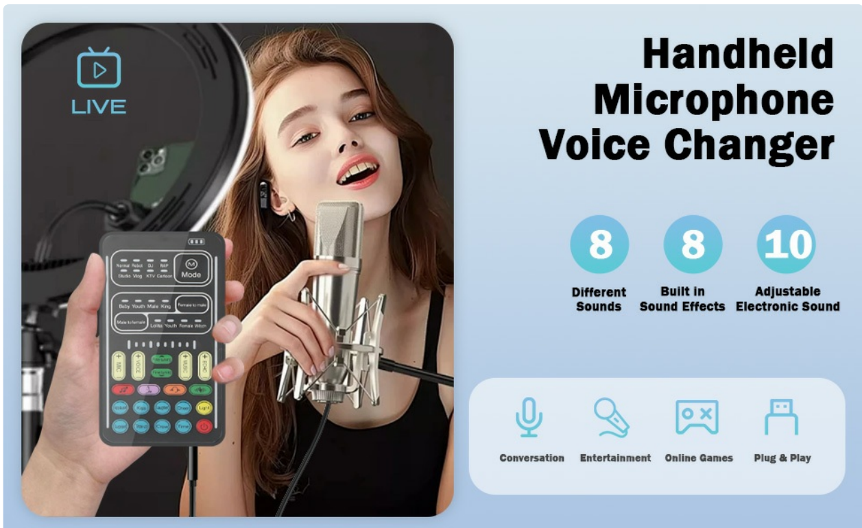
Image: A detailed view of the I9 Voice Changer's control panel, labeling 8 live broadcast modes (Normal, Robot, DJ, RAP, Studio, Vlog, KTV, Cartoon), 8 voice changing modes (Baby, Youth, Male, King, Female to male, Male to female, Lolita, Youth, Female Witch), fine-tuning controls, and 10-step electronic sound adjustment. It emphasizes its small and multifunctional design.

Image: An infographic highlighting key features of the I9 Voice Changer, including six cores, 16 sound modes, 80 kinds of voice changer, smart bel canto tuning, one-click noise reduction, one-click flash, accompaniment music, built-in functions, one-button ear return, key to cancel original sound, reverb adjustment, power display, 8 groups of ambiance effects, 10th order electronic sound, cool lights, and long battery life.