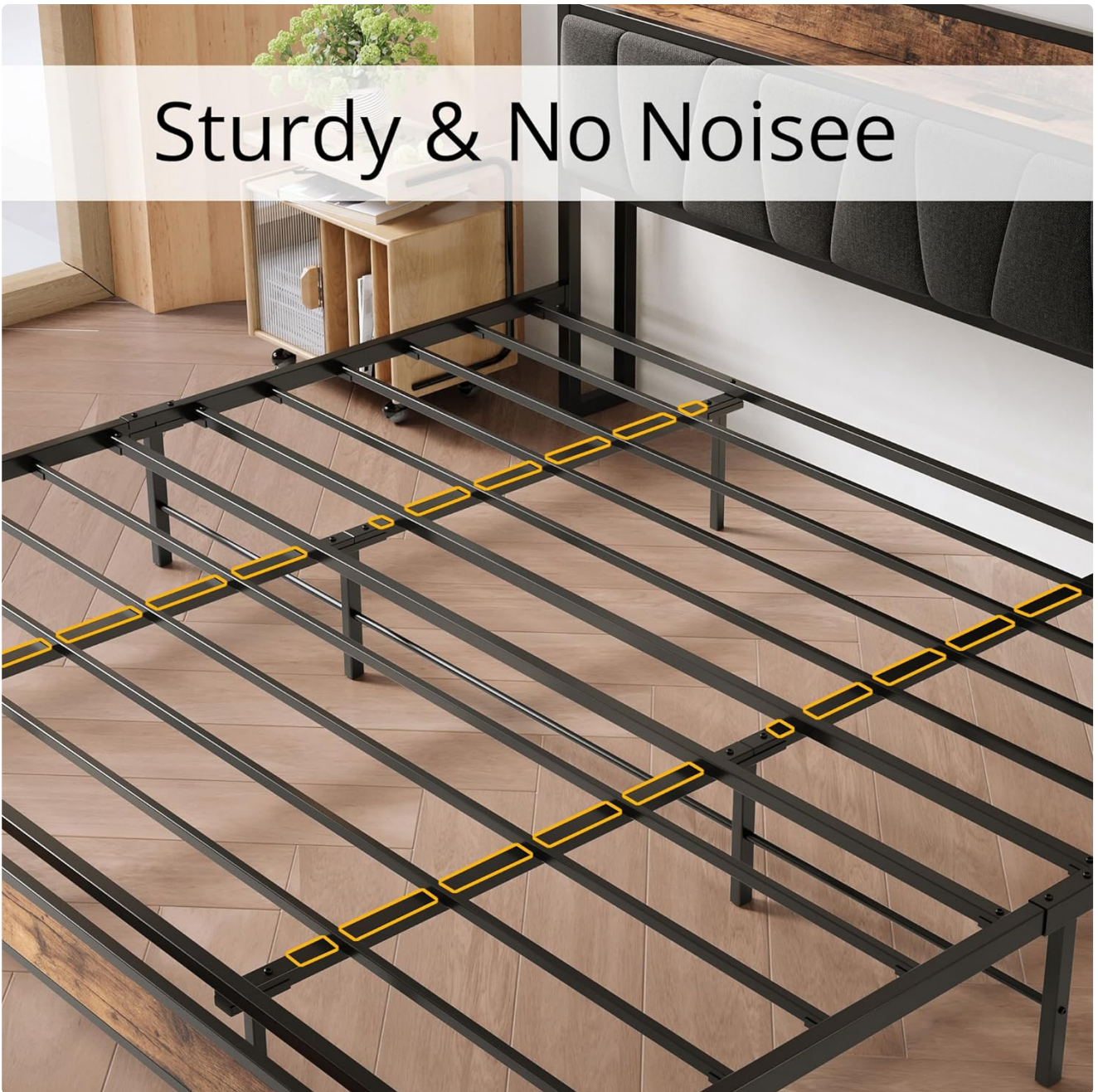
Image: The bed frame's slat system designed for sturdiness and noise reduction.