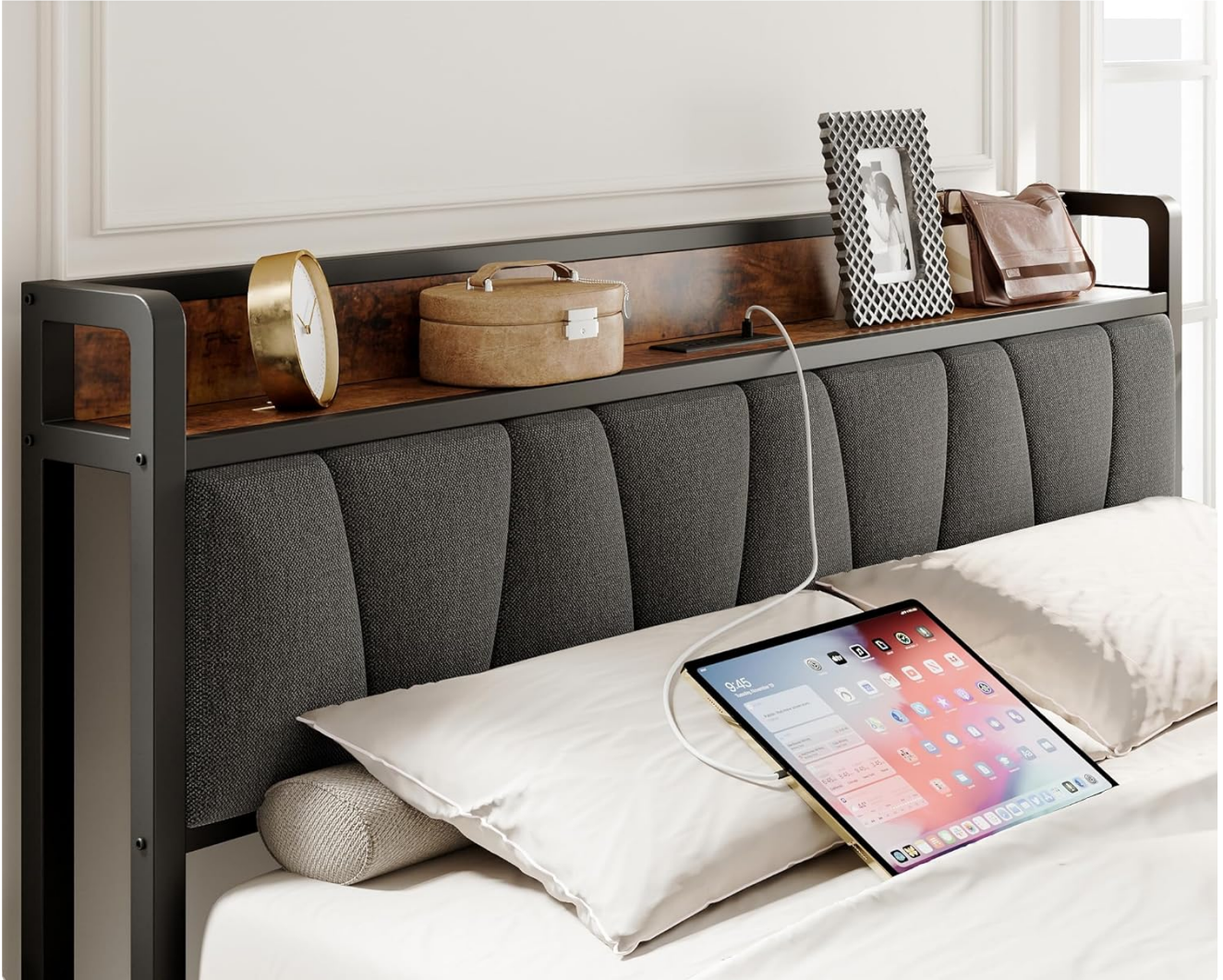
Image: The storage headboard with integrated USB ports and power outlets for convenient charging.