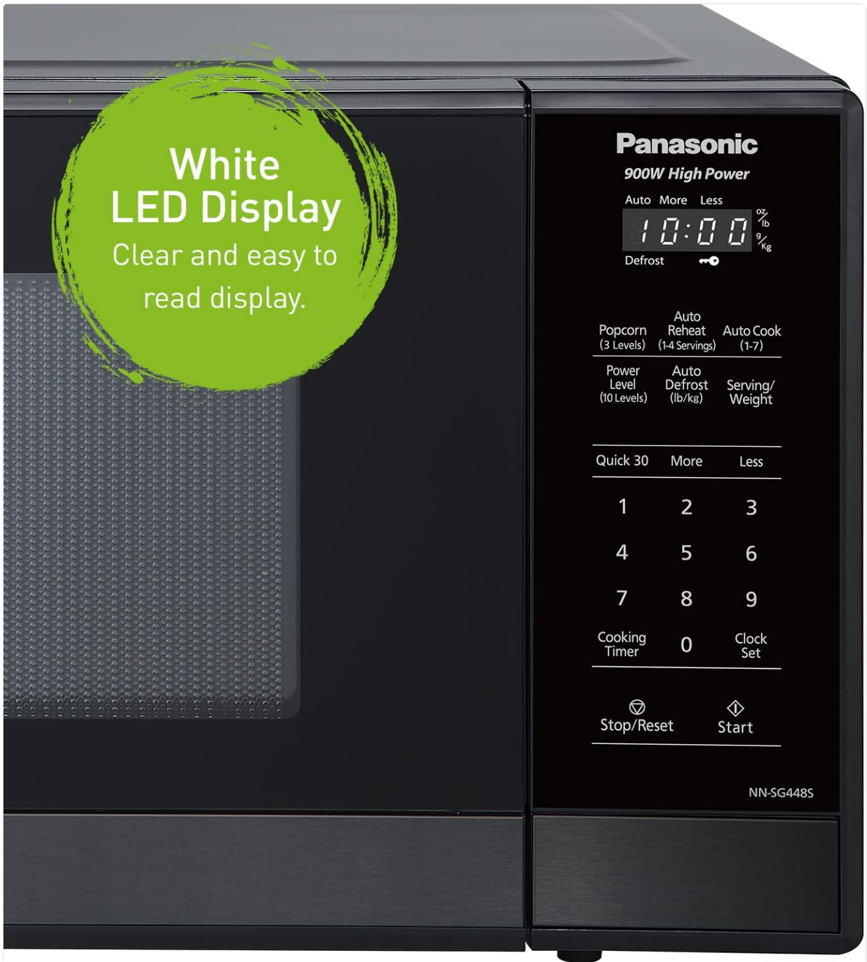
Figure 4.2: Close-up of the control panel with a white LED display, showing various function buttons and numerical keypad.