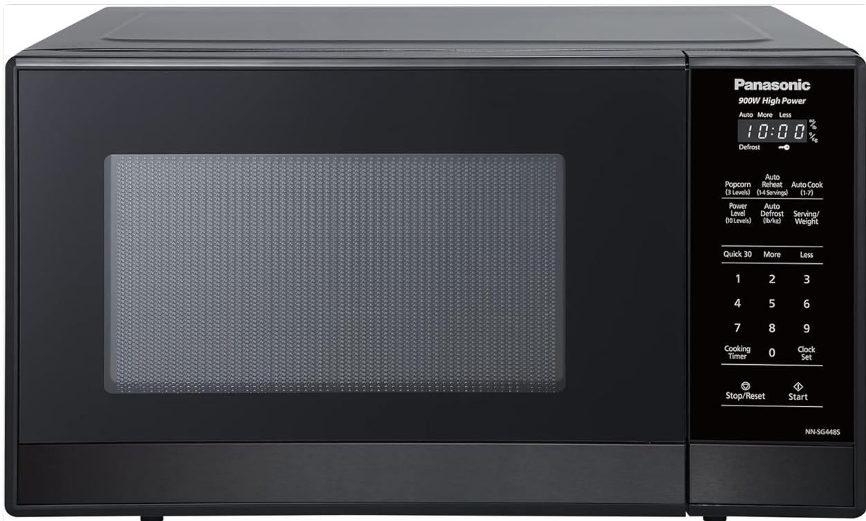
Figure 4.1: Front view of the Panasonic NNSG448S microwave oven, showcasing its sleek black stainless steel finish and glass door.

The Panasonic NNSG448S is a compact 900W microwave oven featuring a black stainless steel design and a black glass door. It is equipped with a clear white LED display and an intuitive control panel for various cooking functions.