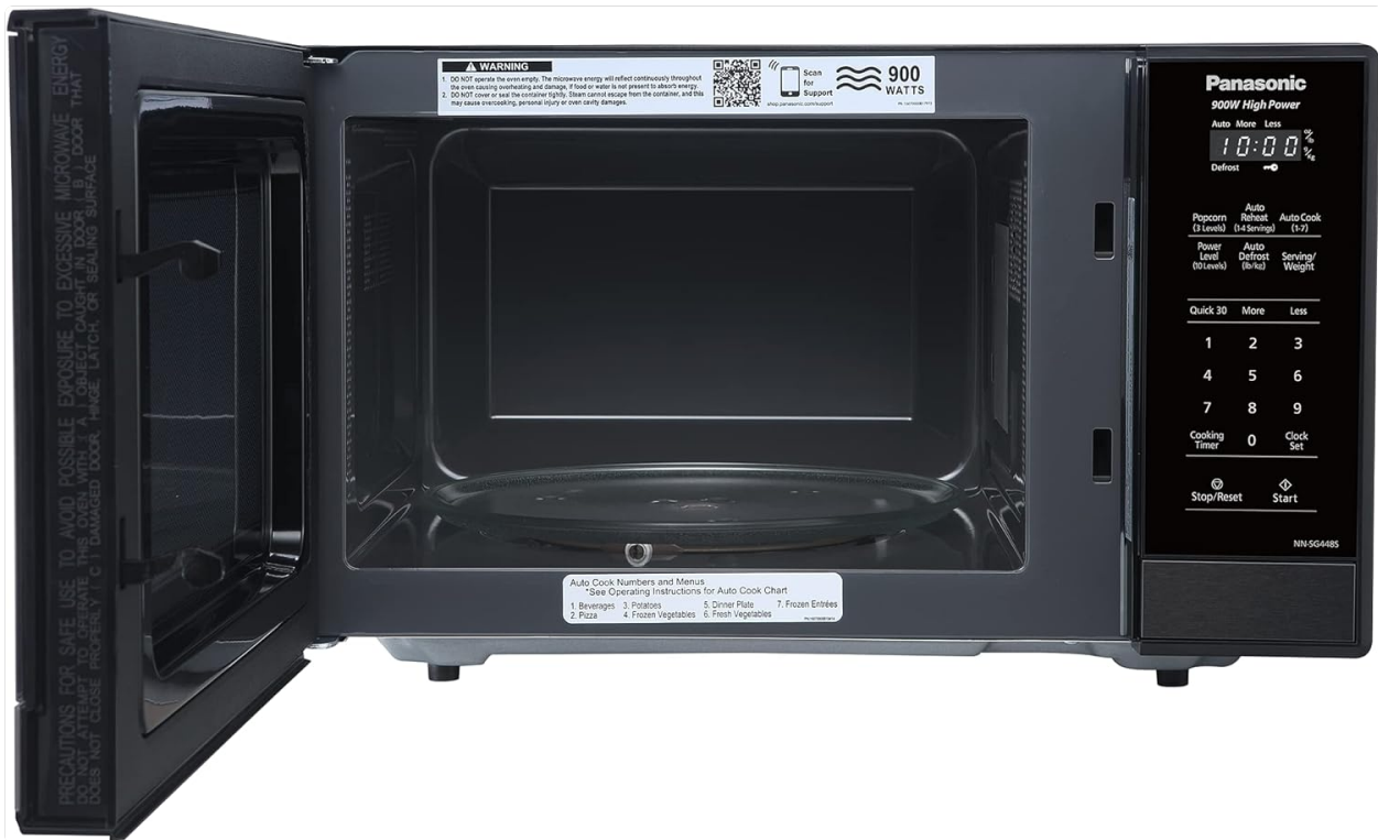
Figure 5.1: Dimensions of the microwave oven: 48.5 cm (width) x 37.5 cm (depth) x 29.3 cm (height).