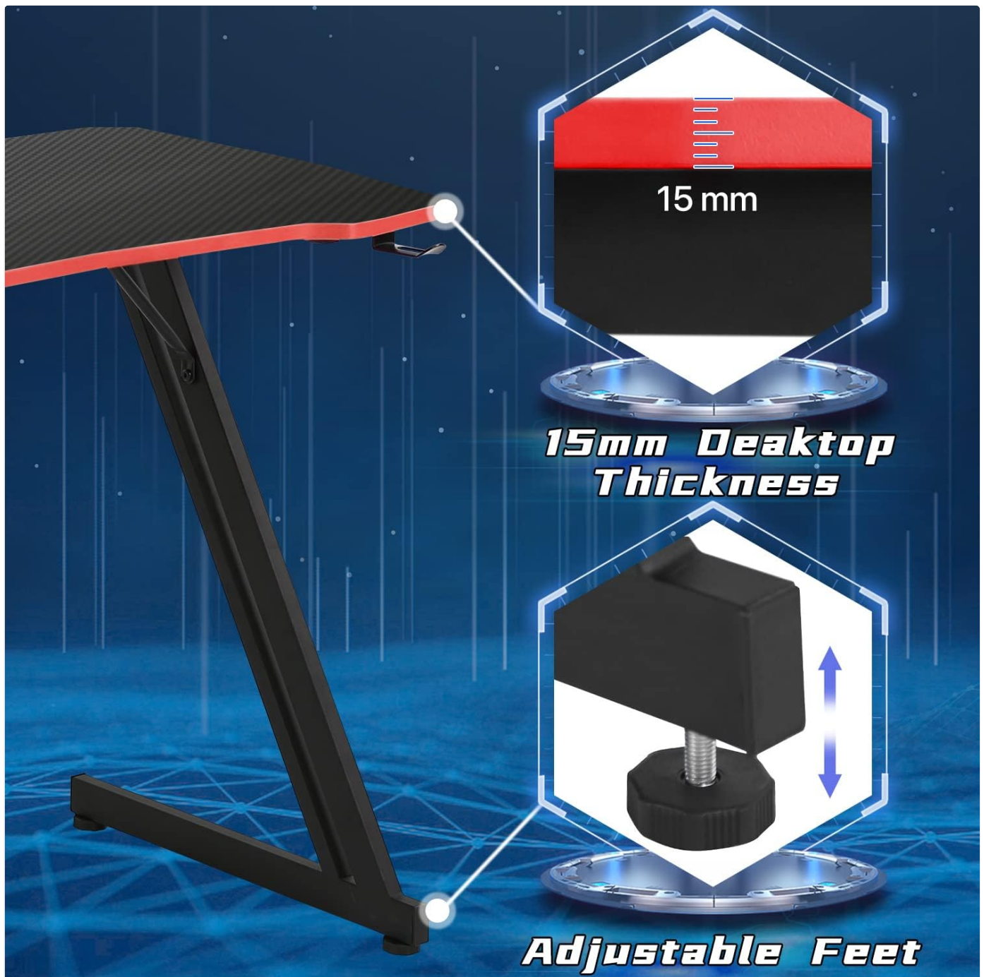
Image: Illustration of the desktop thickness and the adjustable feet mechanism for stability on various floor types.