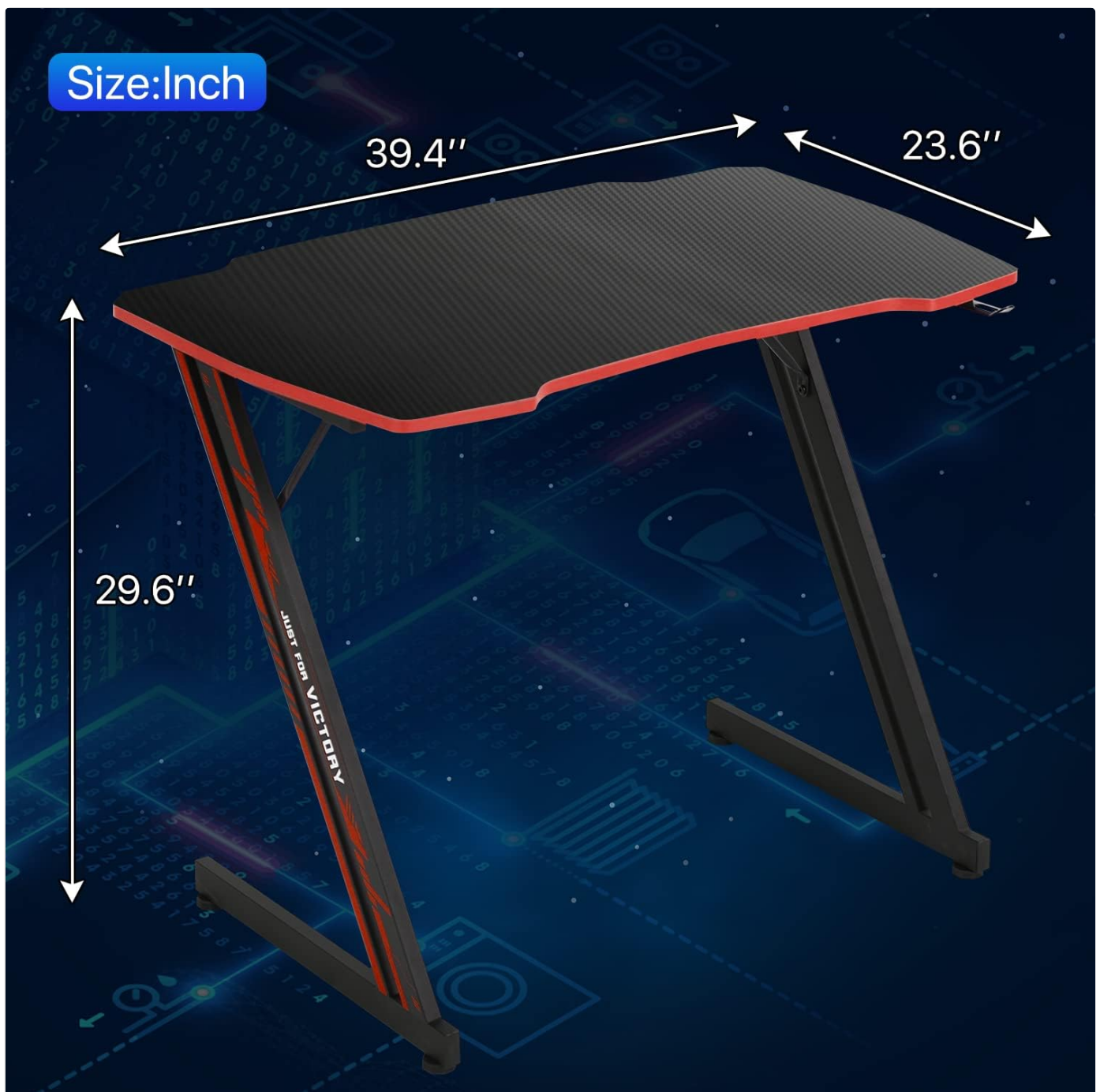
Image: Dimensional overview of the Dkelincs Gaming Desk.