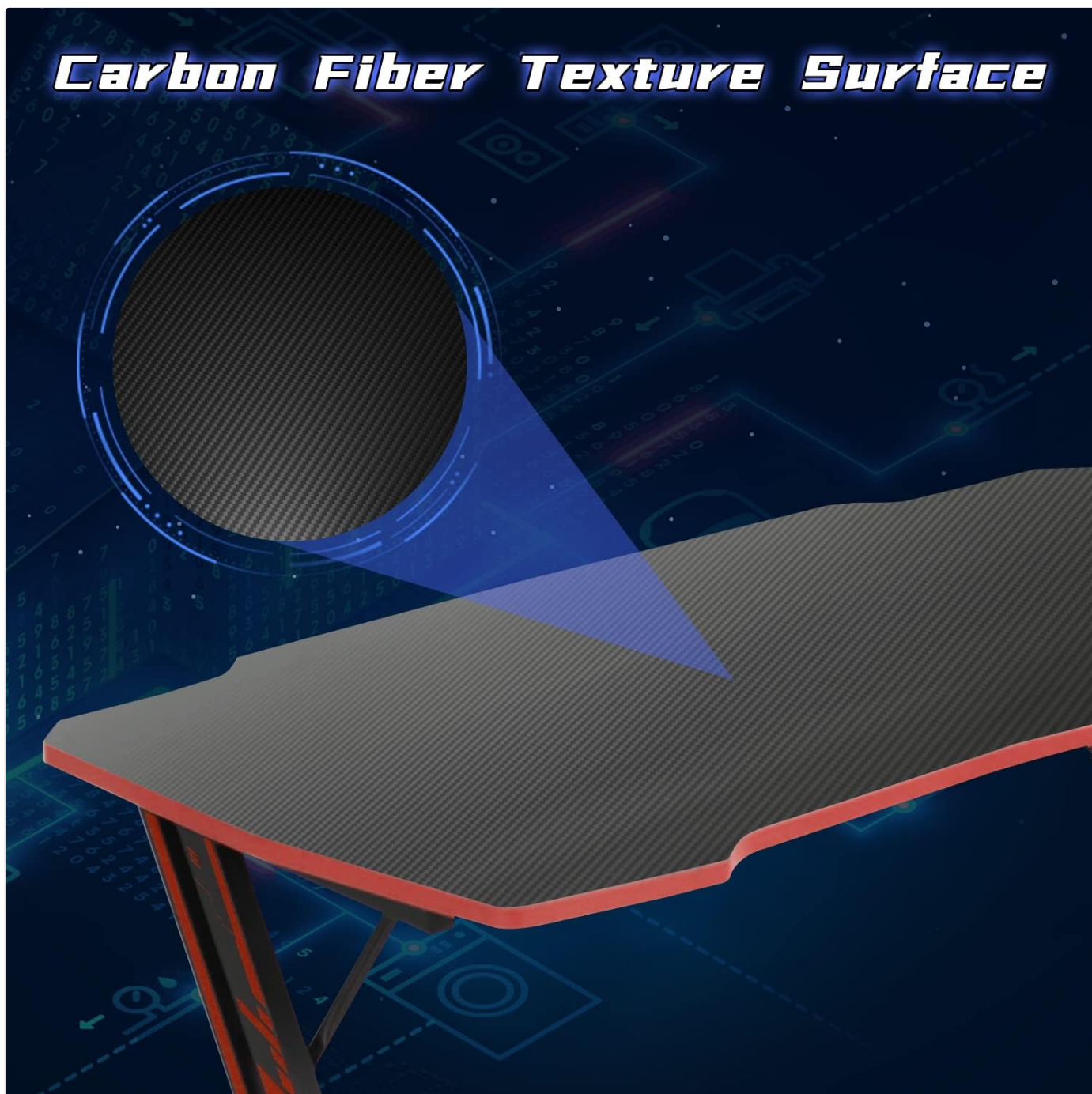
Image: The carbon fiber textured surface, designed for durability and easy cleaning.