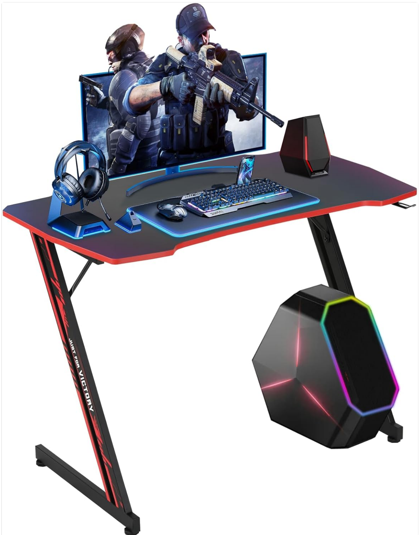
Image: The Dkelincs 39-inch Z-Shaped Gaming Desk, showcasing its design and capacity for a complete gaming setup.