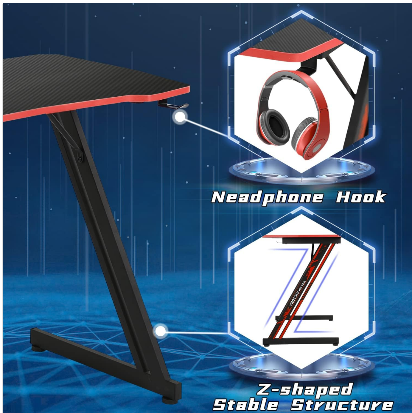
Image: Detail of the Z-shaped leg design for stability and the convenient headphone hook.