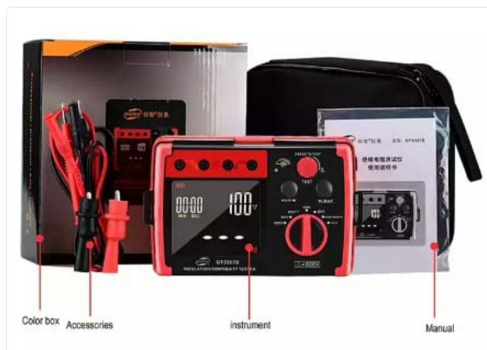
Image: The GT5307B tester, its color box packaging, accessories (test leads), carrying case, and user manual.