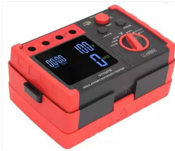
Image: Close-up view of the GT5307B's front panel, showing the LCD display, rotary switch, and control buttons.