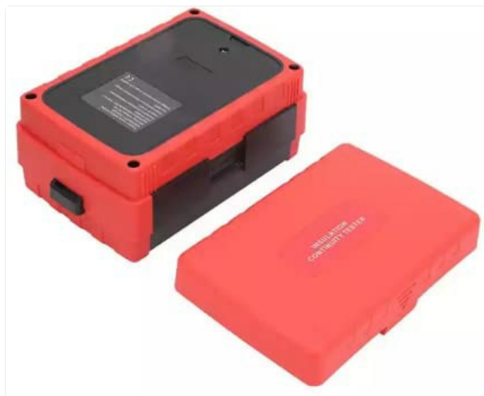
Image: Front view of the VIHELM GT5307B Insulation Resistance Tester, showcasing its robust red and black casing.

The VIHELM GT5307B is a professional-grade insulation resistance tester designed for accurate measurement of insulation resistance, AC/DC voltage, and small resistance. This device is essential for electrical maintenance, testing, and troubleshooting in various industrial and scientific applications. It features a large LCD screen for clear readings, automatic discharge, and high voltage alarm for user safety.