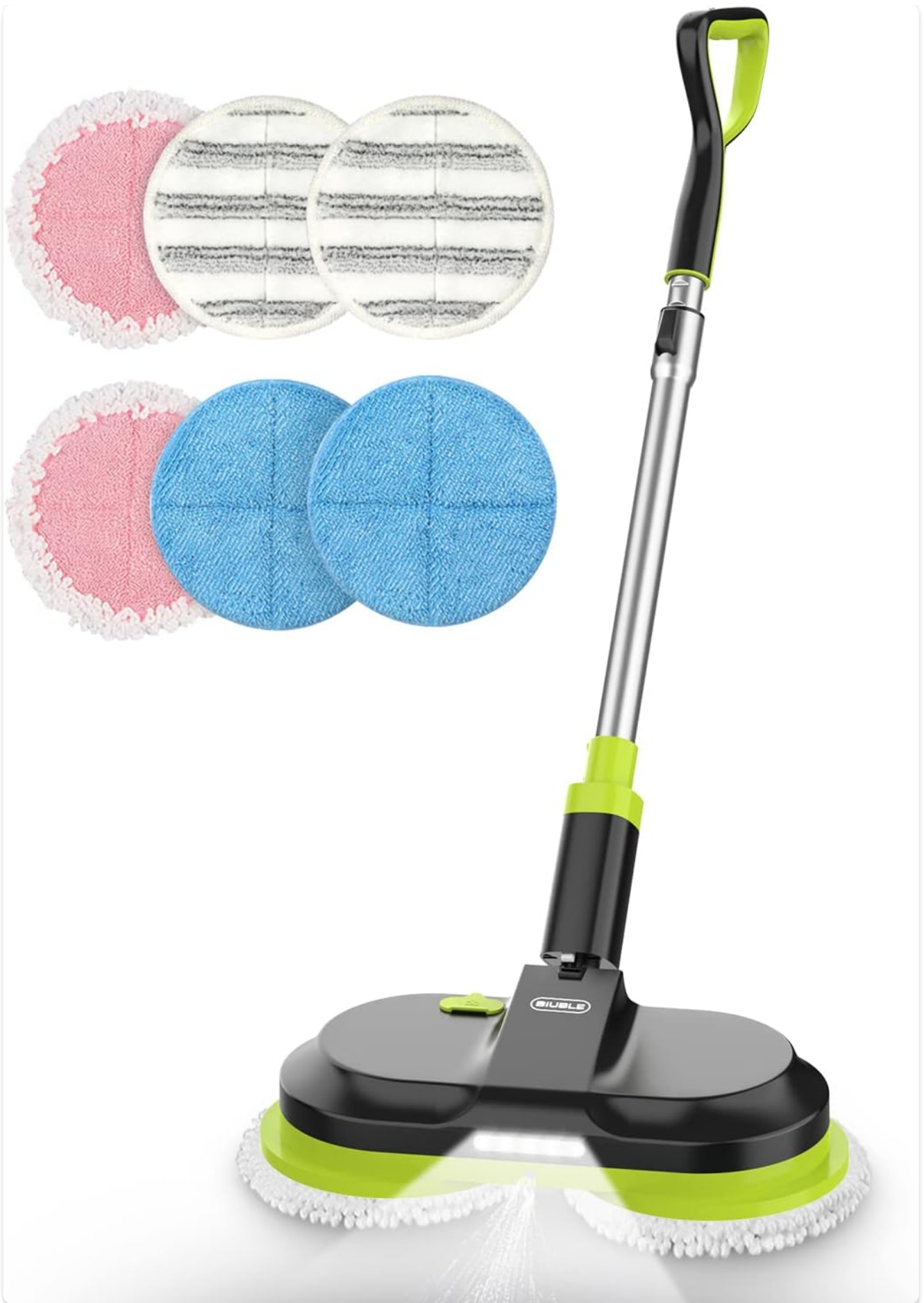
Image: The BIUBLE Cordless Electric Mop, showcasing its sleek design and included mop pads.