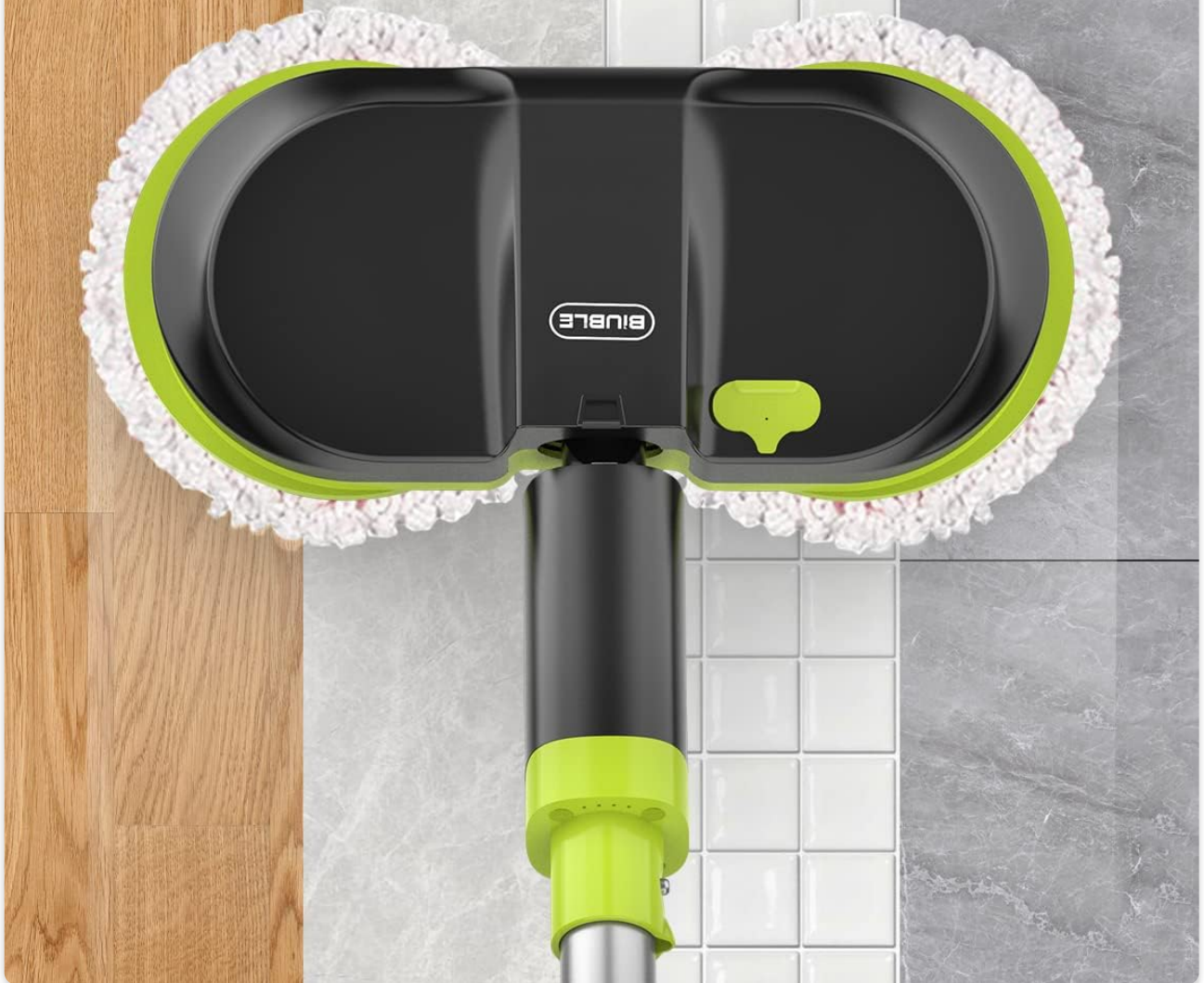
Image: The reusable mop pads, emphasizing their machine washable nature.