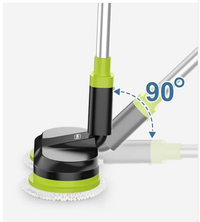
Image: The mop head swiveling to reach under furniture, highlighting its flexible design.