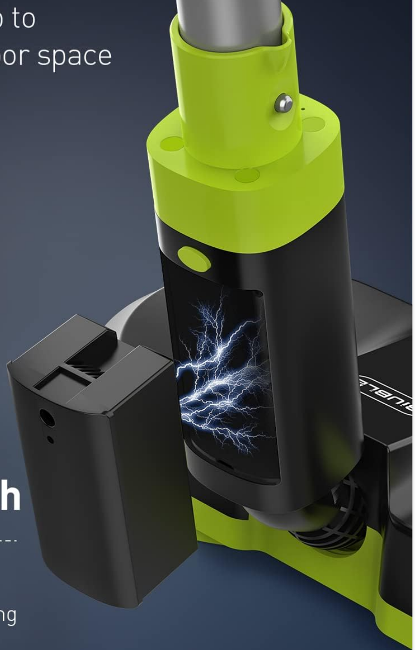
Image: A detailed view of the detachable battery and its specifications.