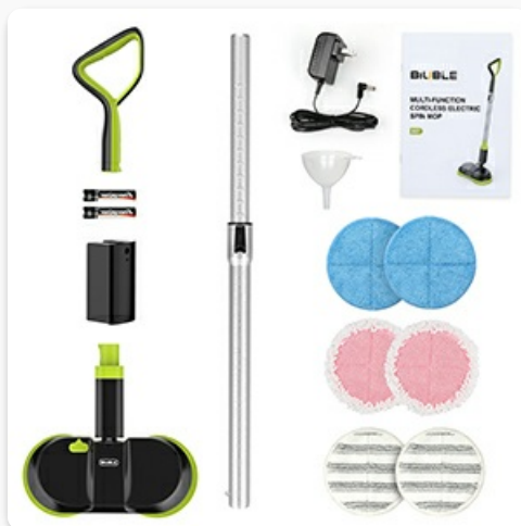
Image: A visual representation of all items included in the product package.