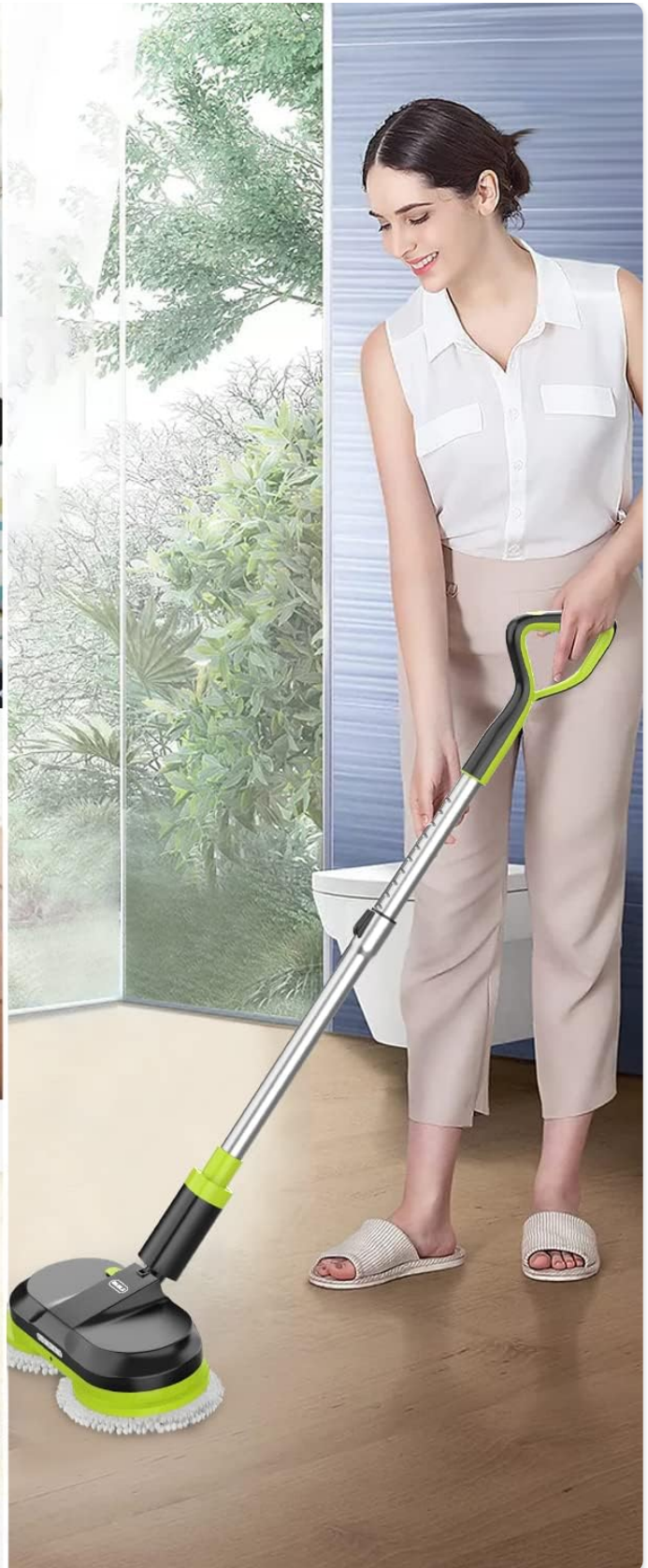
Image: The mop head positioned over various floor samples, indicating its multi-surface compatibility.