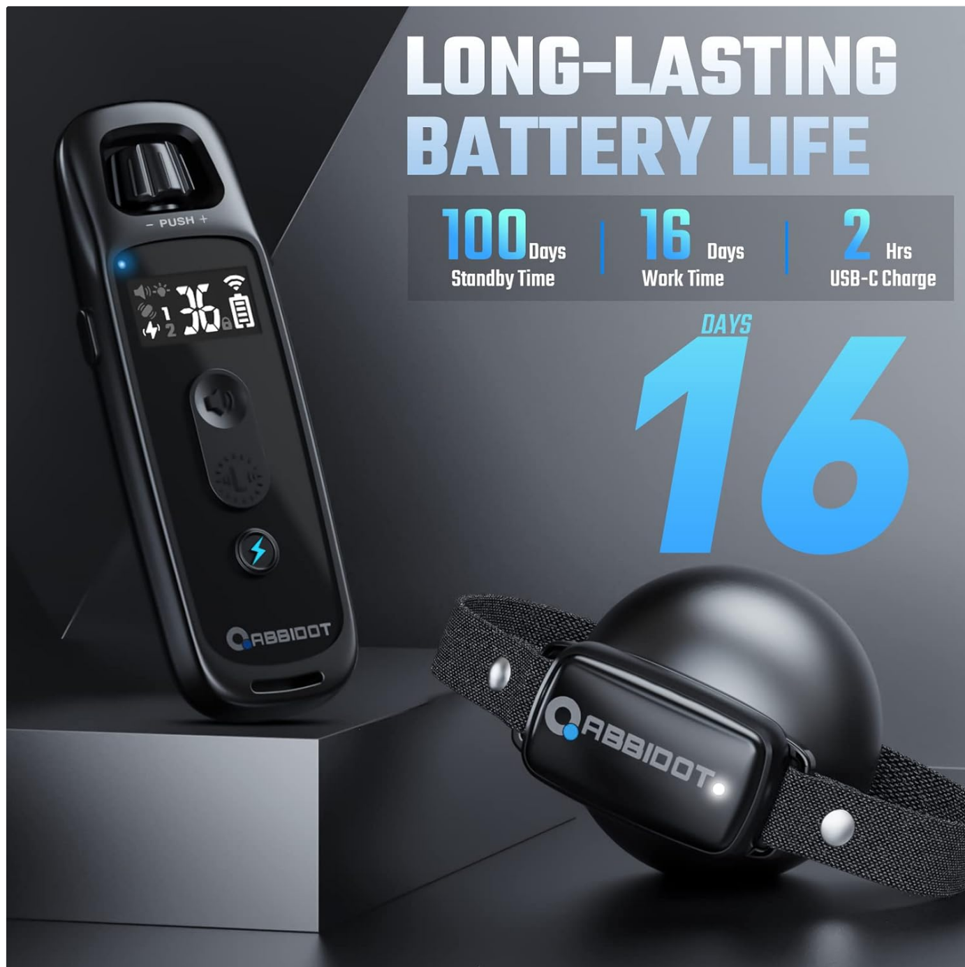
Image: Visual representation of the long-lasting battery life for the remote (16 days work time) and receiver, with USB-C charging capability.

Fully charge both the remote transmitter and the receiver collar before first use. The remote features a USB-C charging port. The receiver collar has a charging port protected by a rubber cover. Use the provided USB-C cable for charging. A full charge typically takes approximately 2 hours.