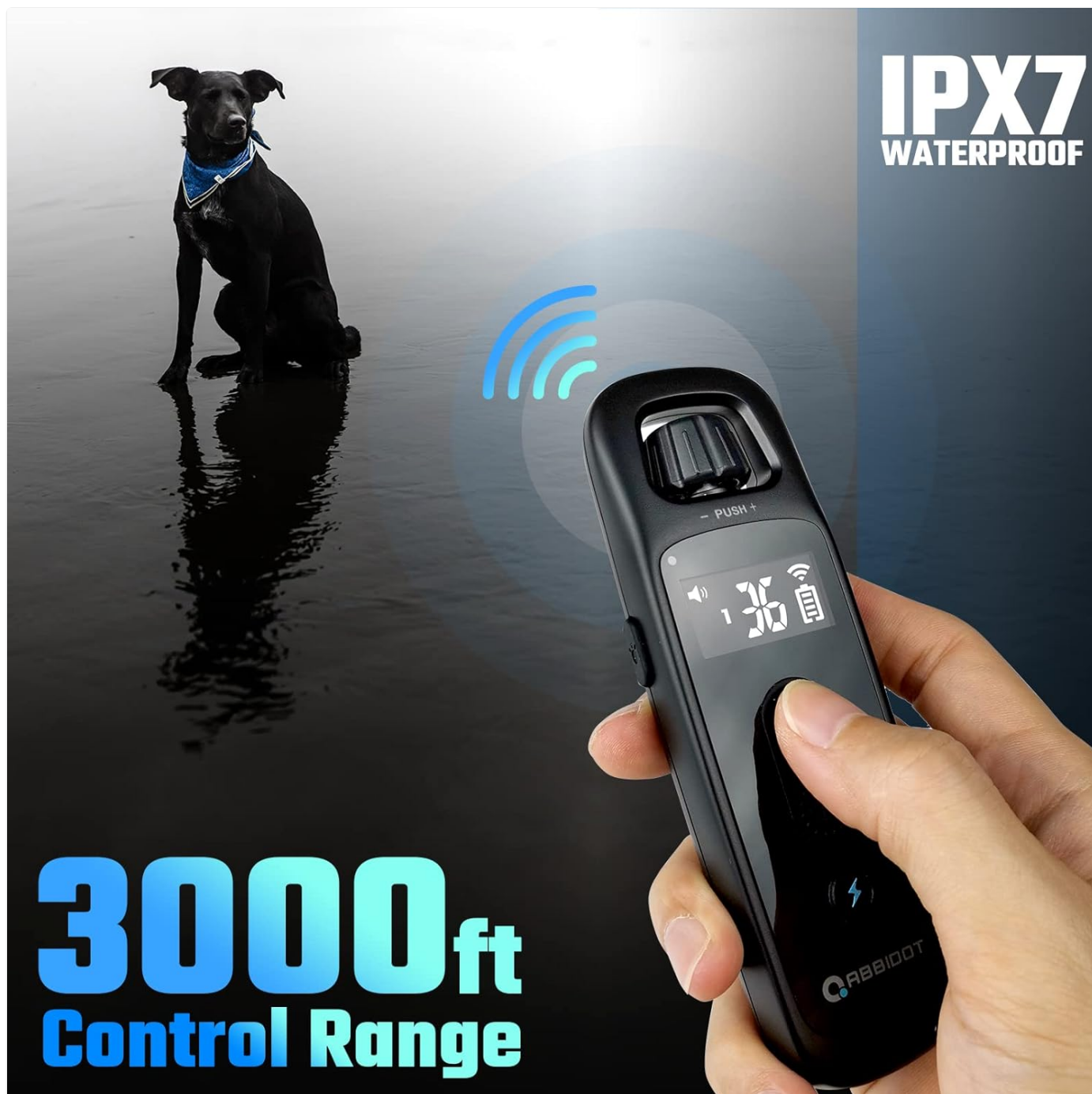
Image: The remote control in hand, demonstrating the 3000ft control range and the IPX7 waterproof rating of the collar, with a dog in a water environment.