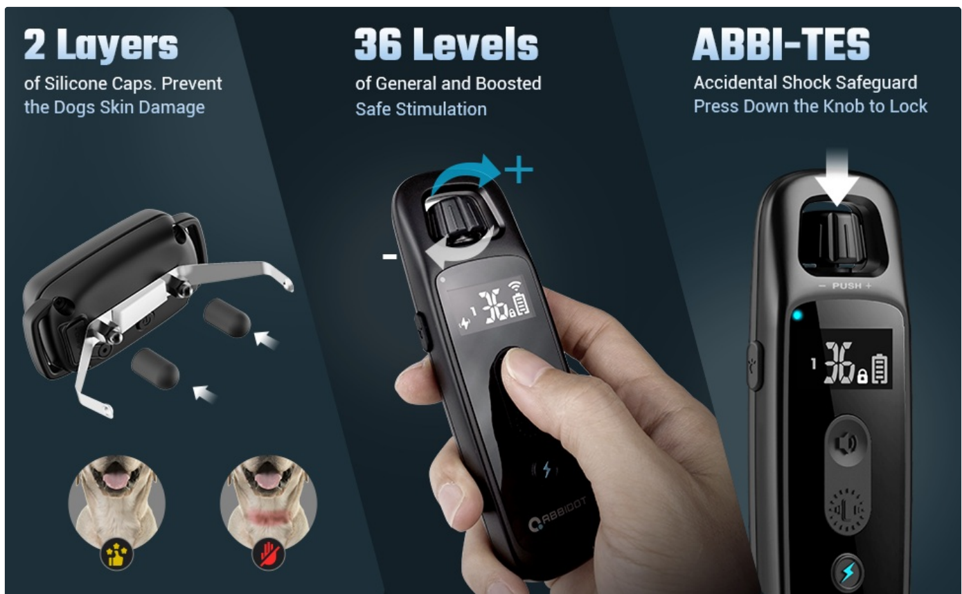
Image: The receiver collar showing the contact points and the optional silicone caps for skin protection. The remote displays the 36 stimulation levels.