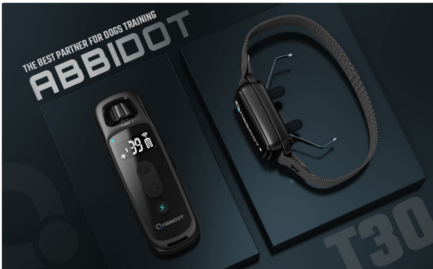
Image: The ABBIDOT T30 E-collar remote and receiver, highlighting its role as a training partner.

The ABBIDOT Dog Training Collar is designed to assist in training medium to large dogs, weighing between 15 and 120 lbs. It features 5 safe training modes, a long wireless range, and a waterproof design for versatile use. This manual provides detailed instructions for setup, operation, maintenance, and troubleshooting to ensure effective and safe use of your training collar.