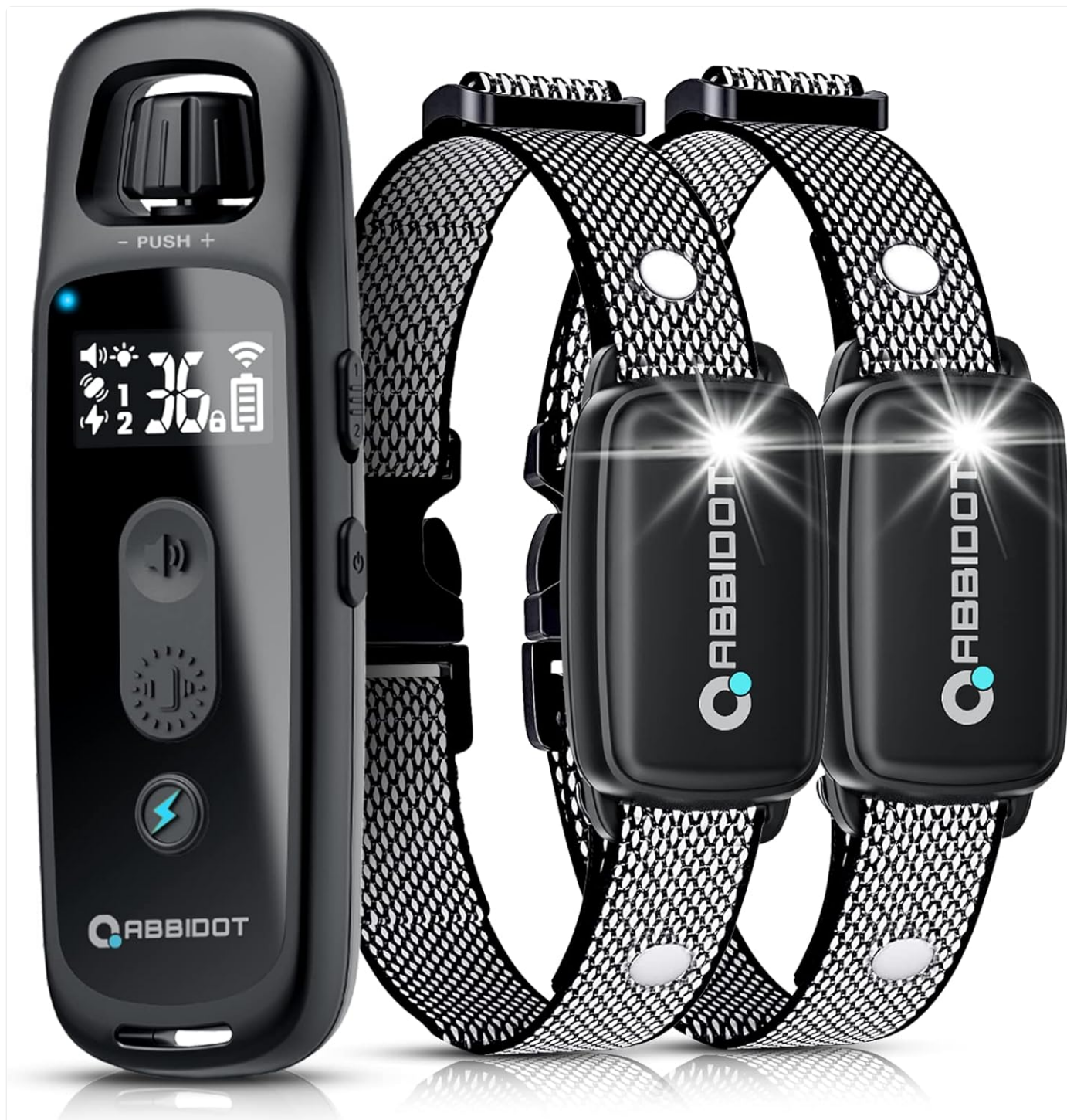
Image: The complete ABBIDOT Dog Training Collar set, including the remote, two receiver collars, and accessories.