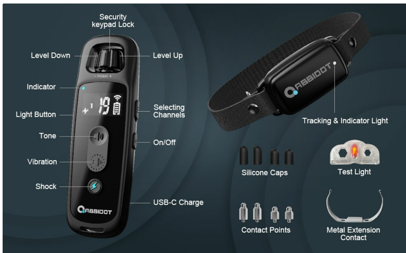
Image: Detailed diagram of the remote control and receiver collar, labeling all buttons and features including the safety keypad lock, level adjustments, training modes (tone, vibration, shock), and charging port.