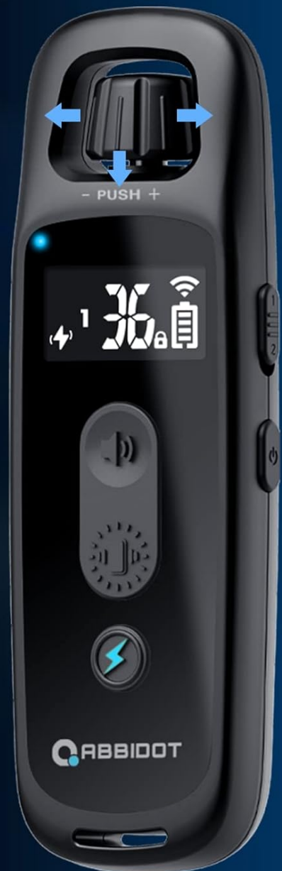
Image: The remote control displaying the various training modes: Light, Vibration, Tone, General Stimulation (1-15 Levels), and Boosted Stimulation (16-36 Levels).