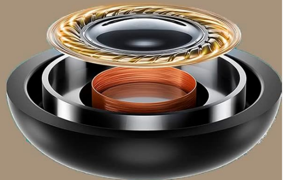
Image: Visual representation emphasizing the clear sound quality feature of the headset.