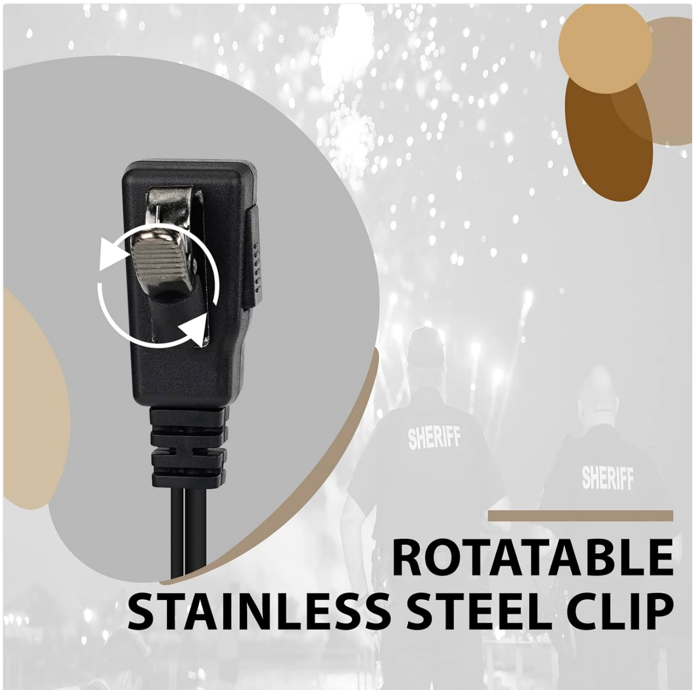
Image: A close-up of the rotatable stainless steel clip, demonstrating its functionality for attaching the PTT unit securely.