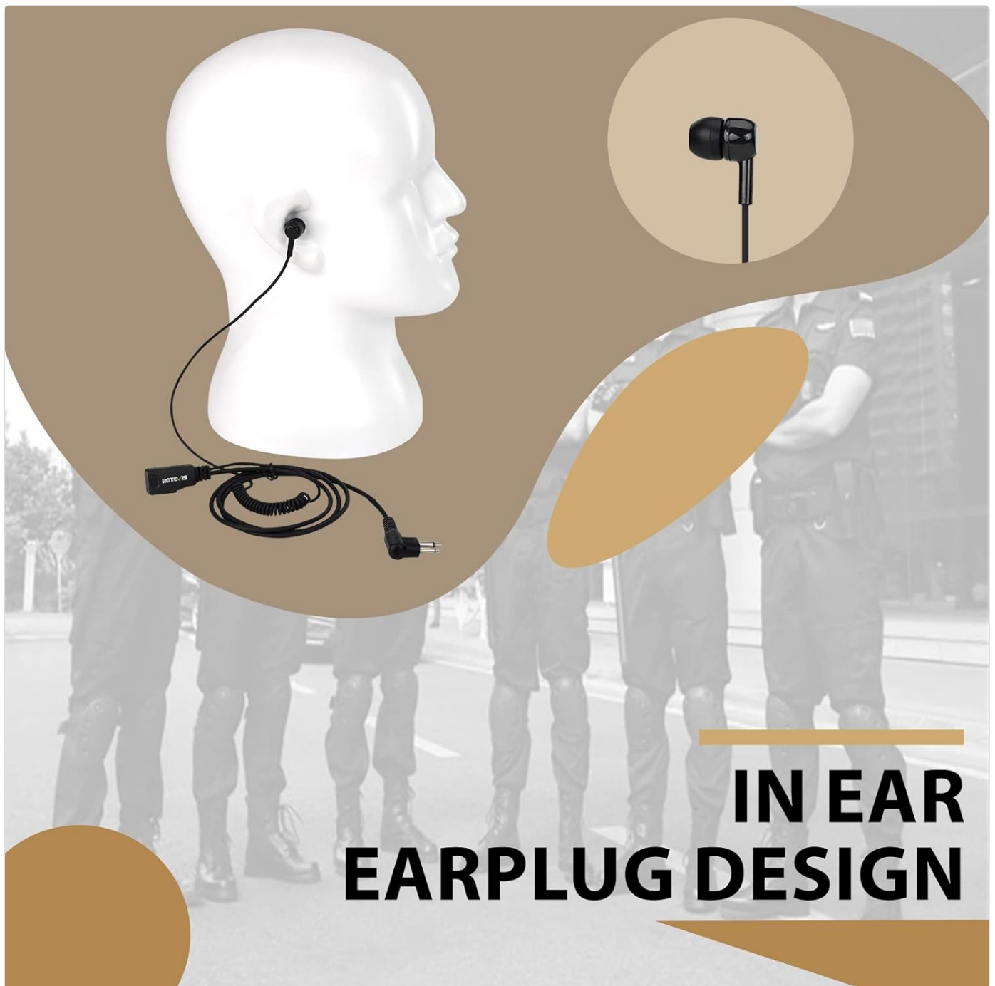
Image: Demonstrates how to wear the in-ear earplug and clip the PTT/Mic unit to clothing for optimal use.