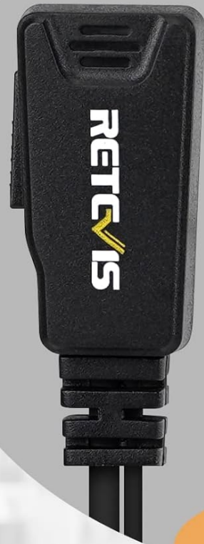
Image: A detailed view of the PTT (Push-to-Talk) microphone unit, showing its compact design and Retevis branding.