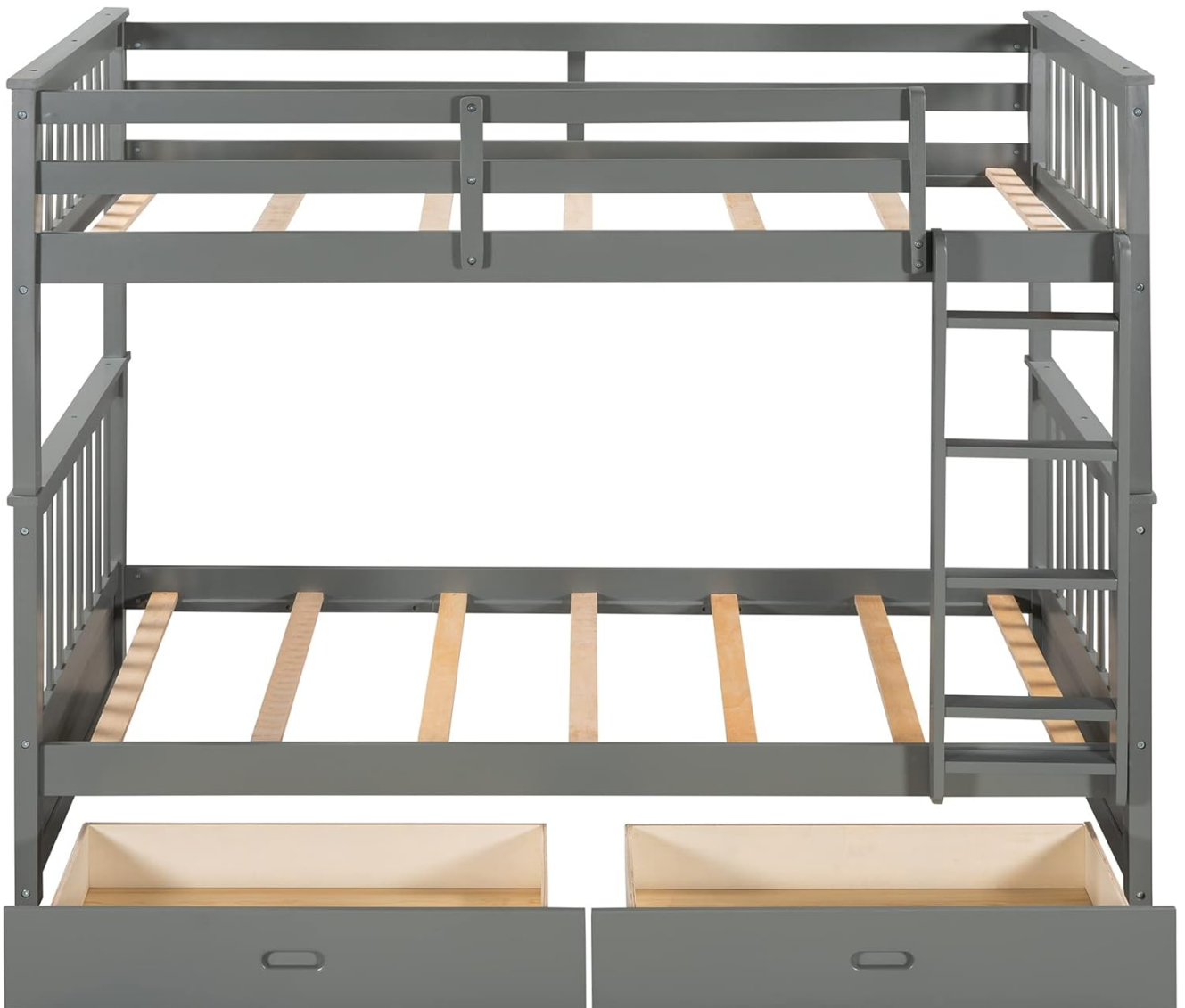
Figure 3: Front View with Storage Drawers