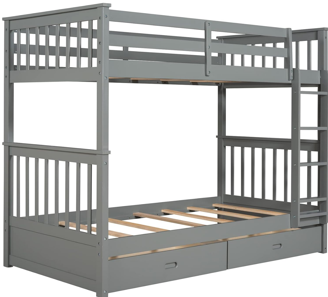
Figure 4: Angled View of Bunk Bed with Drawers

two storage drawers slide out smoothly from under the bottom bed, offering convenient space for toys, bedding, or other items. To separate the bunk bed into two individual twin beds, follow the disassembly instructions in reverse, then reassemble the individual bed frames as indicated in the manual.