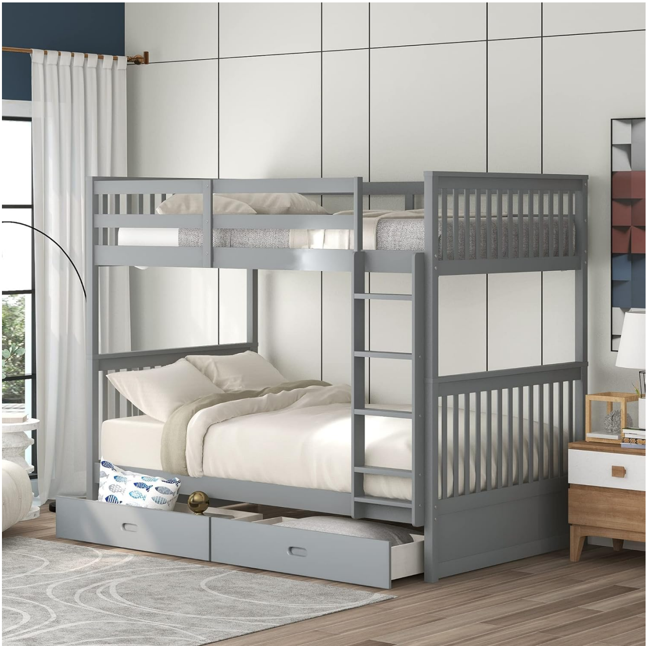
Figure 1: MOEO Twin Over Twin Bunk Bed with Storage Drawers