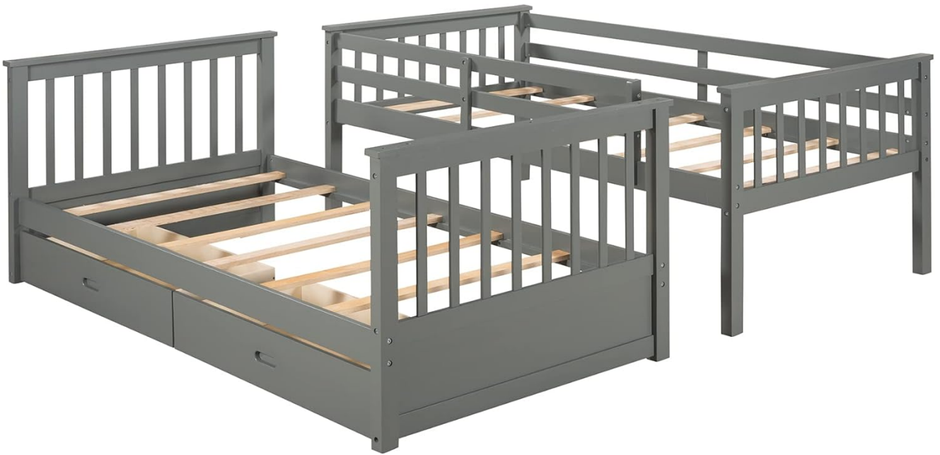
Figure 2: Bunk Bed Separated into Two Individual Beds