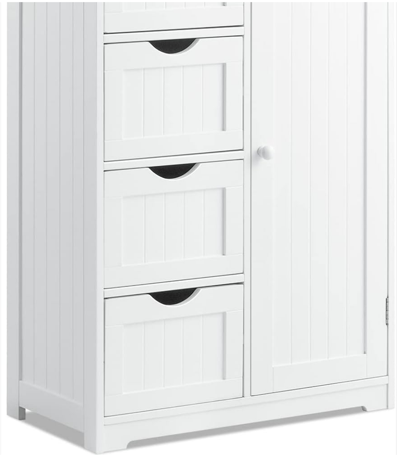
Figure 1: Front view of the assembled storage cabinet.