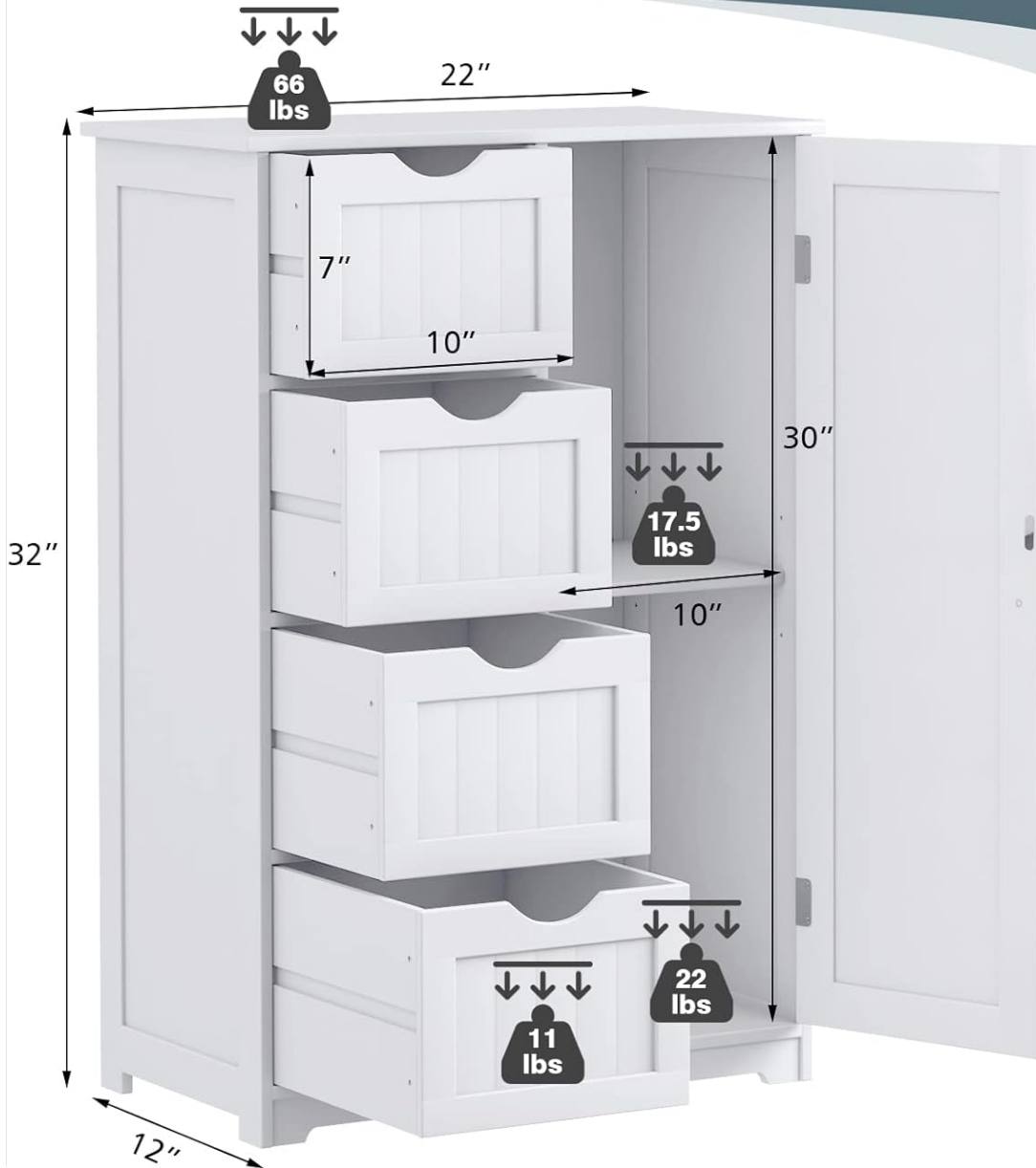
Figure 2: Product dimensions and weight capacities for assembly reference.