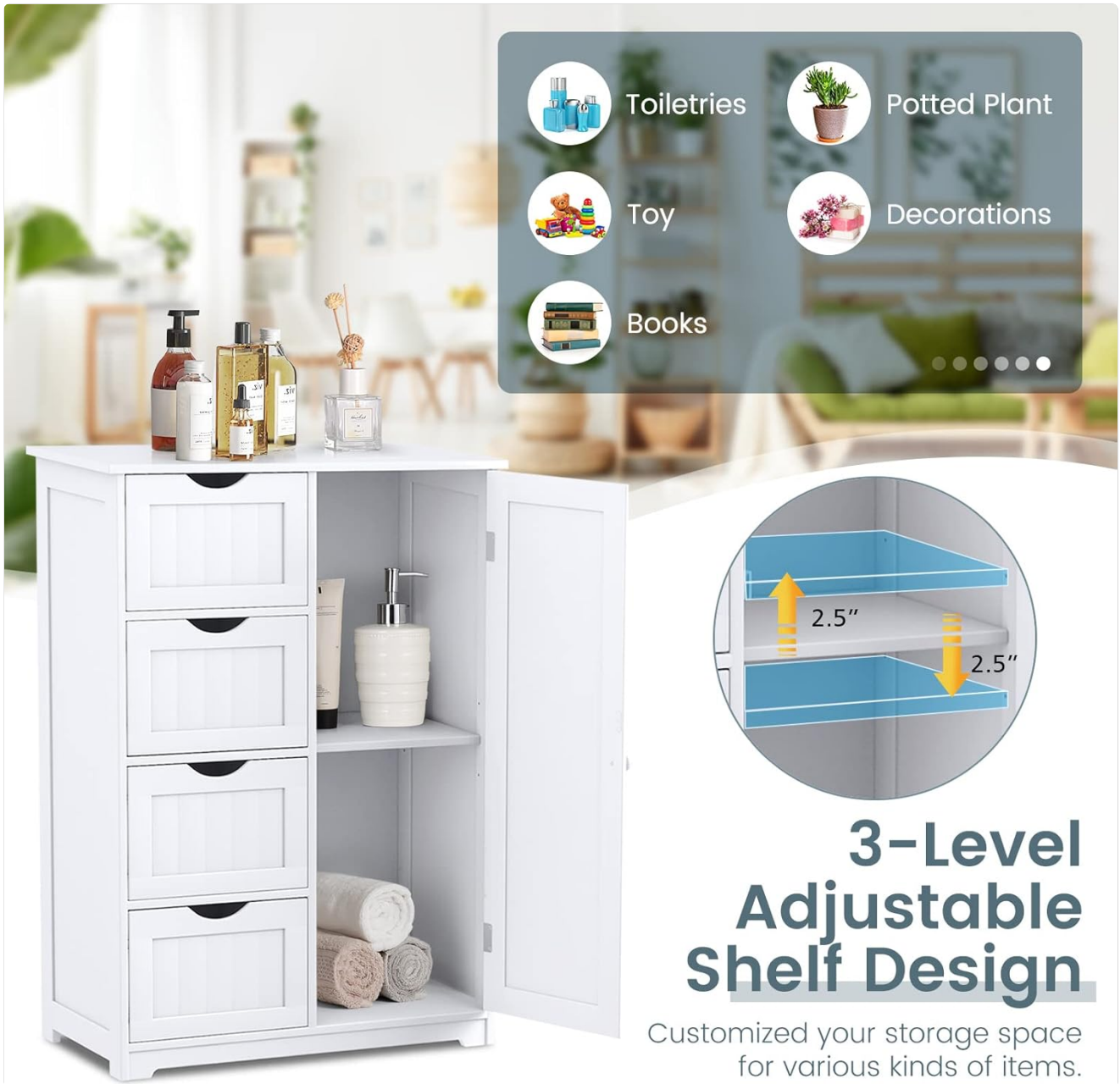
Figure 3: Detailed view of drawers and cabinet for storage.