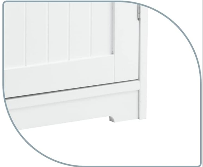
Stable Wooden Construction