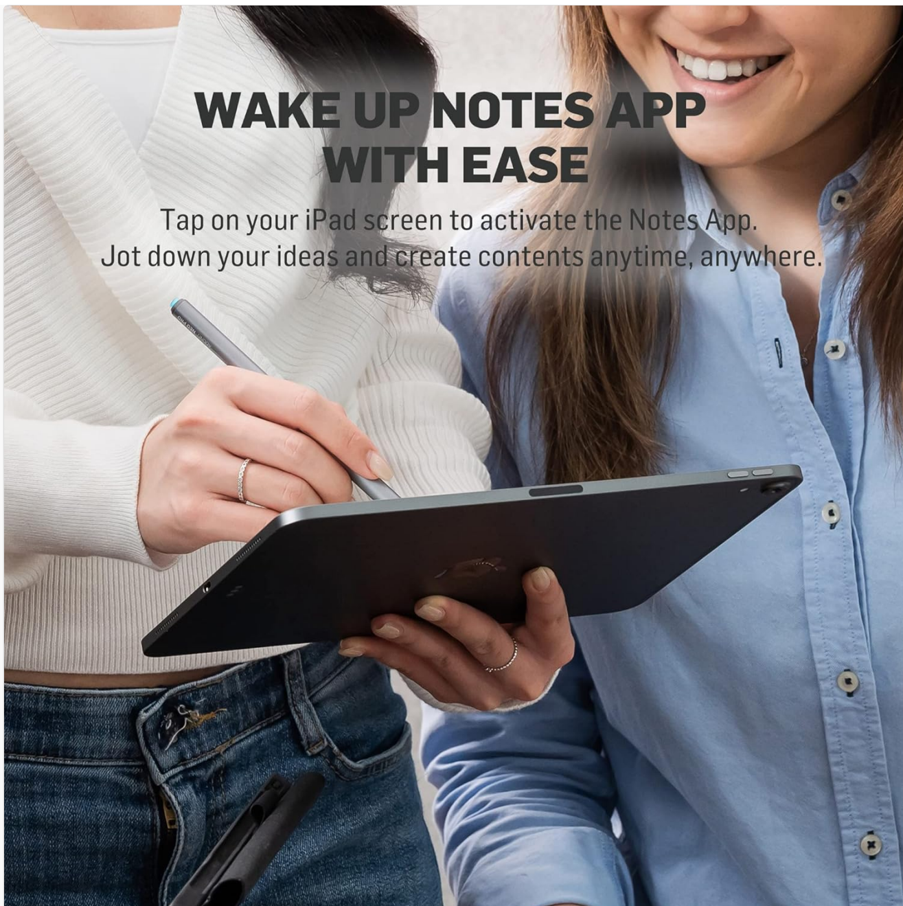
Image: Two individuals collaborating with an iPad, one using the Adonit Neo Pro stylus to interact with the screen, illustrating ease of use for creative tasks.

Tap on your iPad screen to activate the Notes App. Jot down your ideas and create contents anytime, anywhere.