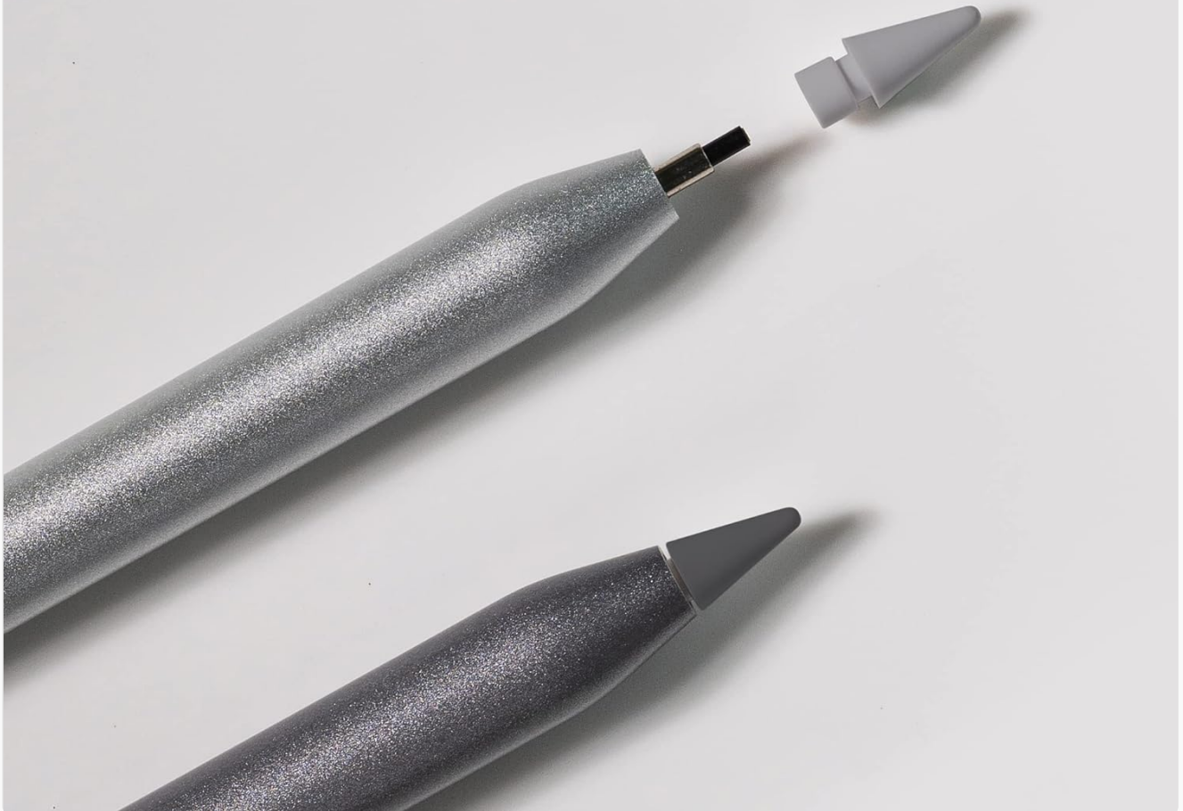
Image: A detailed view of the Adonit Neo Pro stylus, showing a removed nib and a new replacement nib, illustrating the ease of tip replacement.

Adonit Neo Pro features a spiral tip that can be replaced easily when it's worn down. The package includes 2 replacement nibs.