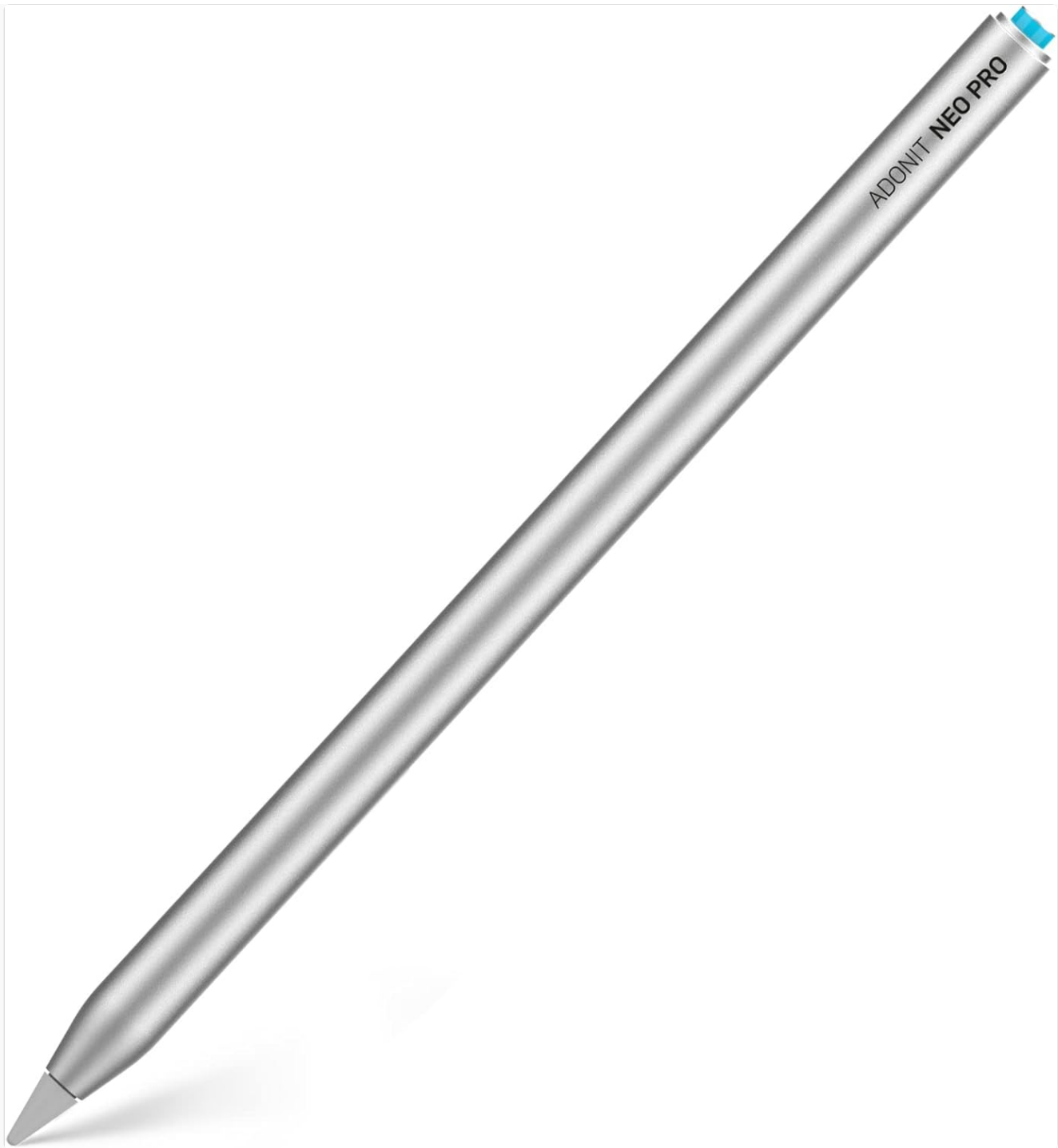
Image: The Adonit Neo Pro stylus pen in Matte Silver, showcasing its sleek design.