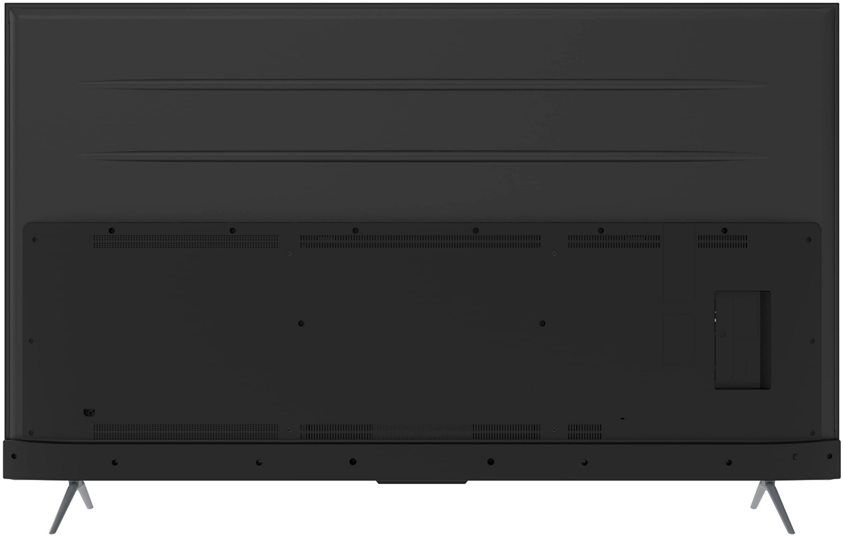
Image 4.1: Back panel with connectivity ports (HDMI, USB, Ethernet).