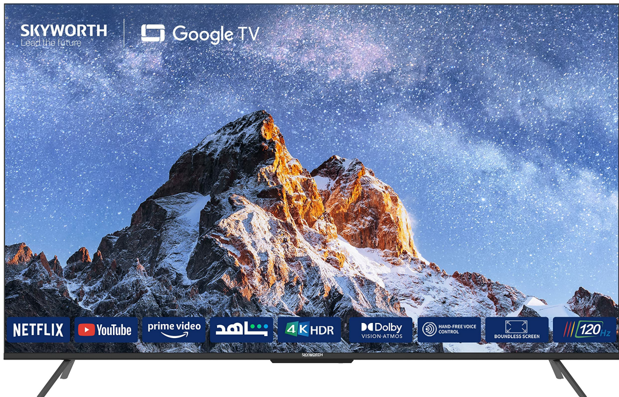
Image 1.1: Front view of the Skyworth 86-inch 4K UHD LED Google Smart TV.