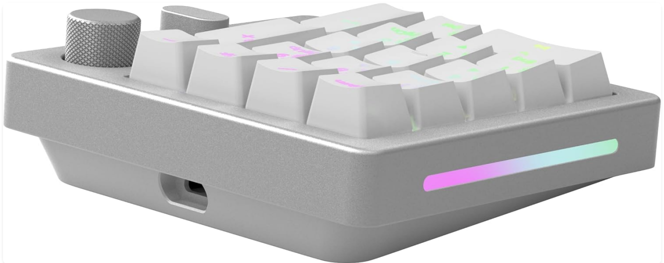
Figure 2: USB-C Port for Wired Connection and Charging

Connect the provided USB-C cable to the port on the numpad and to an available USB port on your computer. The numpad will automatically be recognized and begin charging.