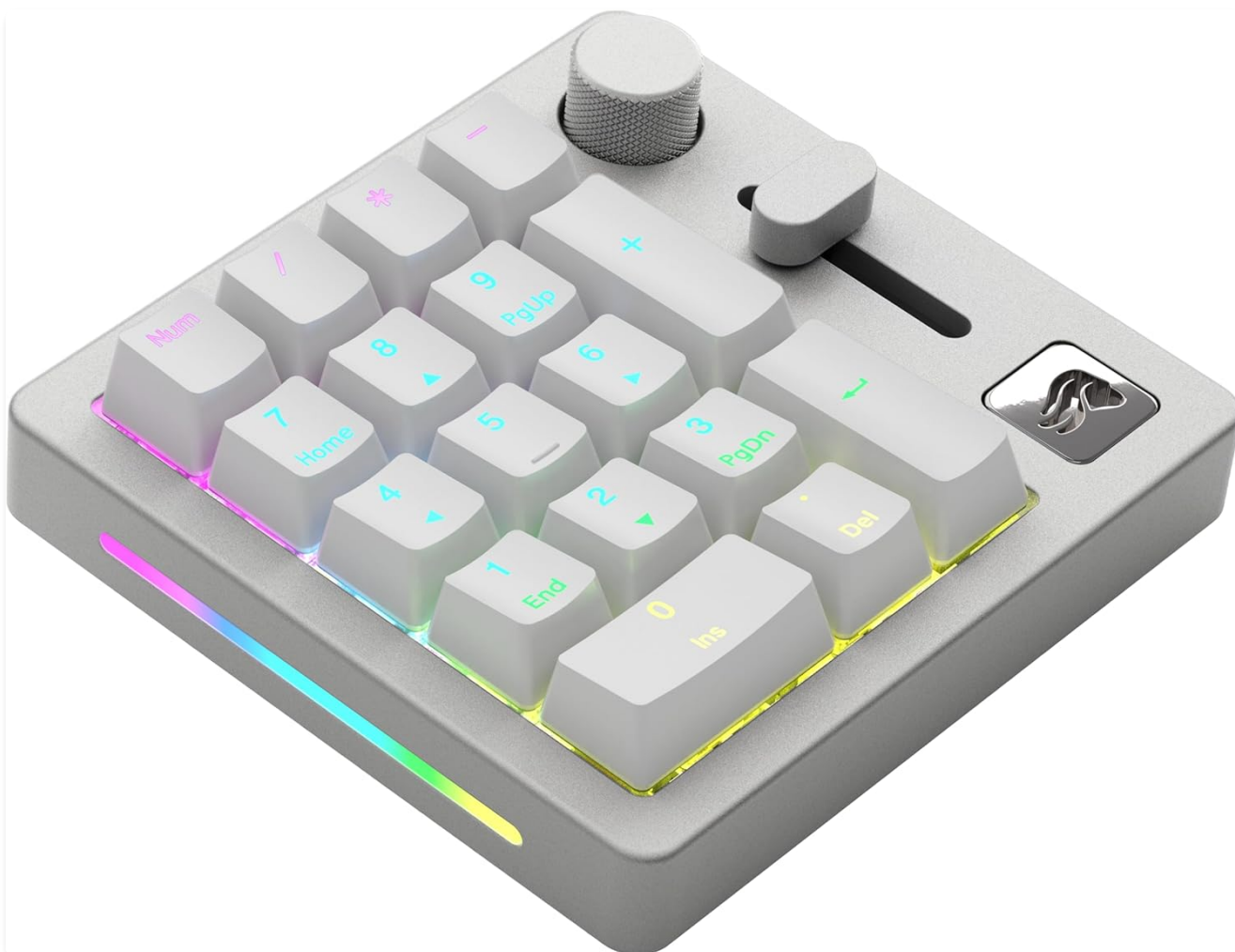
Figure 1: Glorious GMMK Mechanical Numpad (White Ice)

This manual provides comprehensive instructions for the setup, operation, maintenance, and troubleshooting of your Glorious GMMK Mechanical Numpad. Please read this manual thoroughly before using the device to ensure optimal performance and longevity.