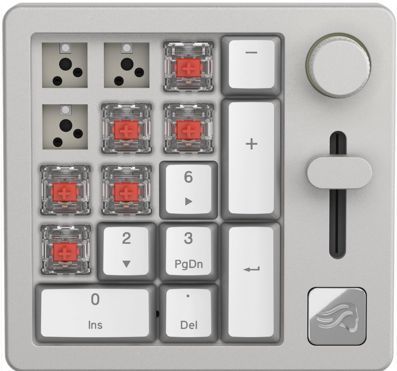
Figure 5: Clickable Rotary Knob