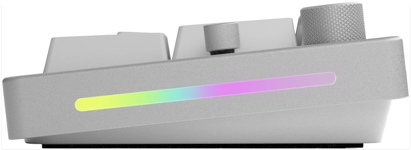
Figure 4: Programmable Slider