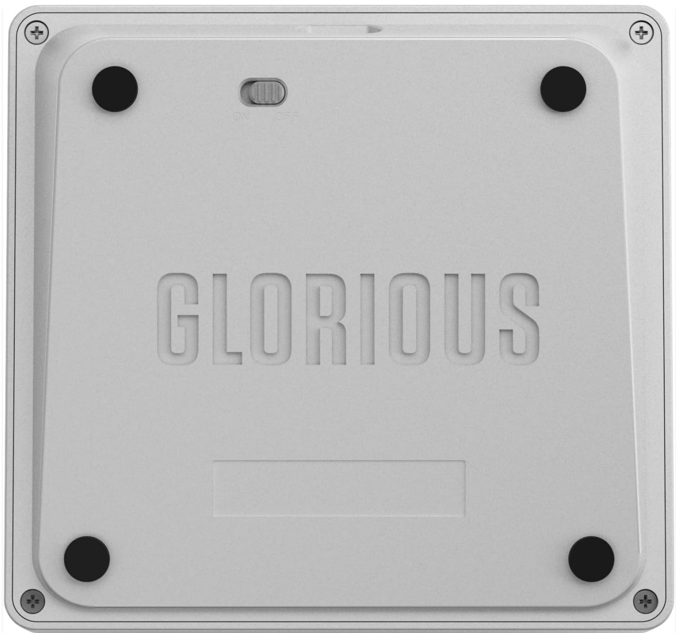
Figure 7: Bottom View of Numpad