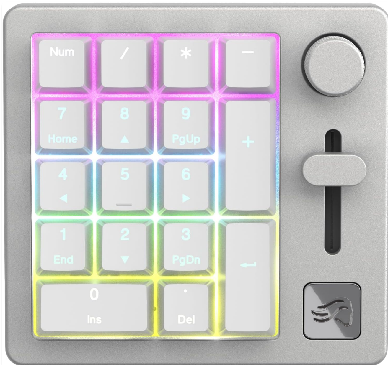
Figure 3: Numpad Layout with RGB Backlighting

The GMMK Numpad features 18 mechanical keys, a clickable rotary encoder (knob), and a programmable slider. It offers three remappable function layers for up to 51 functions.