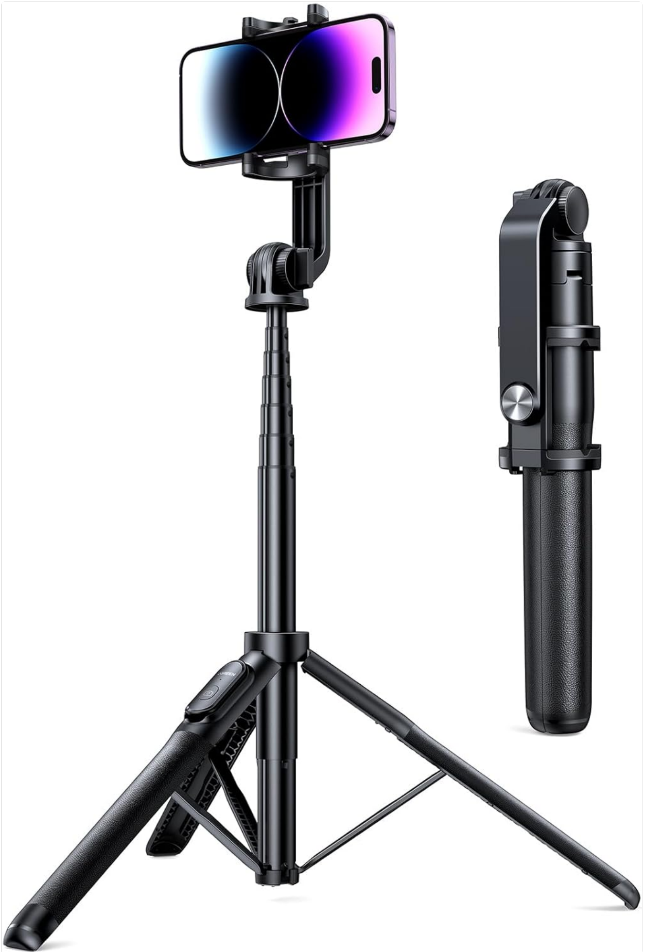
Image: The UGREEN 3-in-1 Bluetooth Selfie Stick Tripod shown in both its fully extended tripod configuration with a phone mounted,

4. Ensure the tripod legs are fully extended and locked into position for maximum stability.