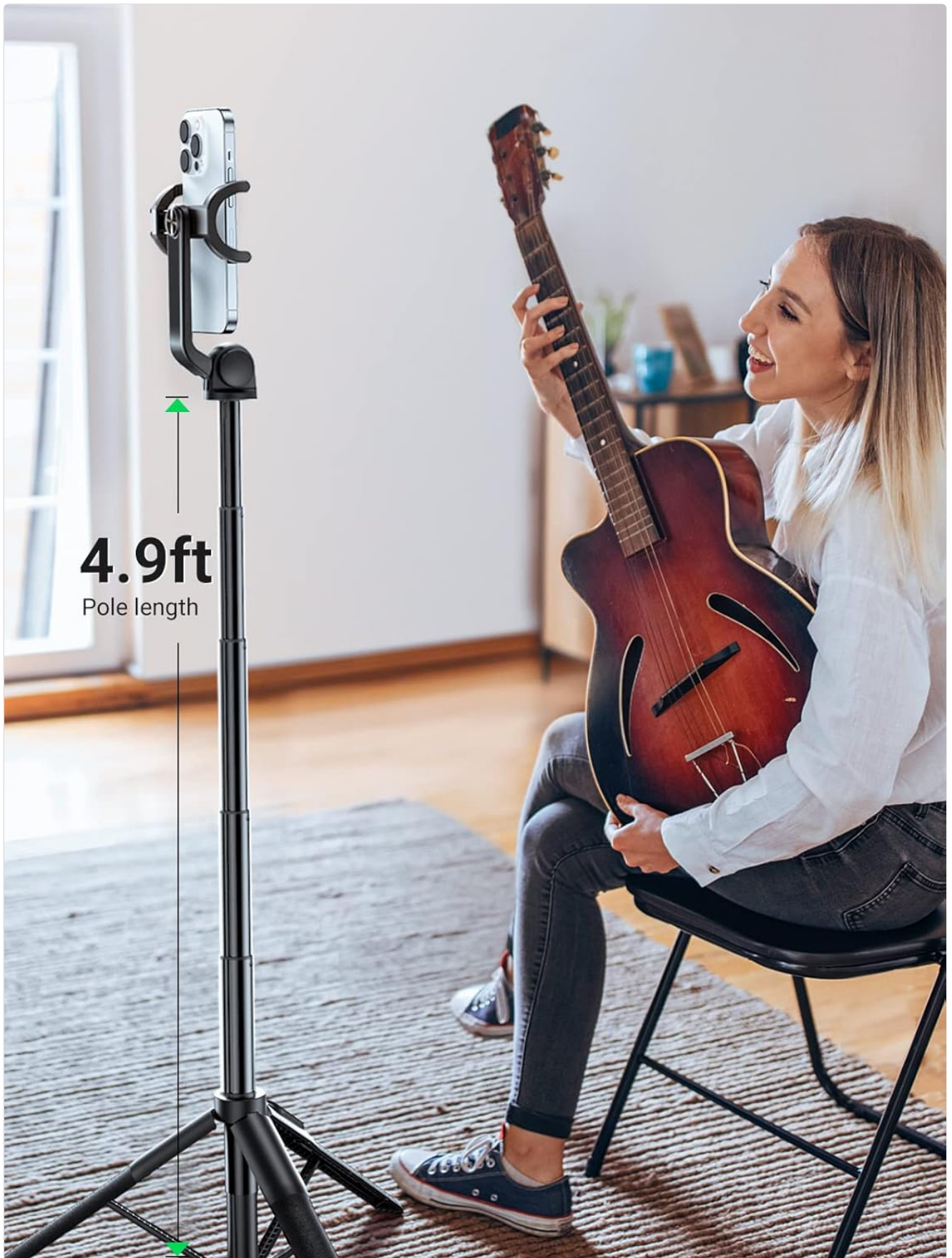
Image: A person is shown using the UGREEN selfie stick in its extended tripod mode, with a smartphone mounted. The image highlights the extended pole length and the stable tripod base, demonstrating its use for hands-free recording or photography.