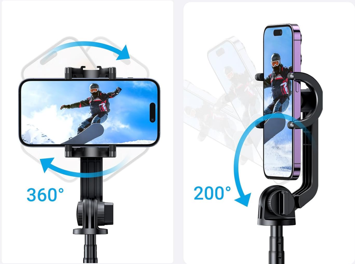
Image: Diagram illustrating the adjustable angles of the phone holder. It shows a 360-degree rotation for switching between horizontal and vertical orientations, and a 200-degree tilt for finding the perfect shooting angle.