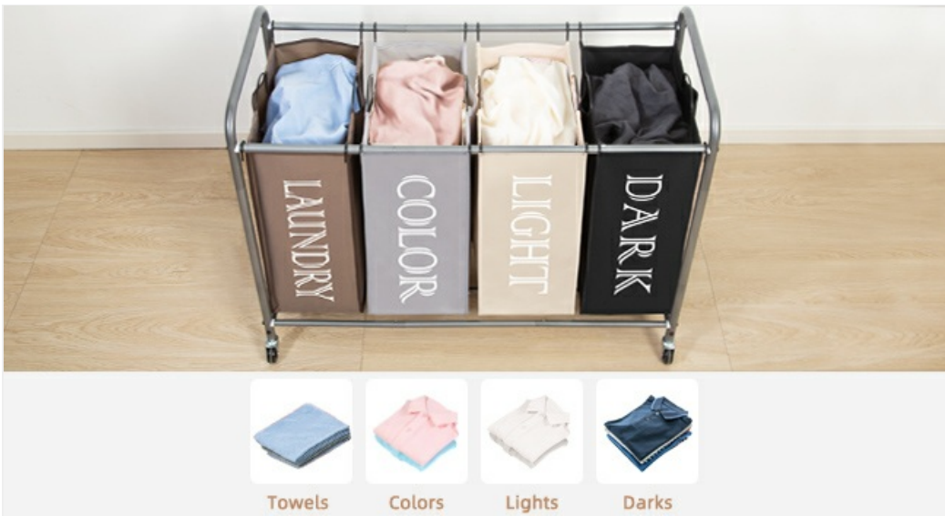
Image Description: A close-up of the laundry sorter bags, showing different types of clothes (towels, colors, lights, darks) being placed into their respective labeled compartments.