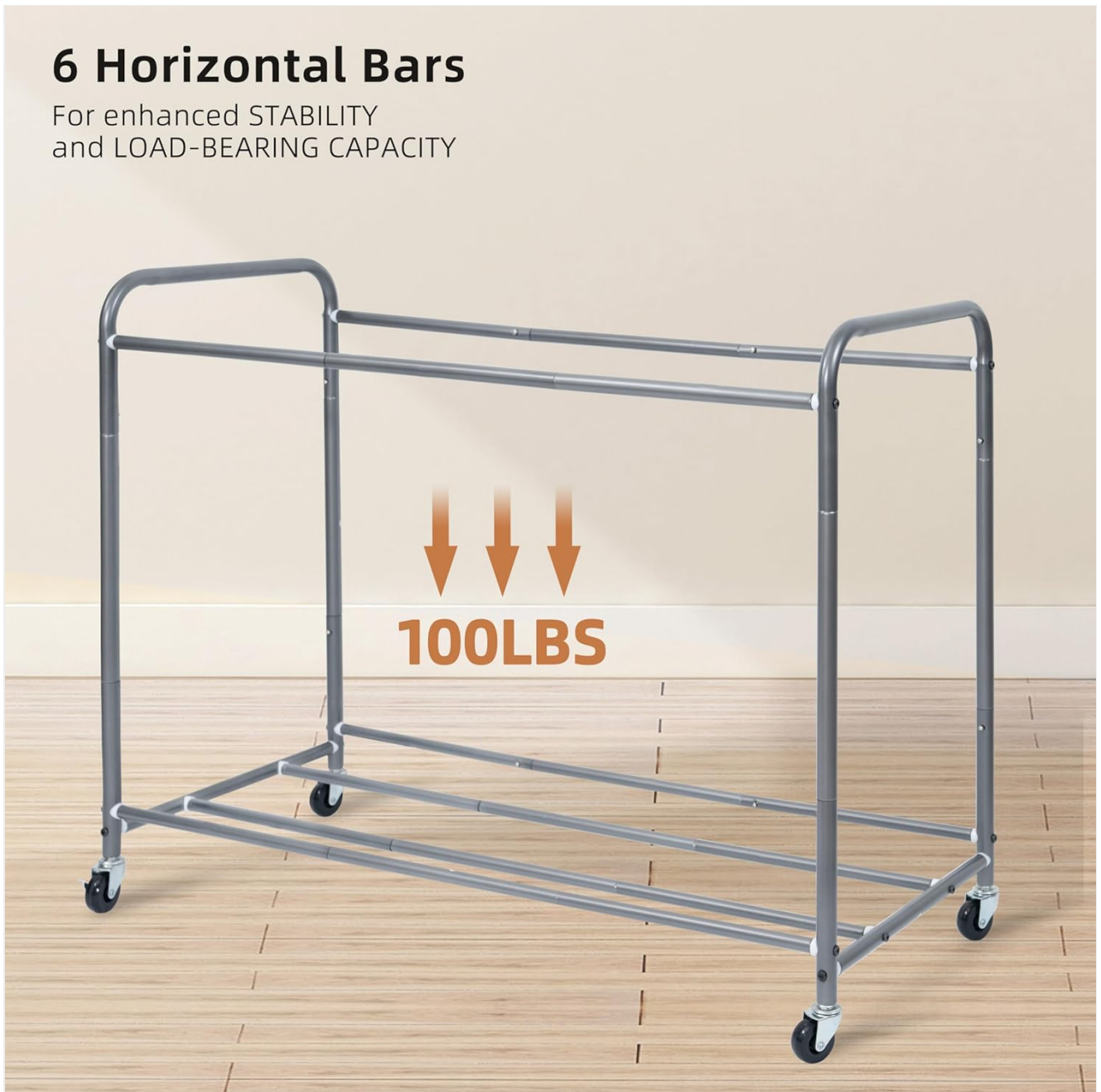
Image Description: A grey metal frame for the laundry sorter, showing six horizontal bars designed for enhanced stability and load-bearing capacity, with an arrow indicating a 100 lbs weight capacity.

Connect the horizontal bars to the vertical side frames using the provided hardware. Ensure the frame is stable and all connections are aligned. Do not fully tighten screws yet.