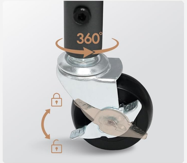
2 lockable wheels