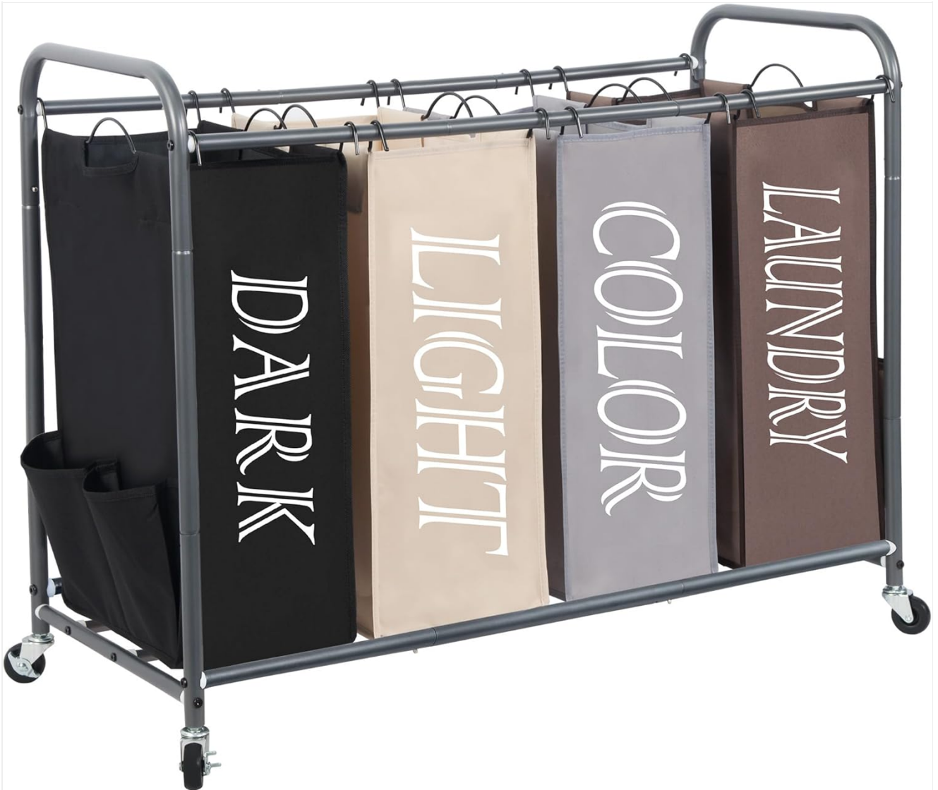
Image Description: The fully assembled STORAGE MANIAC 4-Section Laundry Sorter with multicolored bags labeled "DARK", "LIGHT", "COLOR", and "LAUNDRY" hanging within the grey metal frame. Side pockets are visible on the end bags.

Place the four removable laundry bags onto the top horizontal bars of the frame. Each bag has metal handles designed for hanging. The bags are labeled "DARK", "LIGHT", "COLOR", and "LAUNDRY" to facilitate sorting.