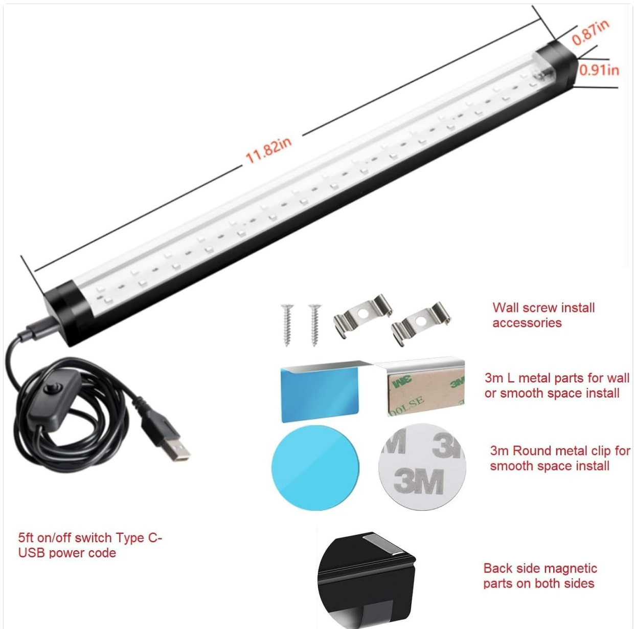
Figure 1: Package contents including two black light bars, USB cables, and mounting hardware.