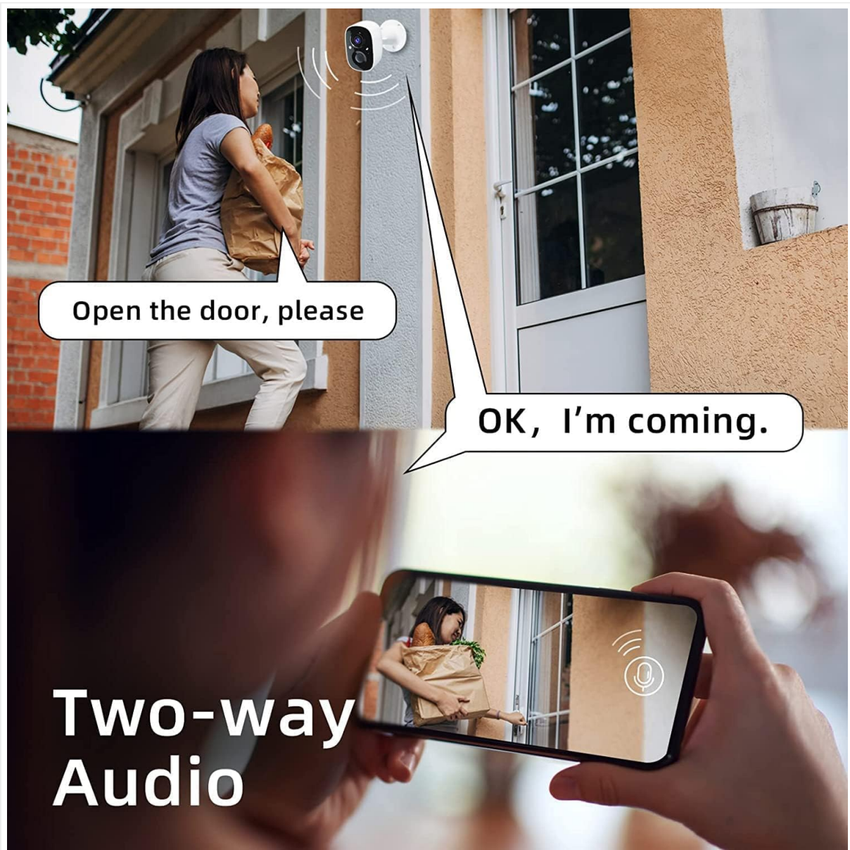
Figure 3: Demonstrates the two-way audio functionality, allowing real-time communication through the camera.