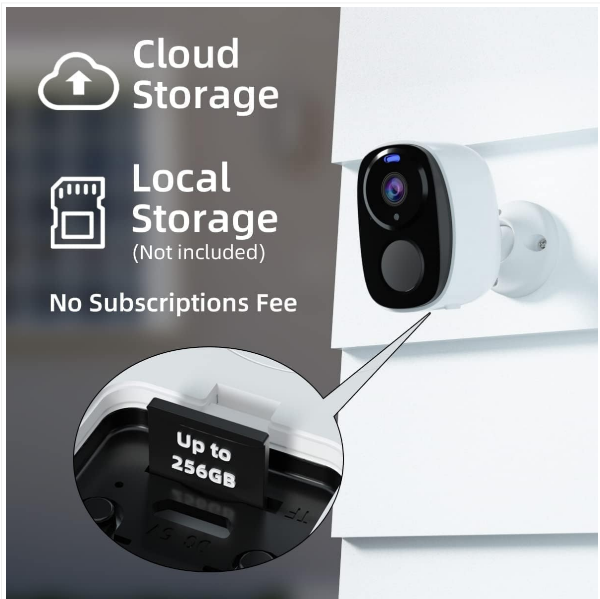
Figure 7: Illustrates the camera's local storage capability via a micro SD card and available cloud storage options.