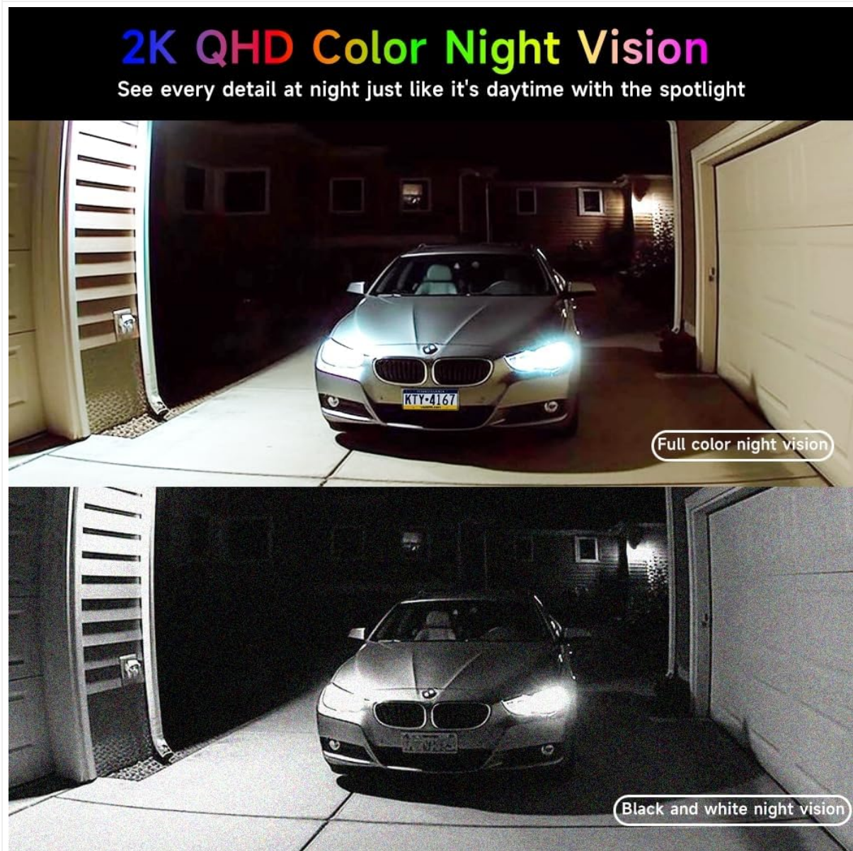
Figure 5: A side-by-side comparison of 2K QHD color night vision and standard black and white night vision.

The Raycom BW4 offers 2K QHD color night vision, allowing you to see clear, full-color details even in low-light conditions. It also supports traditional black and white night vision. The app allows you to switch between these modes or enable smart night vision.