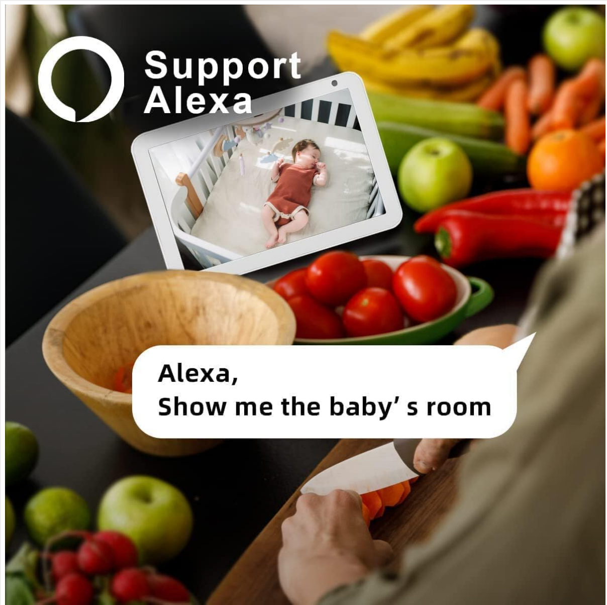
Figure 8: Demonstrates the camera's compatibility with Alexa for convenient voice-controlled monitoring.