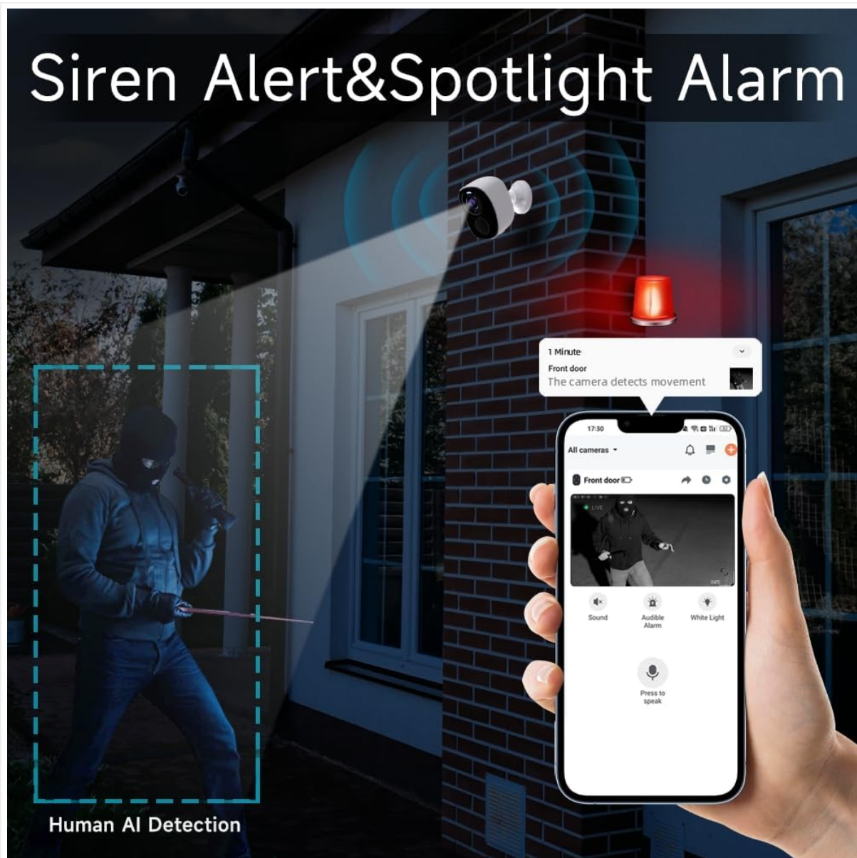
Figure 6: The camera's siren and spotlight alarm feature in action, designed to deter potential threats.

Video 2: Highlights various features including clearer video, weather resistance, easy mounting, motion-activated siren, activity zone setup, two-way audio, and storage options.