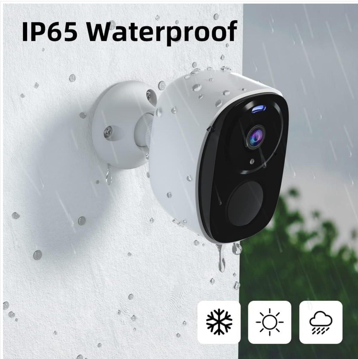
Figure 10: The camera's IP65 waterproof design, ensuring durability in outdoor environments.