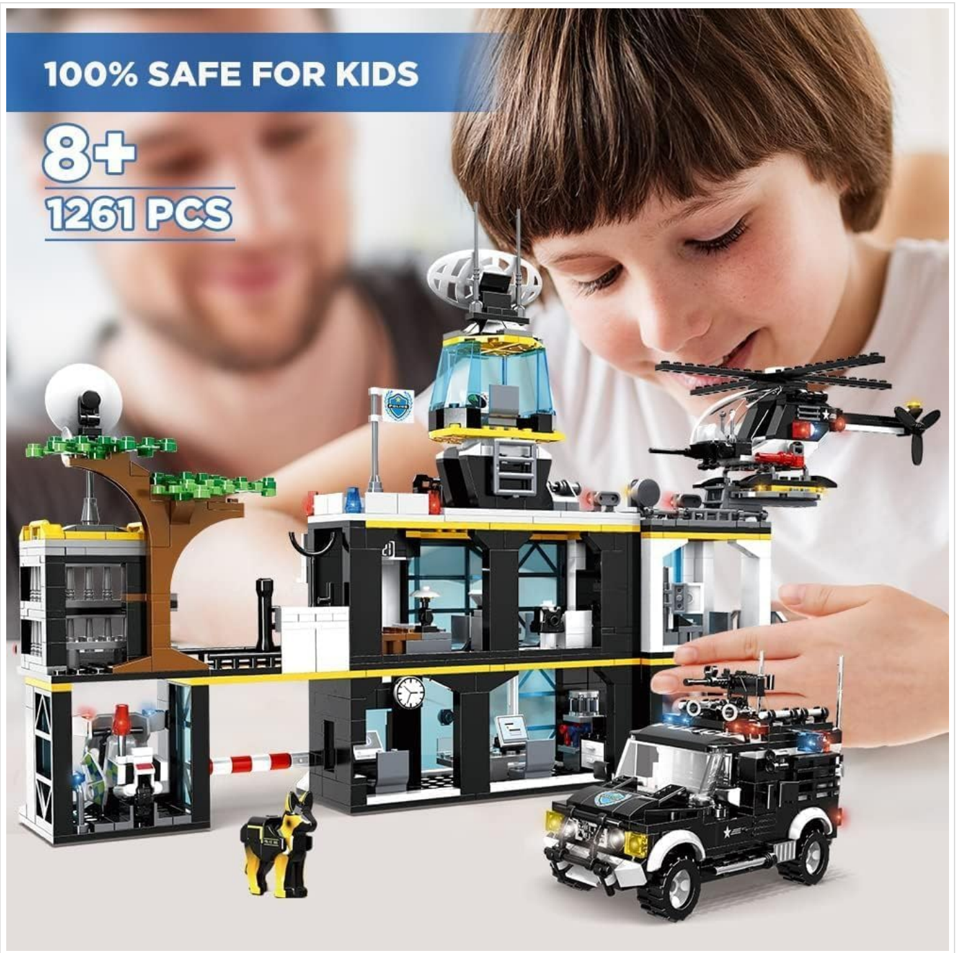
Figure 3.2: A child engaging in imaginative play with the WOMA SWAT Anti-Riot Building Blocks Set, demonstrating its interactive nature.