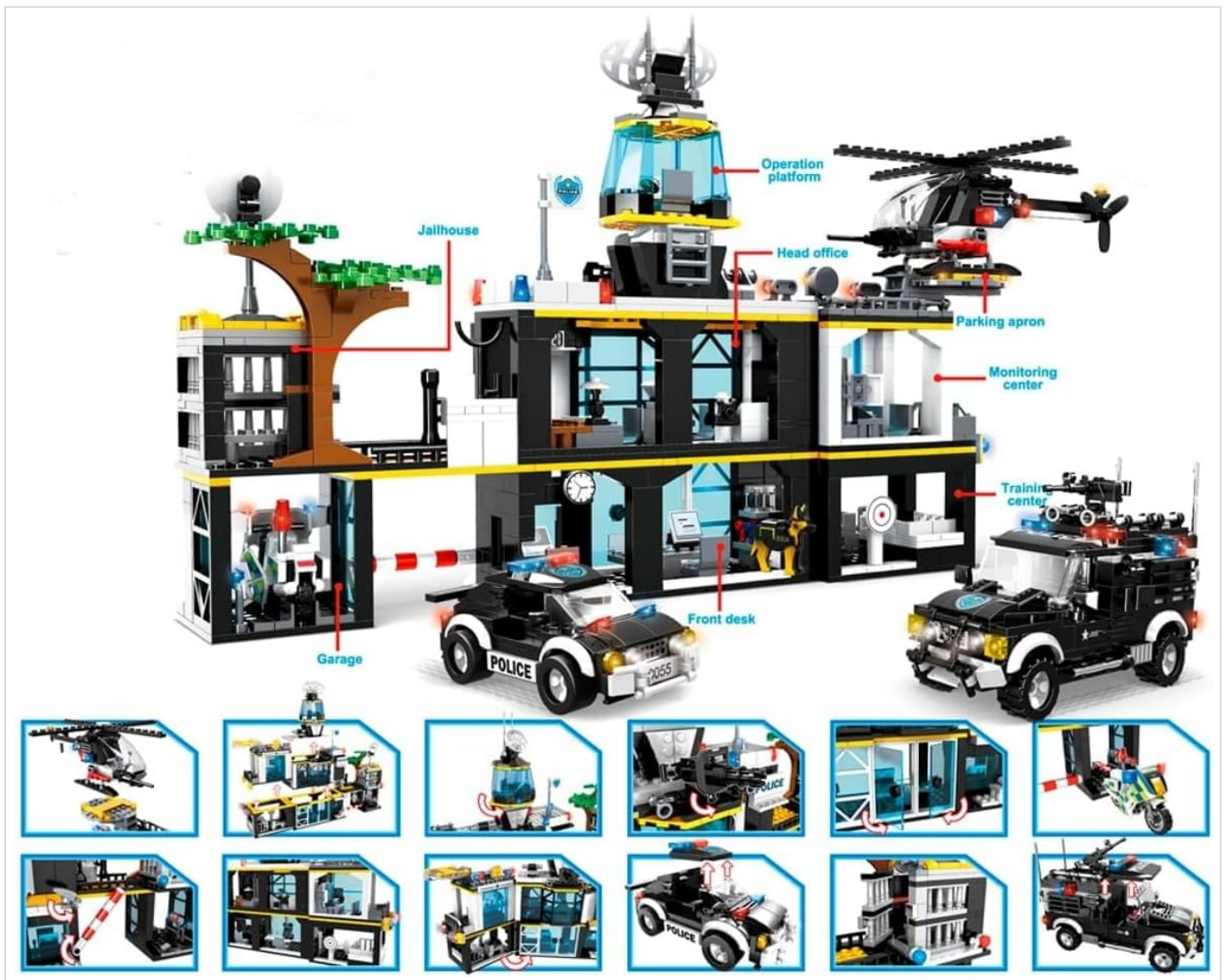
Figure 2.1: Detailed view of the police station structure, highlighting key areas such as the operation platform, head office, parking apron, monitoring center, training center, front desk, garage, and jailhouse.