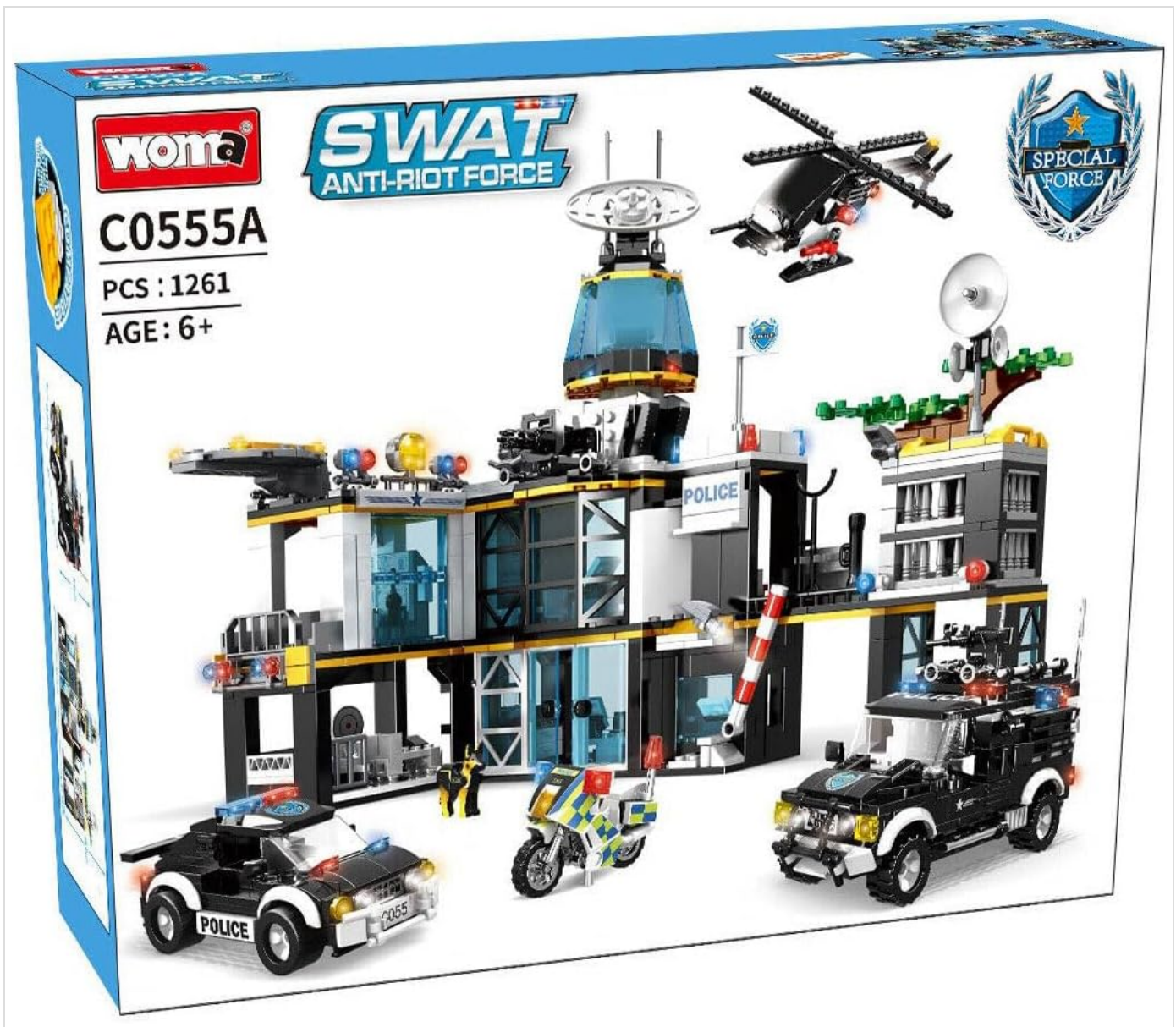
Figure 2.2: Dimensions and key features of the individual police vehicles included in the set: the police car, police truck, helicopter, and motorcycle.