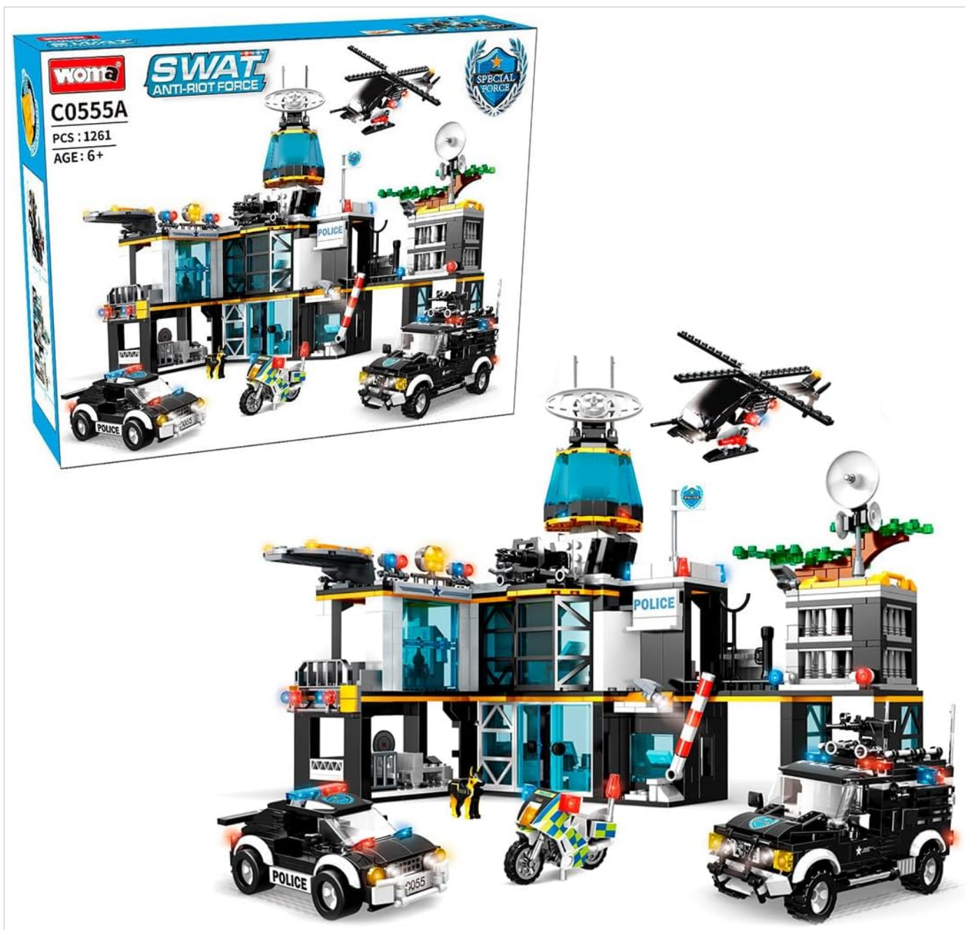
Figure 1.1: Overview of the WOMA SWAT Anti-Riot Building Blocks Set and its packaging.