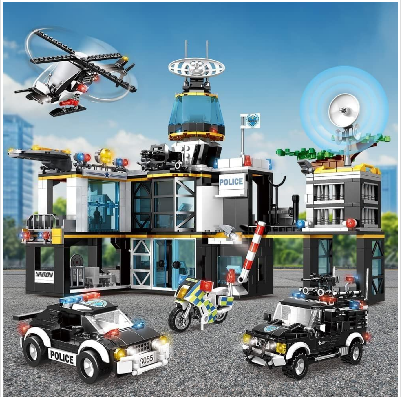
Figure 3.1: The fully assembled WOMA SWAT Anti-Riot Building Blocks Set, ready for play, showcasing the police station and its accompanying vehicles.