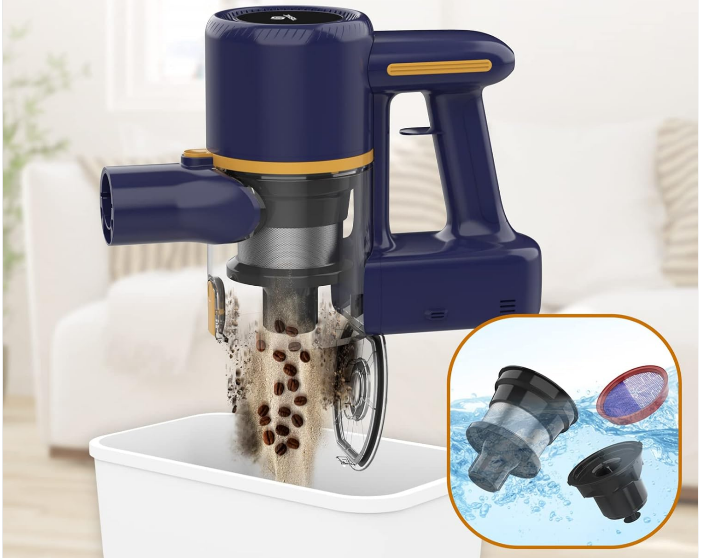
Image: Illustration of the one-click dust cup emptying mechanism of the TASVAC N7, showing dirt falling into a bin and the removable filter components.