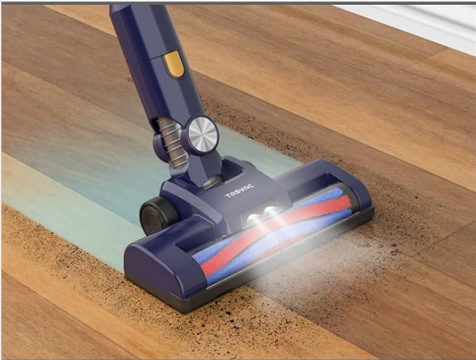
Motorized Floor Brush