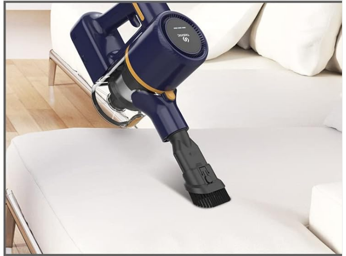
2 in 1 Brush