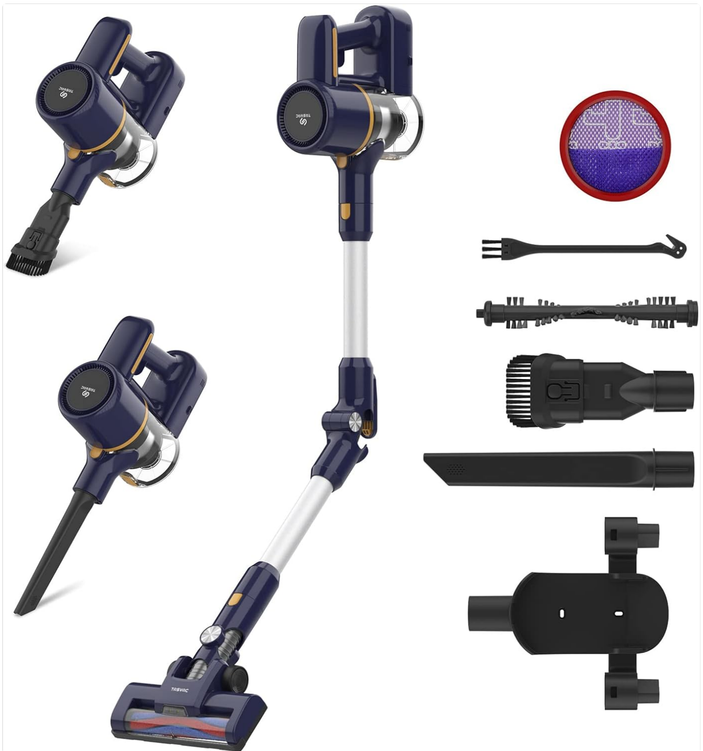
Image: All components of the TASVAC N7 Cordless Vacuum Cleaner, including the main unit, various attachments, wall mount, and charger.