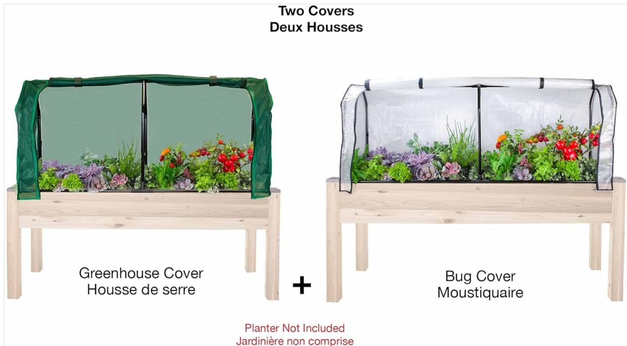
Figure 1.1: The CedarCraft Greenhouse Cover (left) and Bug Cover (right) installed on a planter. Planter is not included.

The CedarCraft Greenhouse & Bug Cover Combo is designed to create an optimal microclimate for your plants, supporting healthier growth and extending your gardening season. This product includes one durable steel frame and two interchangeable covers: a polyethylene greenhouse cover and a mesh bug cover. The system is compatible with CedarCraft planter models from the CC_ELV2372 series.