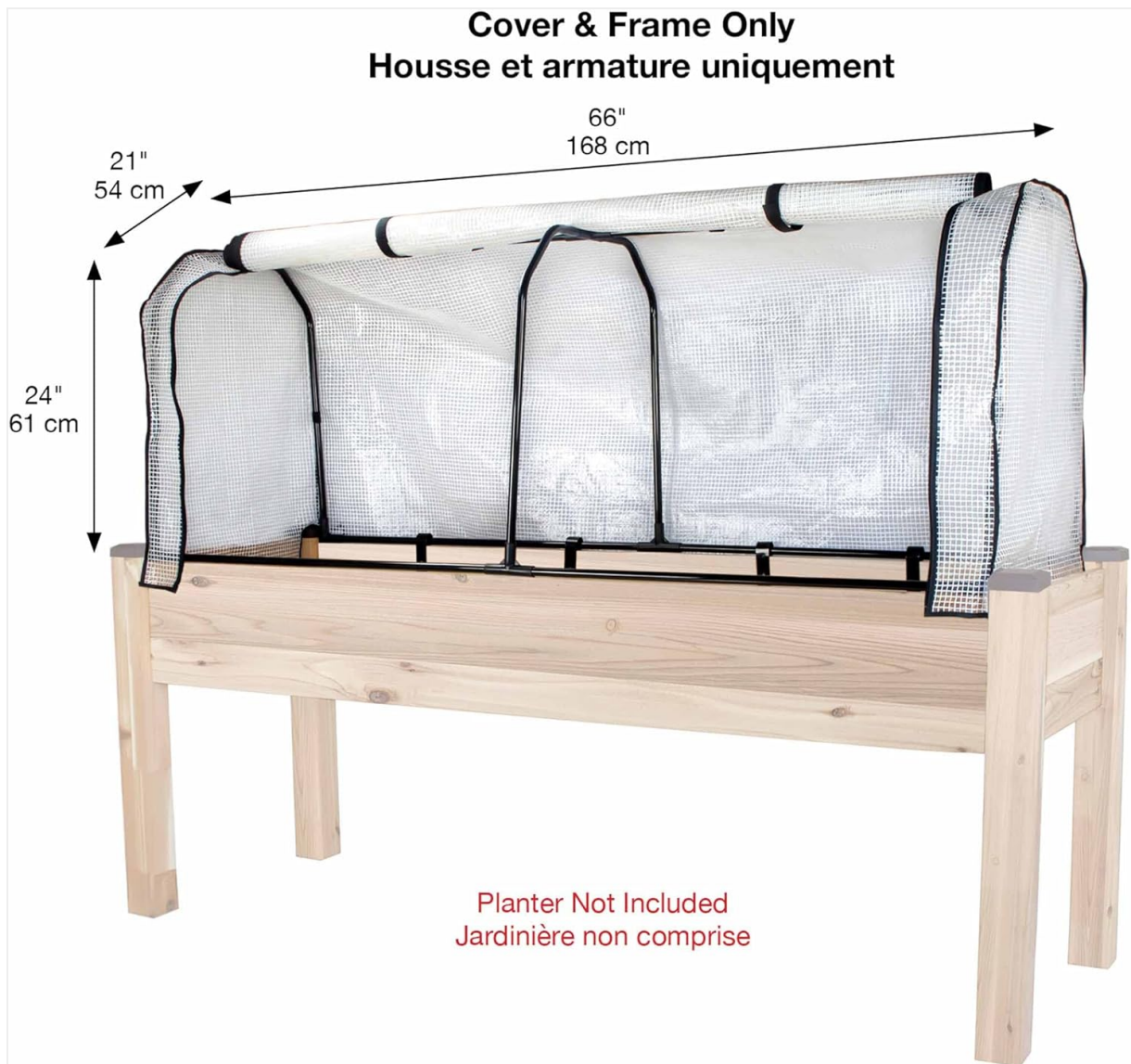
Figure 7.1: Dimensional overview of the CedarCraft Greenhouse & Bug Cover Combo.