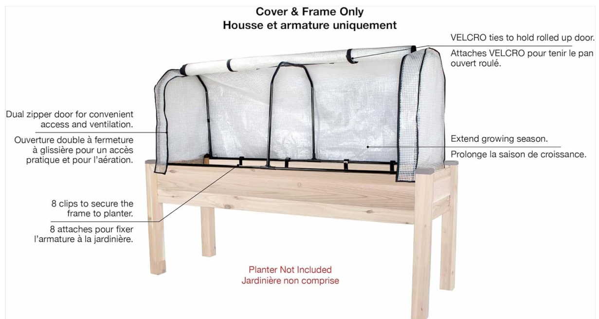
Figure 3.1: Assembly details for the bug cover, highlighting the dual zipper doors, Velcro ties, and frame clips.