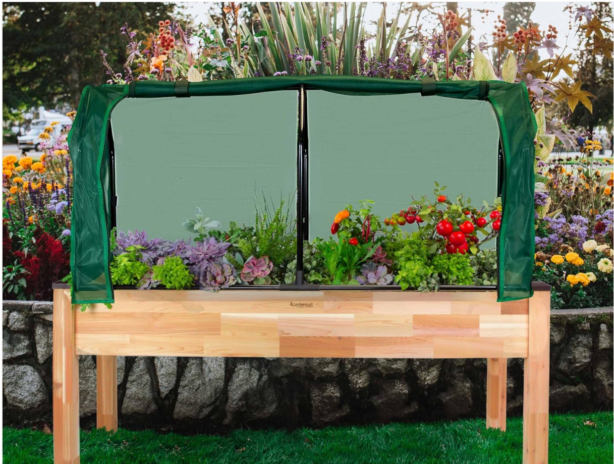
Figure 4.1: Greenhouse cover in use, providing a protective environment for plants.