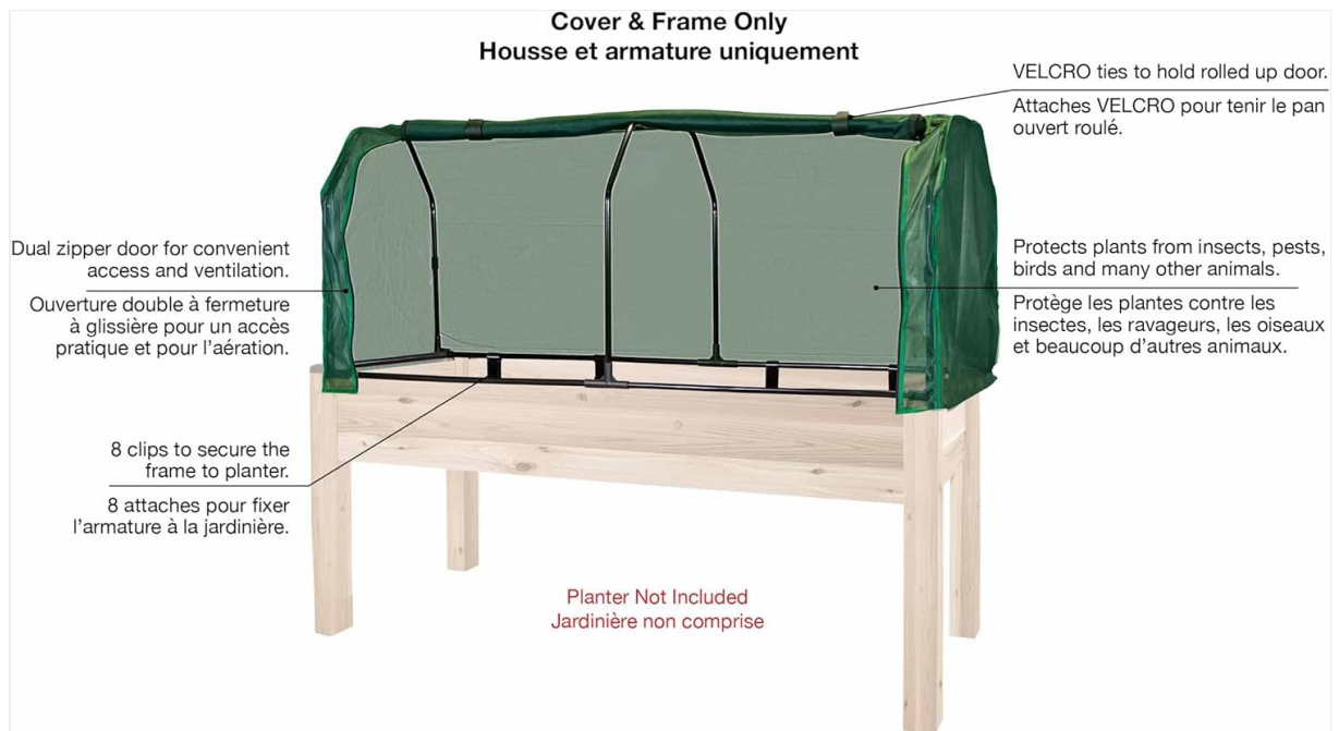
Figure 3.2: Assembly details for the greenhouse cover, highlighting the dual zipper doors, Velcro ties, and frame clips.