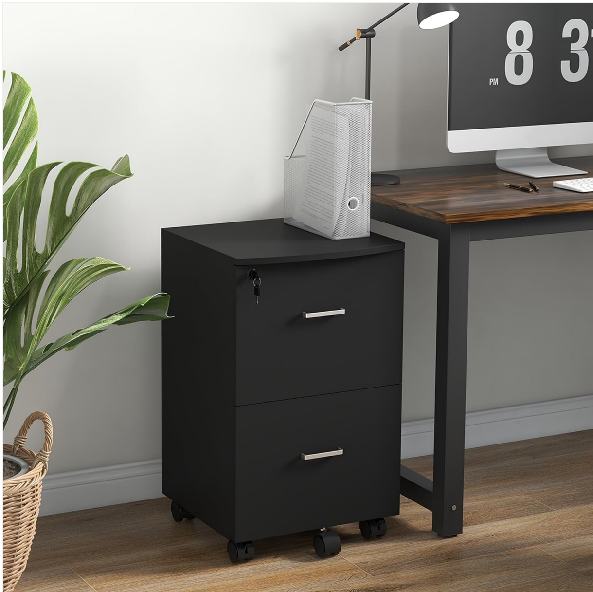
Image: The Vinsetto 2-drawer mobile file cabinet positioned next to a desk in an office environment, showcasing its compact design and utility.