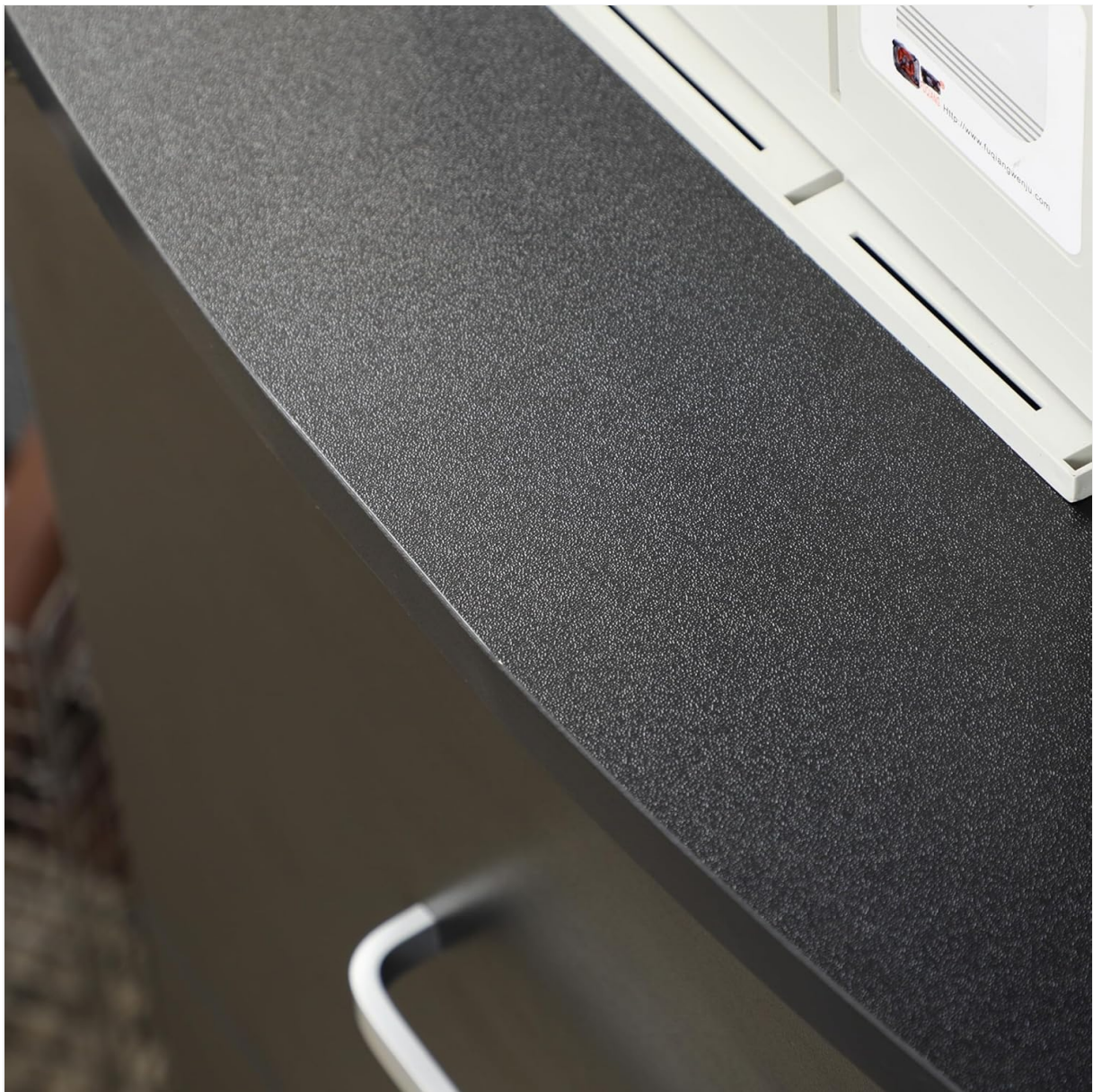
Image: A close-up shot of the cabinet's black melamine surface, highlighting its texture and finish, which is designed for durability and easy cleaning.