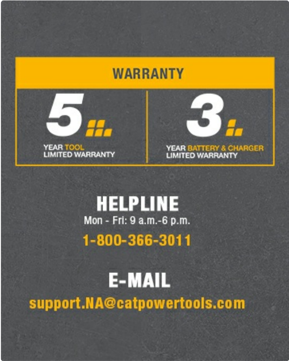
Figure 7: Contact information for customer support.