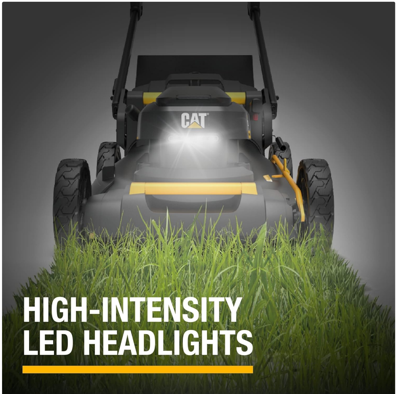
Figure 5: LED headlights for enhanced visibility.