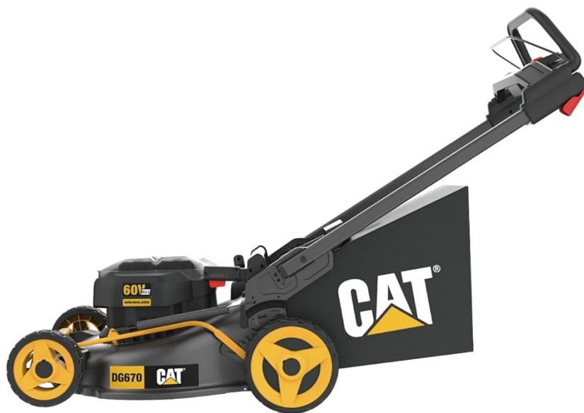
60V CORDLESS PUSH MOWER WITH BAG & DISCHARGE CHUTE