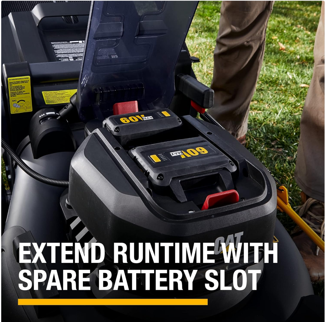
Figure 2: The dual battery compartment for extended runtime.