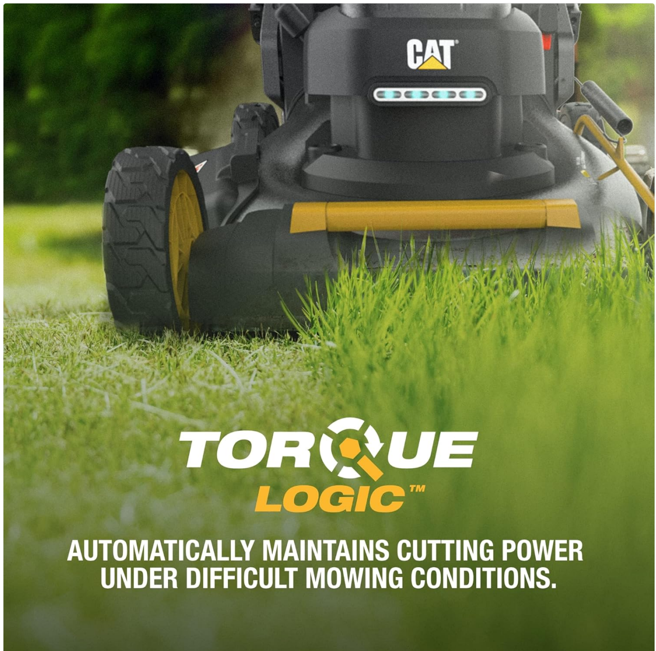
Figure 4: TorqLogic in action, maintaining cutting power.

The integrated TorqLogic system automatically senses grass conditions and adjusts the motor's torque output. This ensures consistent cutting power in dense or tall grass and conserves battery life in lighter conditions.