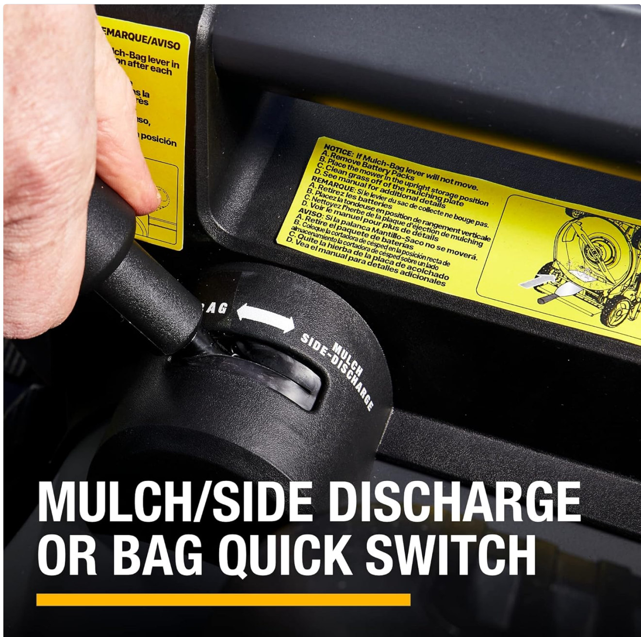
Figure 3: The quick-switch lever for selecting cutting modes.