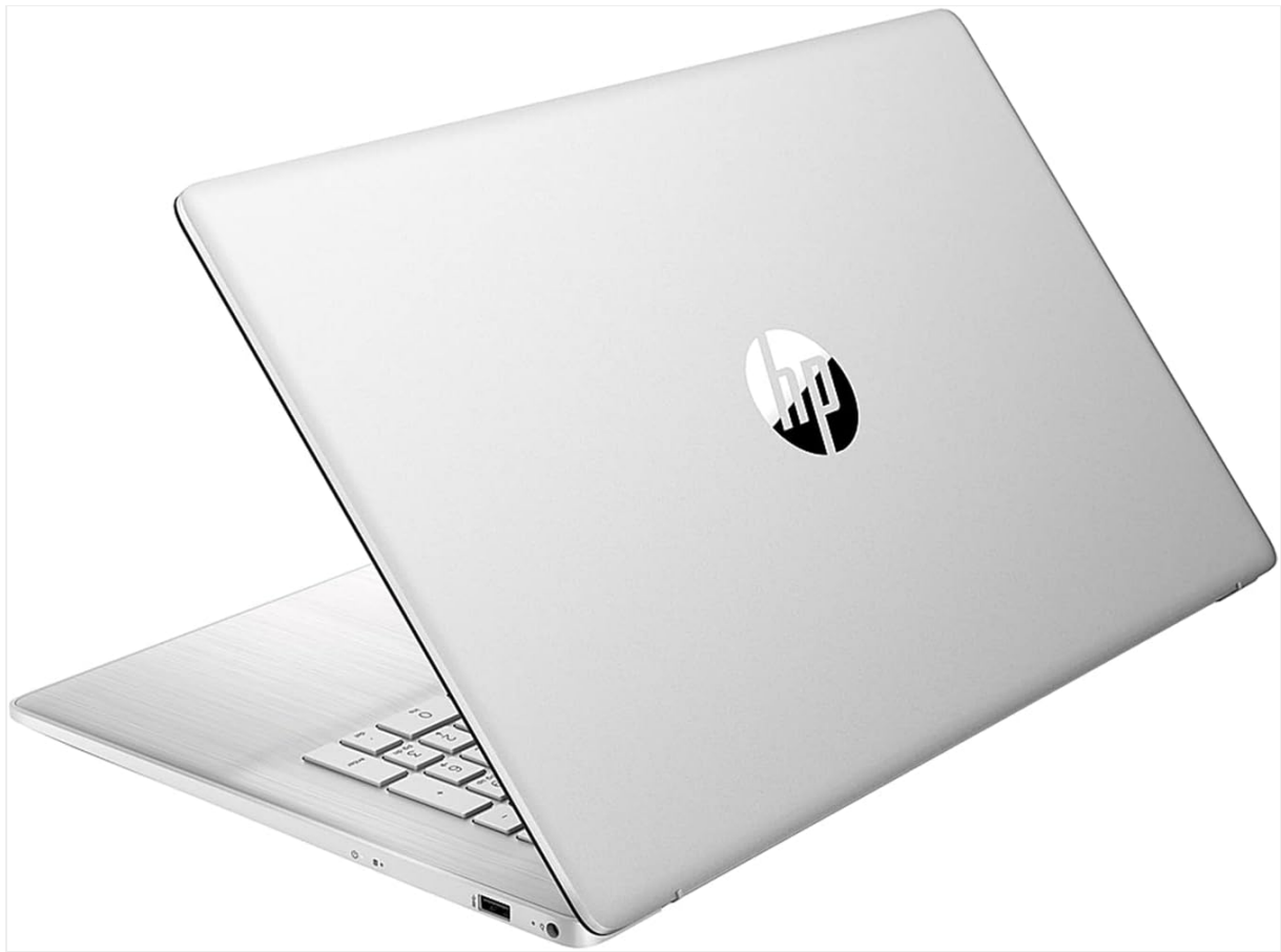
Figure 5: Back view of the HP 17 Laptop.