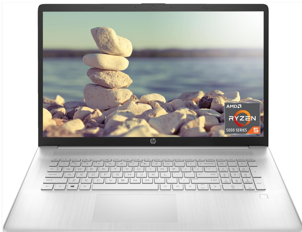
Figure 1: Front view of the HP 17 Laptop.

This manual provides essential information for setting up, operating, and maintaining your HP 17 Laptop, Model TPN-I140. This device features a 17.3-inch Full HD display, an AMD Ryzen 5 5500U processor, 16GB of DDR4 RAM, and a 512GB PCIe NVMe M.2 Solid State Drive, running on Windows 11 Home. Please read this manual thoroughly to ensure proper use and to maximize the lifespan of your laptop.