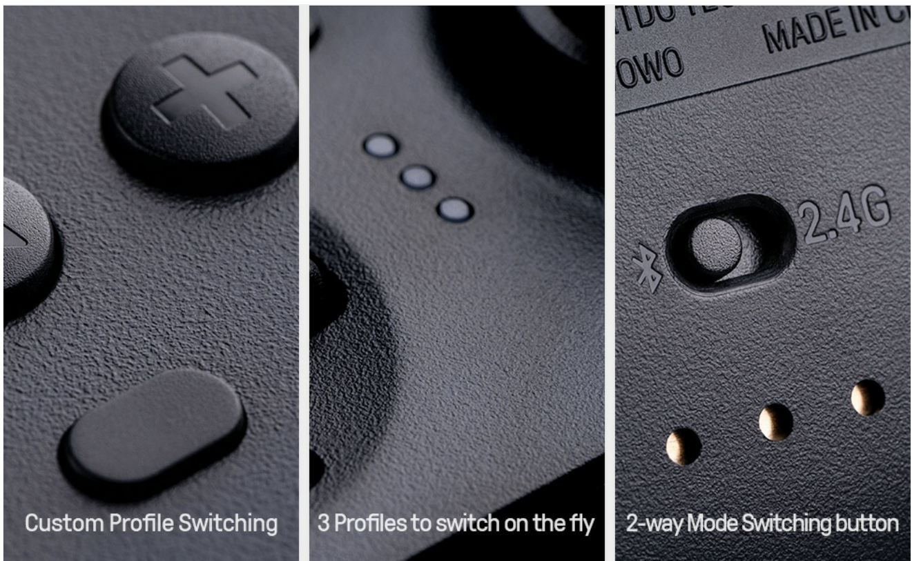
Image: Detailed view of the 8Bitdo Ultimate Bluetooth Controller's central features, including the custom profile switch, player indicator lights, and the 2-way mode switching button.