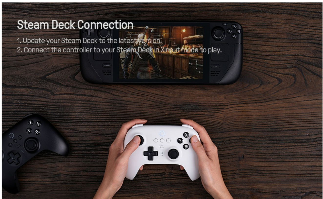
Image: The 8Bitdo Ultimate Bluetooth Controller being used with a Steam Deck, illustrating the connection process for optimal