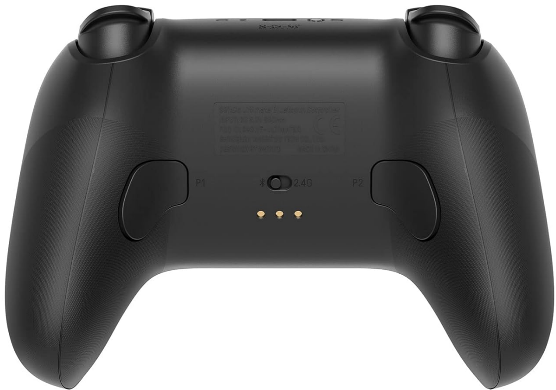
Image: The rear of the 8Bitdo Ultimate Bluetooth Controller, highlighting the 2-way mode switch (Bluetooth/2.4G) and the two programmable back paddle buttons.