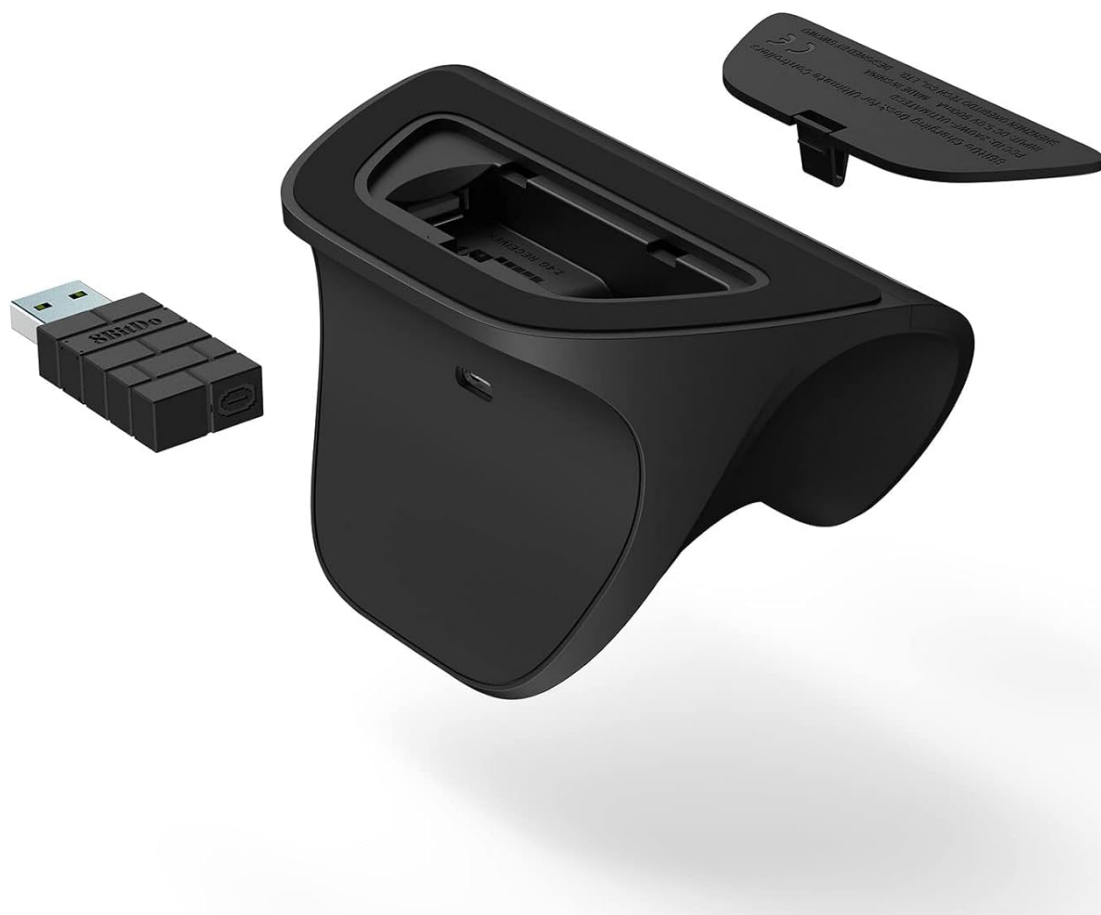
Image: The charging dock, 2.4g wireless adapter, and battery cover, illustrating the key components included with the controller.