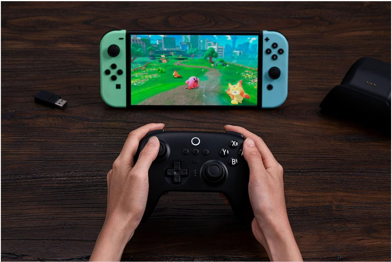
Image: A user actively playing a game on a Nintendo Switch console, holding the 8Bitdo Ultimate Bluetooth Controller for gameplay.