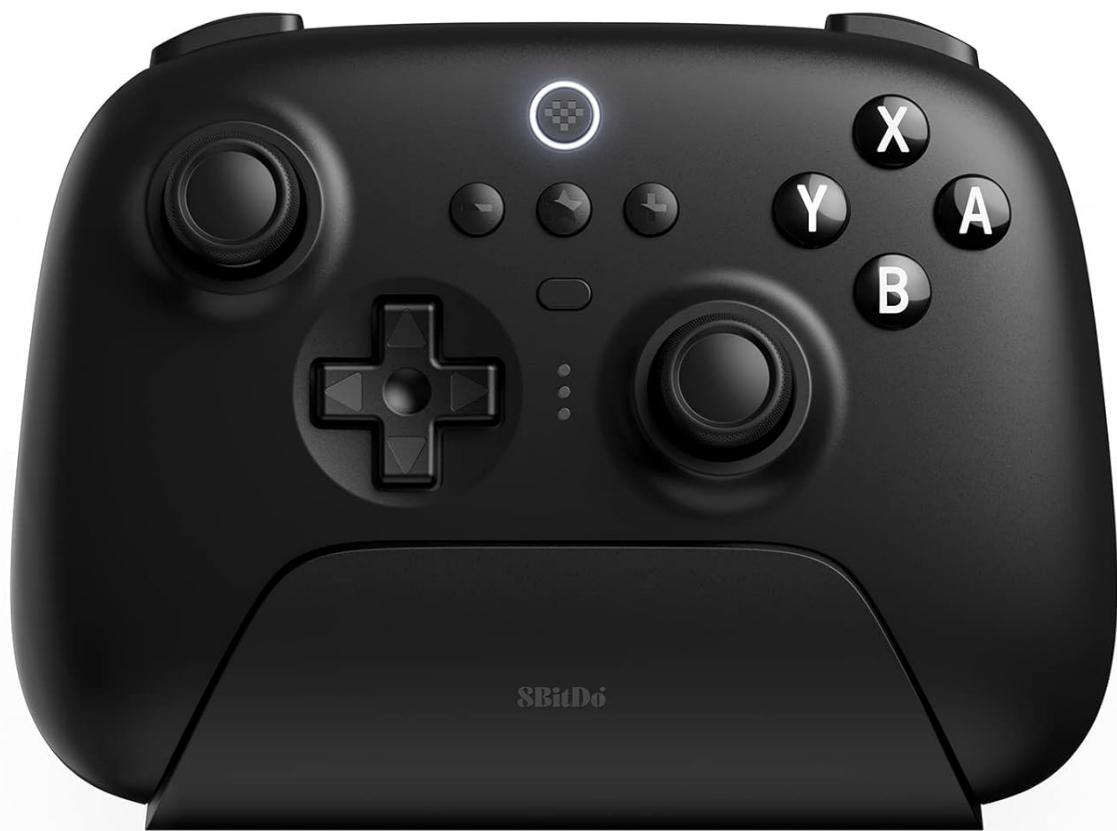
Image: The 8Bitdo Ultimate Bluetooth Controller resting on its dedicated charging dock, showcasing its sleek black design.