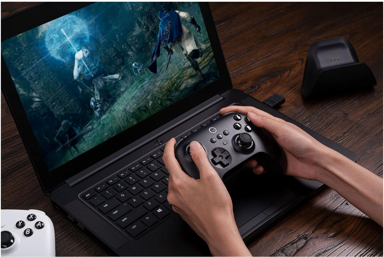
Image: A person using the 8Bitdo Ultimate Bluetooth Controller to play a game on a laptop, demonstrating PC compatibility.