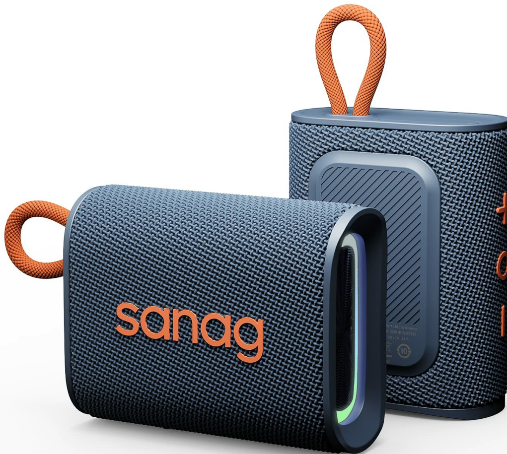
Image: Sanag M13S Portable Bluetooth Speaker in black with orange accents.