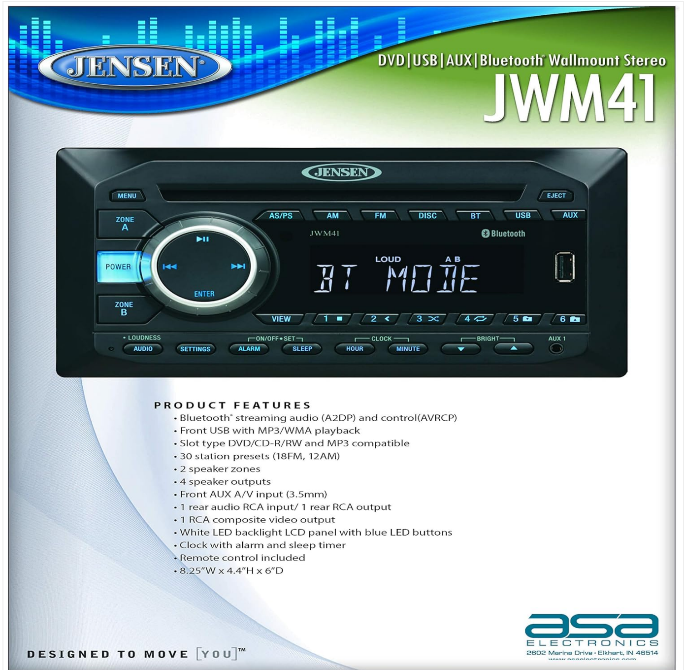
Figure 2: Diagram highlighting the key features and connectivity options of the JWM41 stereo.