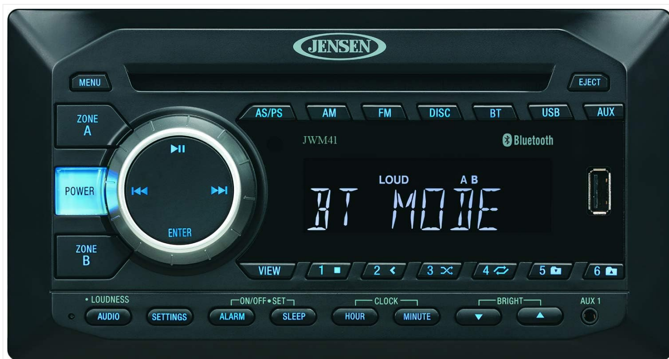
Figure 1: Front view of the Jensen JWM41 Wallmount Stereo, showing the display, control buttons, and disc slot.

This manual provides detailed instructions for the installation, operation, and maintenance of your Jensen JWM41 Wallmount Stereo. Please read this manual thoroughly before using the unit to ensure proper operation and to prevent damage.