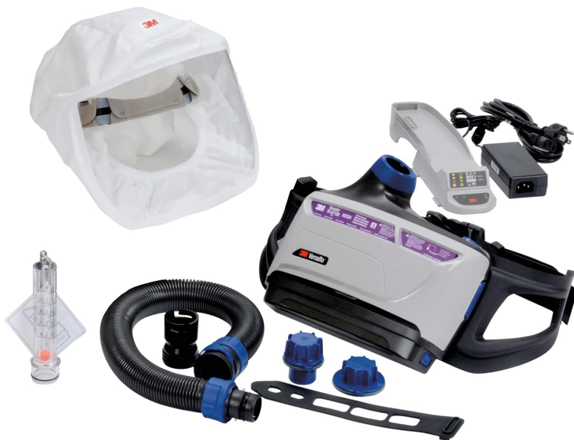
Figure 1: All components included in the 3M Versaflo TR-600-HKS PAPR Kit.