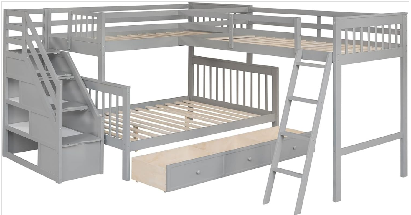
Image 4.1: An angled view of the fully assembled Bellemave L-Shape Triple Bunk Bed, showing the integrated stairs, ladder, and the overall L-shaped configuration.