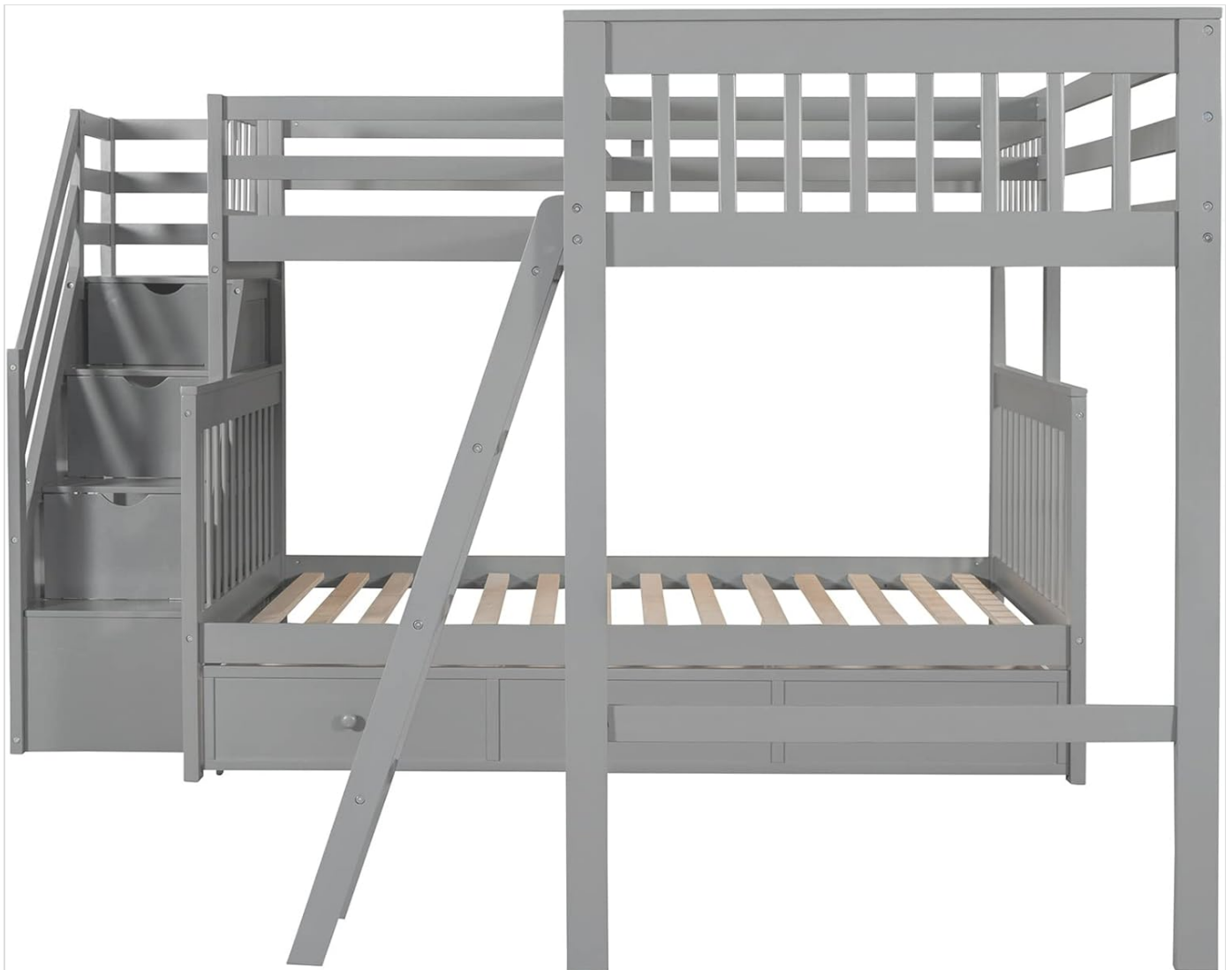
Image 3.1: An exploded view of the Bellemave L-Shape Triple Bunk Bed, illustrating the main structural components including the bed frames, slats, stairs, and drawers.