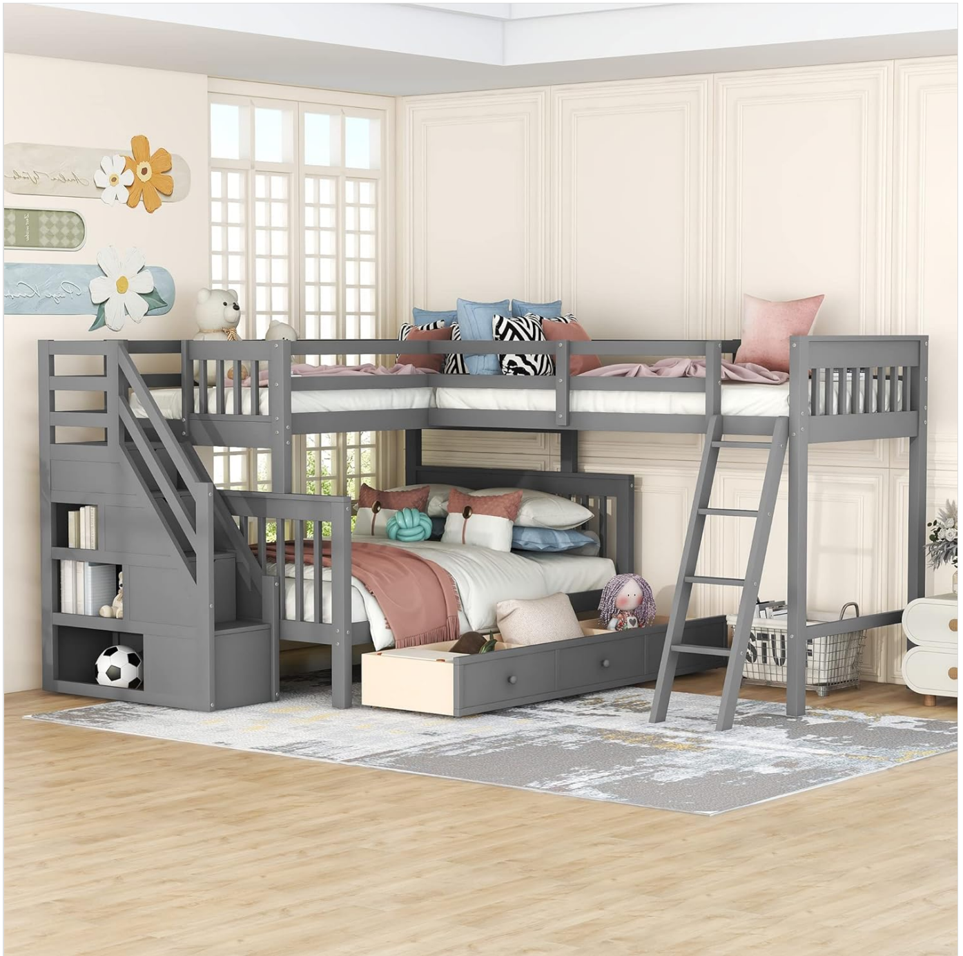
Image 1.1: The Bellemave L-Shape Triple Bunk Bed, showcasing its Twin over Full configuration, integrated stairs, and attached loft bed, situated in a bedroom environment.