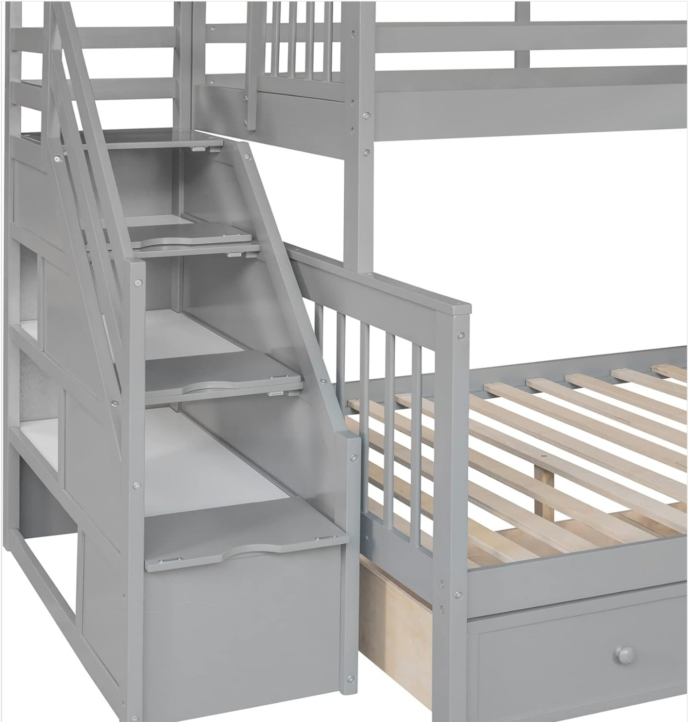
Image 5.1: A detailed view of the integrated stairs, highlighting the built-in storage compartments within each step.