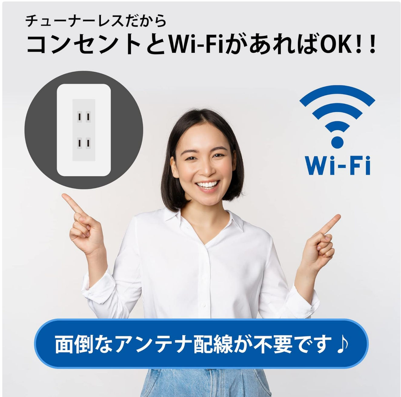
Figure 3: Power and Wi-Fi connectivity for the tunerless TV.

Connect the power cable to the TV and then to a power outlet. This TV requires only a power connection and Wi-Fi for internet streaming.