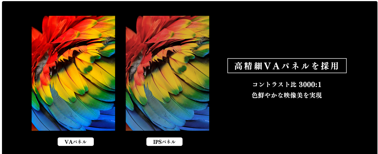
Figure 7: High-definition VA panel for vivid image quality.