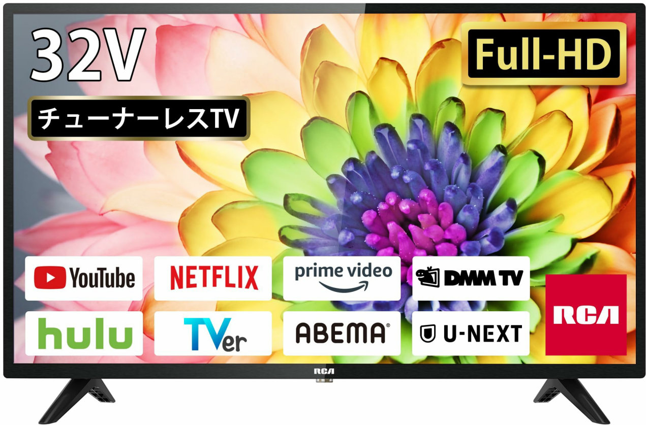
Figure 1: Front view of the RCA 32V-type FHD Tunerless Smart TV.