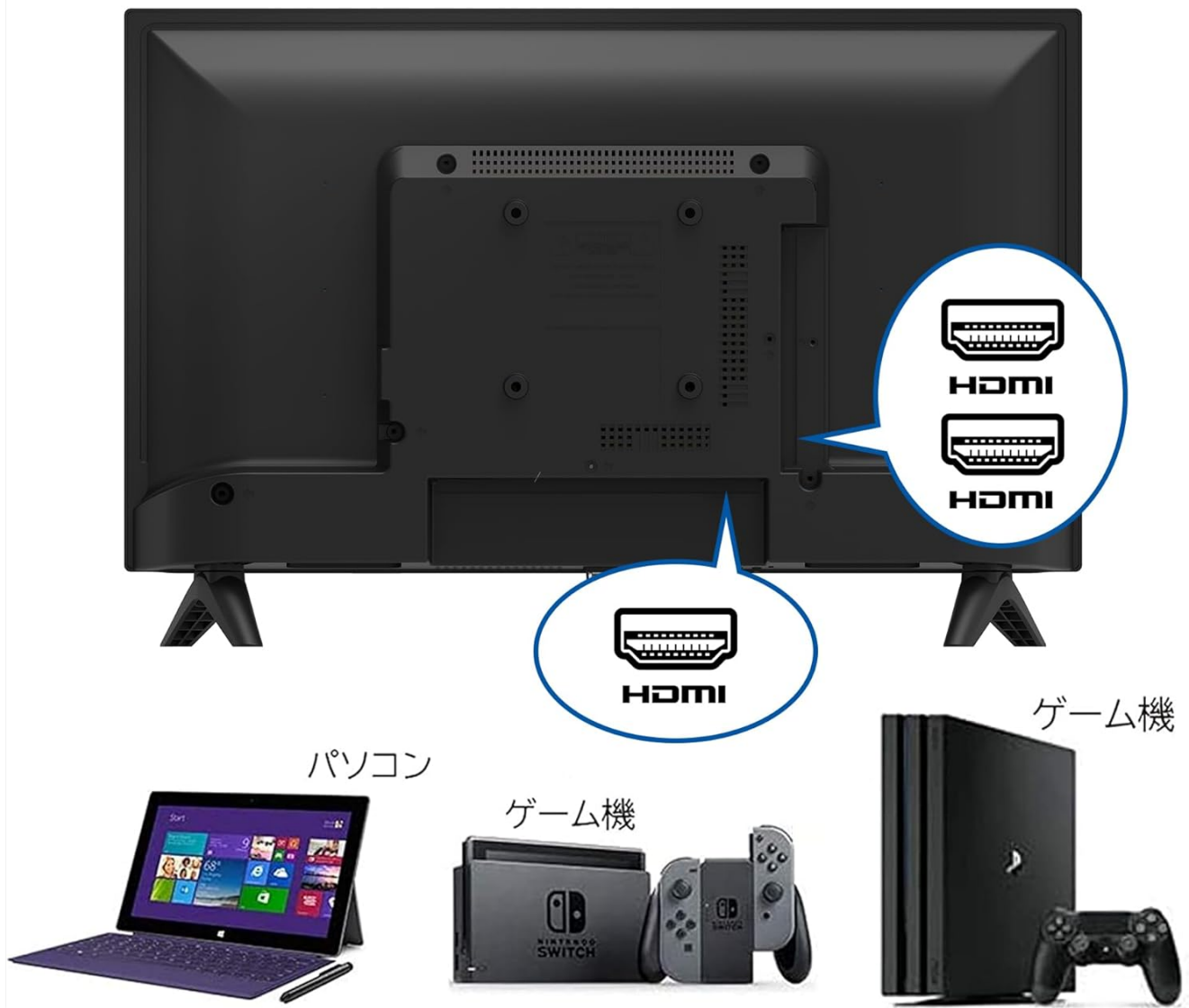
Figure 4: Connecting external devices via HDMI ports.