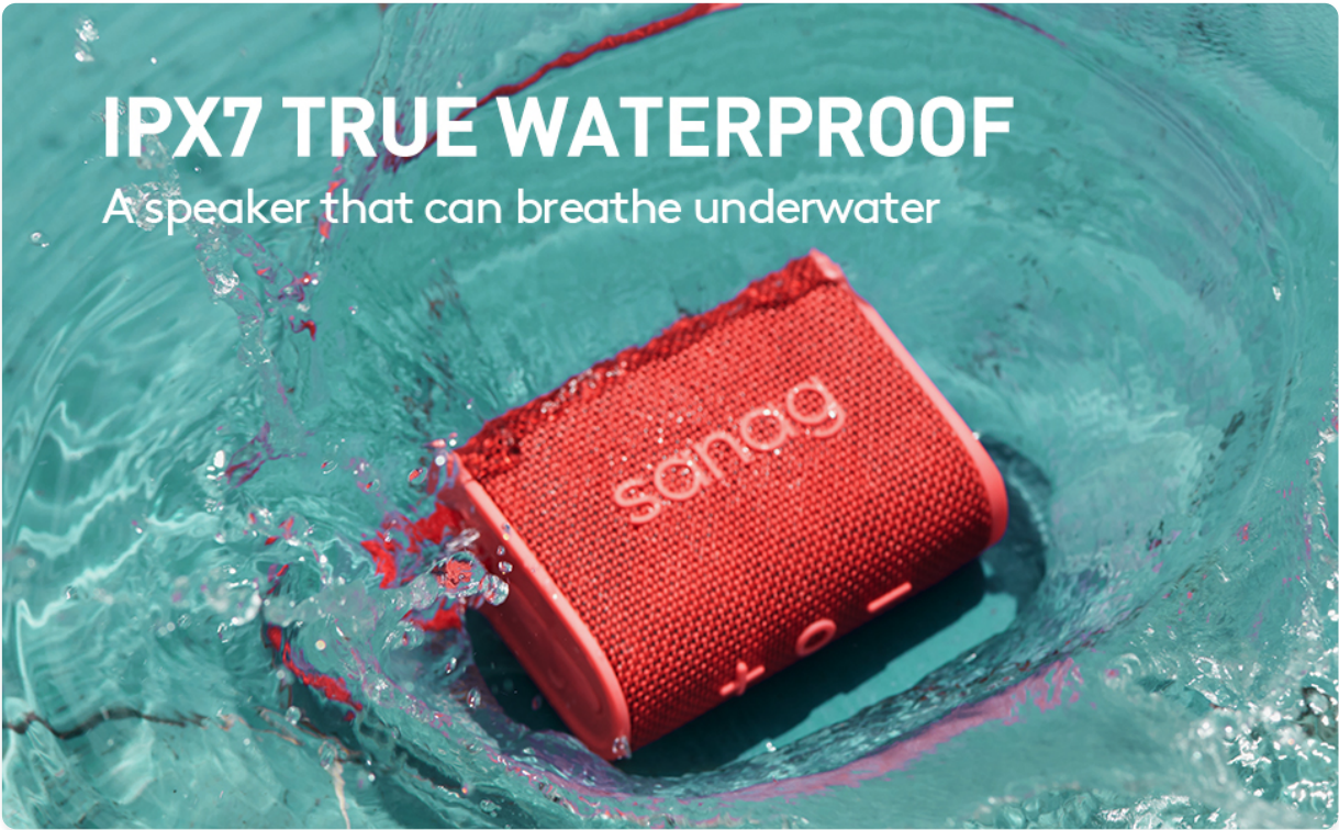
Image: A red Sanag M13S Pro speaker partially submerged in water, with splashes, illustrating its IPX7 true waterproof capability.

Clean the speaker with a soft, dry cloth. Avoid using harsh chemicals or abrasive materials. Store the speaker in a cool, dry place when not in use.