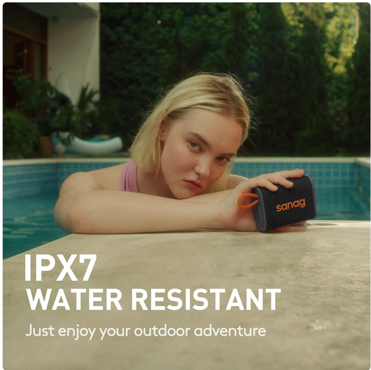
Image: Sanag M13S Pro speaker placed on the edge of a swimming pool, emphasizing its IPX7 water-resistant feature for outdoor adventures.