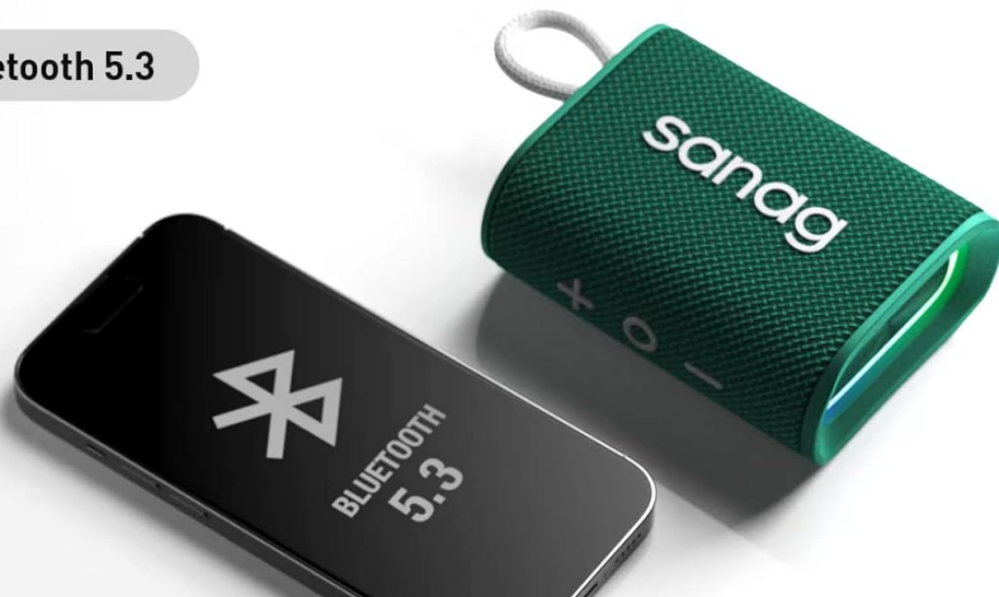
Image: Sanag M13S Pro speaker positioned next to a smartphone displaying the Bluetooth 5.3 logo, illustrating the wireless connection capability. The speaker also shows its TF card slot.

Your browser does not support the video tag.