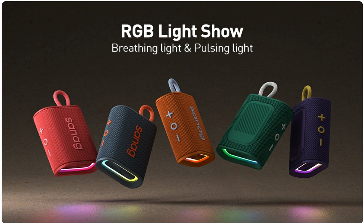
Image: Multiple Sanag M13S Pro speakers in different colors (red, black, orange, green, purple) showcasing their vibrant RGB light show, with lights pulsing from the bottom edge.

Your browser does not support the video tag.