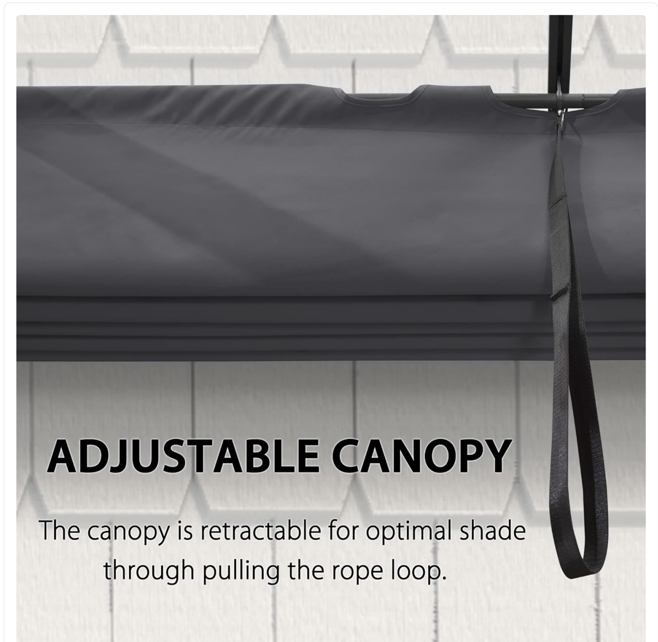
Image Description: A close-up of the adjustable canopy, showing the rope loop mechanism used to retract or extend the shade. This image illustrates the ease of operation for shade adjustment.

The retractable canopy allows for flexible shade control. To adjust the canopy, use the integrated rope loop system. Pull the rope to extend or retract the canopy to your desired position. The locking system will secure the canopy in place.