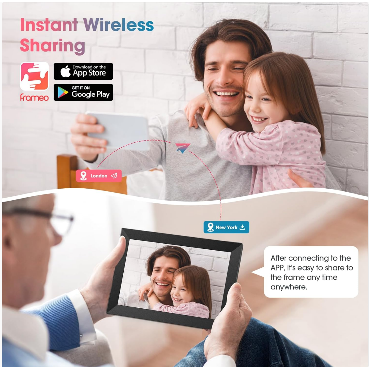
Image 2: This image illustrates the instant wireless sharing capability of the Skyzoo digital picture frame. A person is shown using a smartphone to send photos to the frame, emphasizing the ease of sharing content remotely.