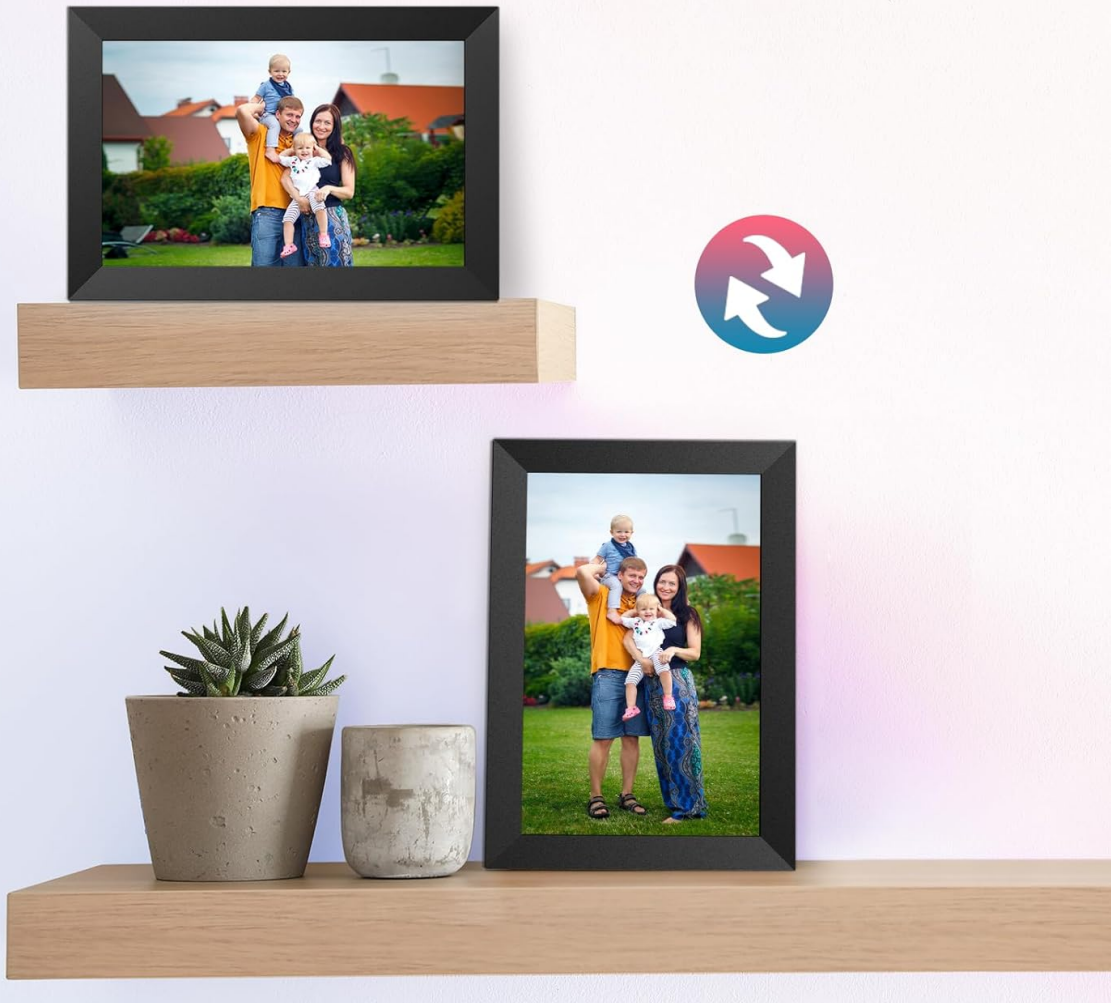
Image 3: Two Skyzoo digital picture frames are shown, one in landscape and one in portrait orientation, both displaying the same family photo. This highlights the auto-rotation feature, which automatically adjusts the image to fit the frame's orientation.

Automatically rotate the orientation of photos