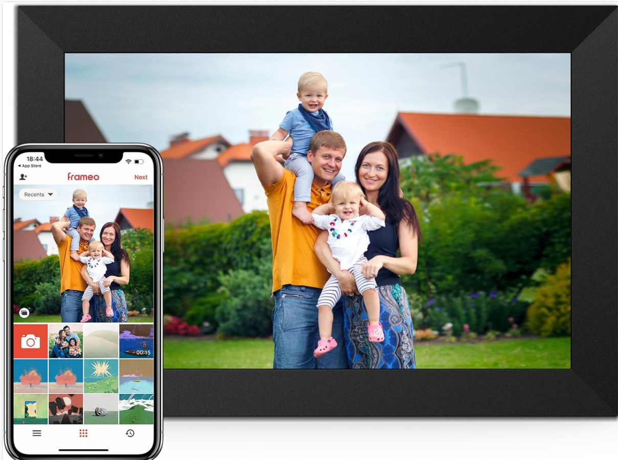
Image 1: The Skyzoo 10.1-inch WiFi Digital Picture Frame displaying a family photo, positioned next to a smartphone showing the Frameo app interface. This illustrates the remote sharing capability of the device.

This manual provides instructions for the setup, operation, and maintenance of your Skyzoo 10.1" WiFi Digital Picture Frame. Please read this manual thoroughly before using the device to ensure proper functionality and longevity.