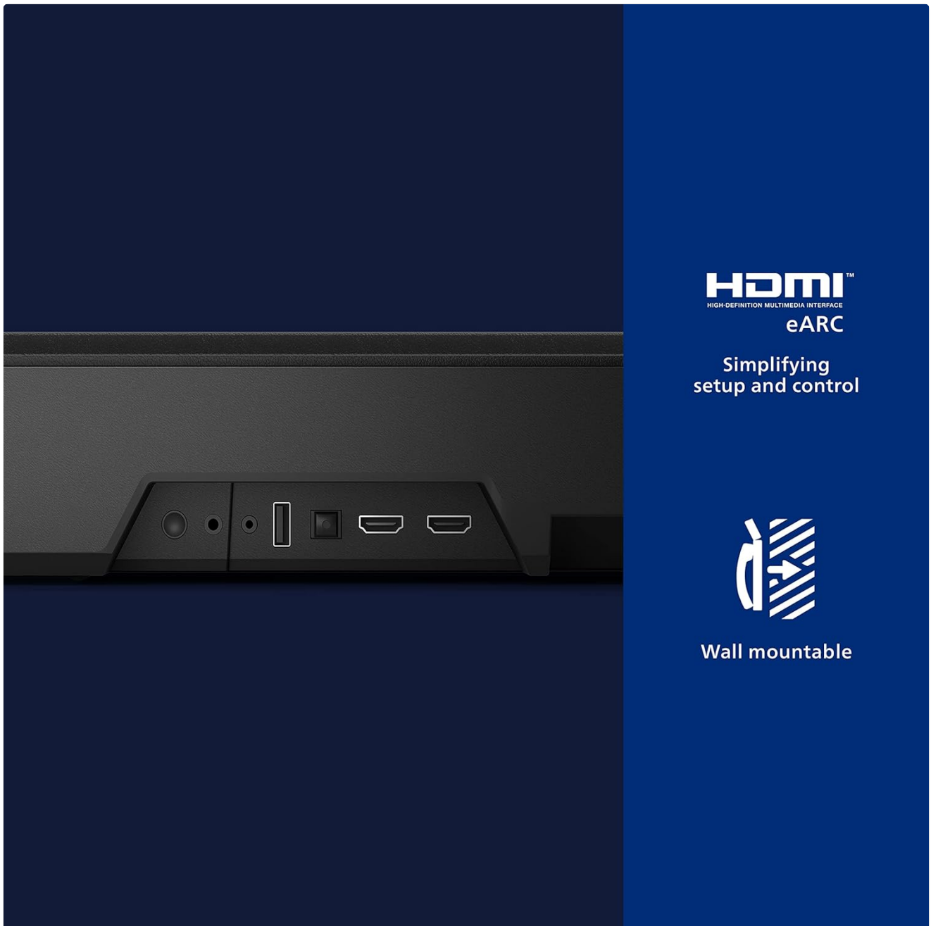
Image: Close-up of the soundbar's rear panel, highlighting the HDMI eARC port and indicating its wall-mountable design.