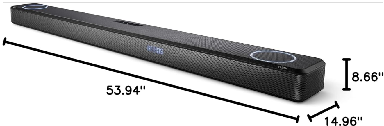
Image: Dimensional drawing of the soundbar, indicating its length, width, and height.