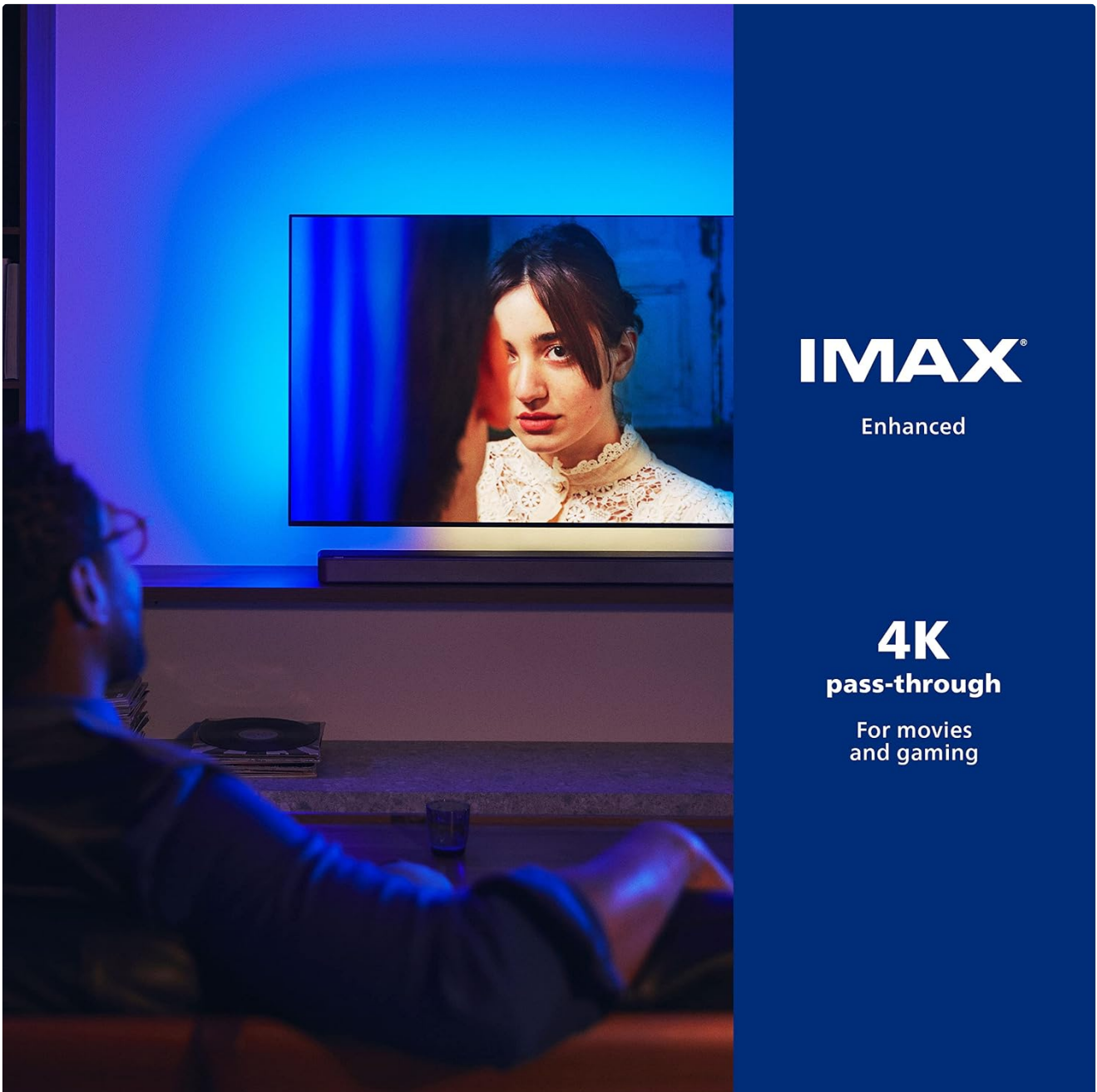
Image: A person enjoying content with the soundbar, illustrating the IMAX Enhanced and 4K pass-through capabilities.