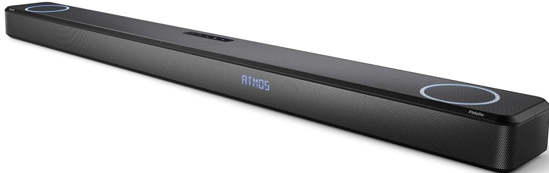
Image: Front view of the Philips Fidelio FB1 Soundbar, showcasing its sleek design and integrated display.