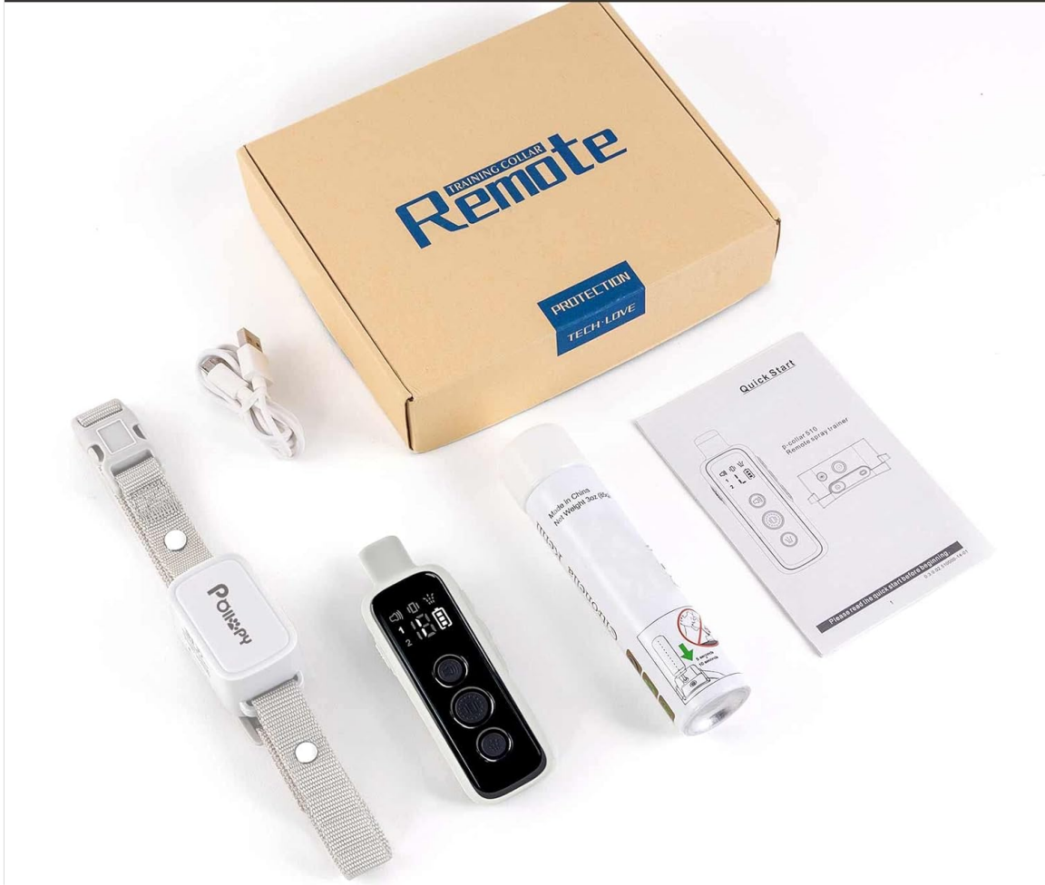
Figure 2.1: All components included in the package.