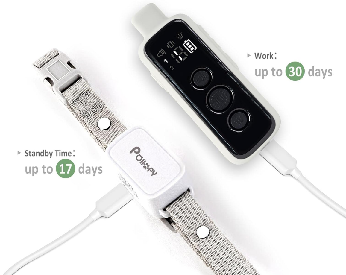
Figure 4.1: USB Charging Design for collar and remote.