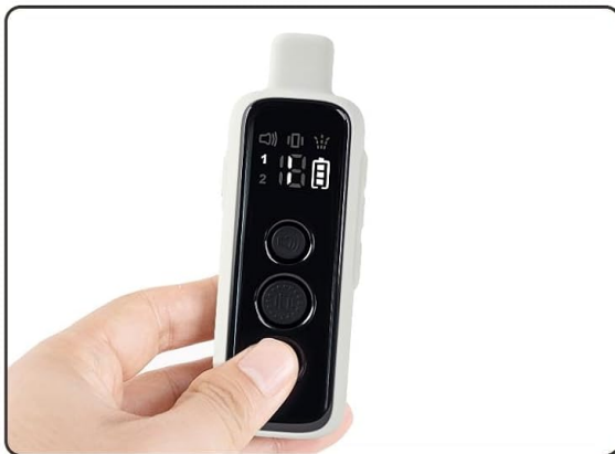
Collar Requires the Remote to Work Non-automatic