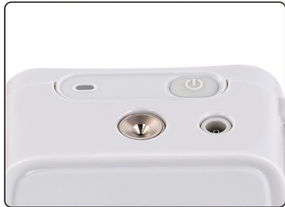
Citronella Spray Valve