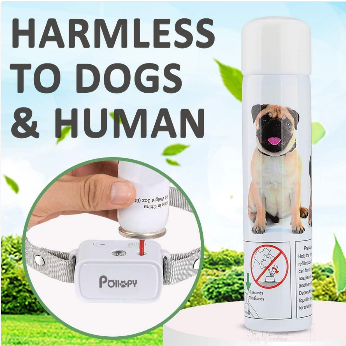
Figure 4.3: Refilling the citronella spray.