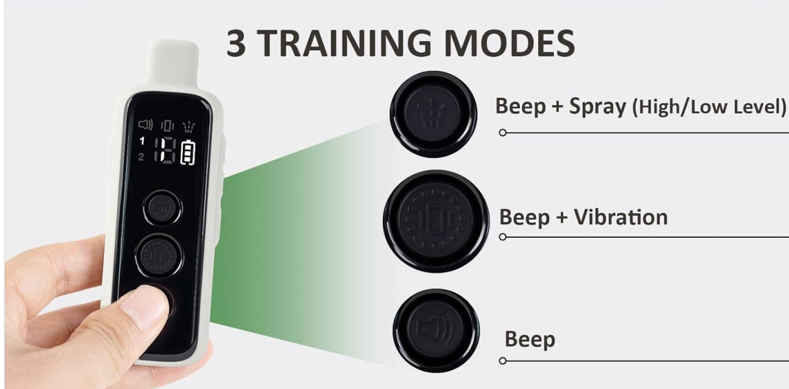
Figure 5.1: The three training modes of the collar.