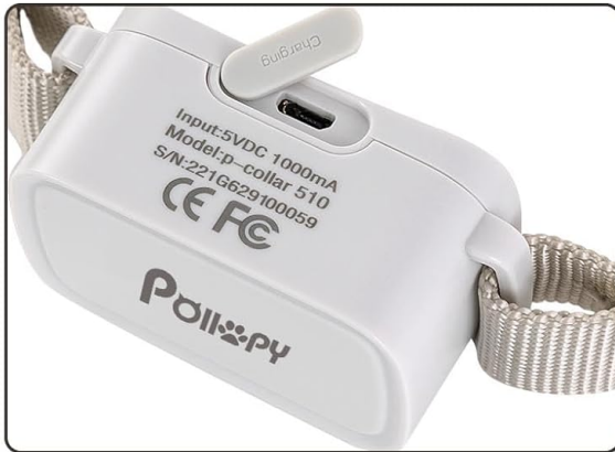
CE FCC Certification