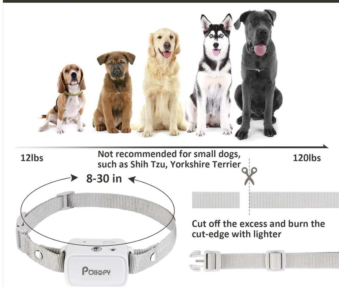
Figure 4.4: Collar sizing and adjustment.