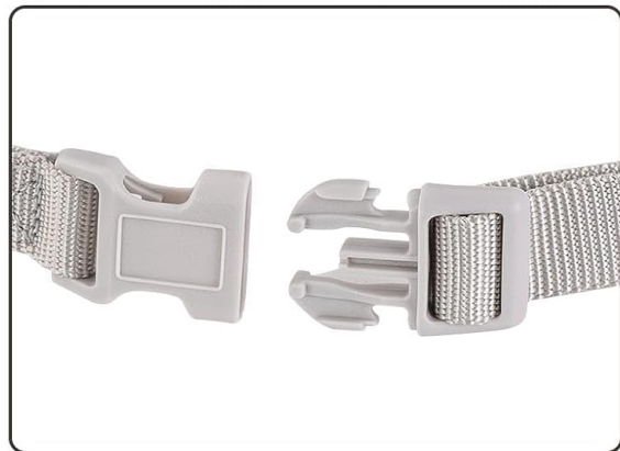
Safety Latch for Easy Wearing