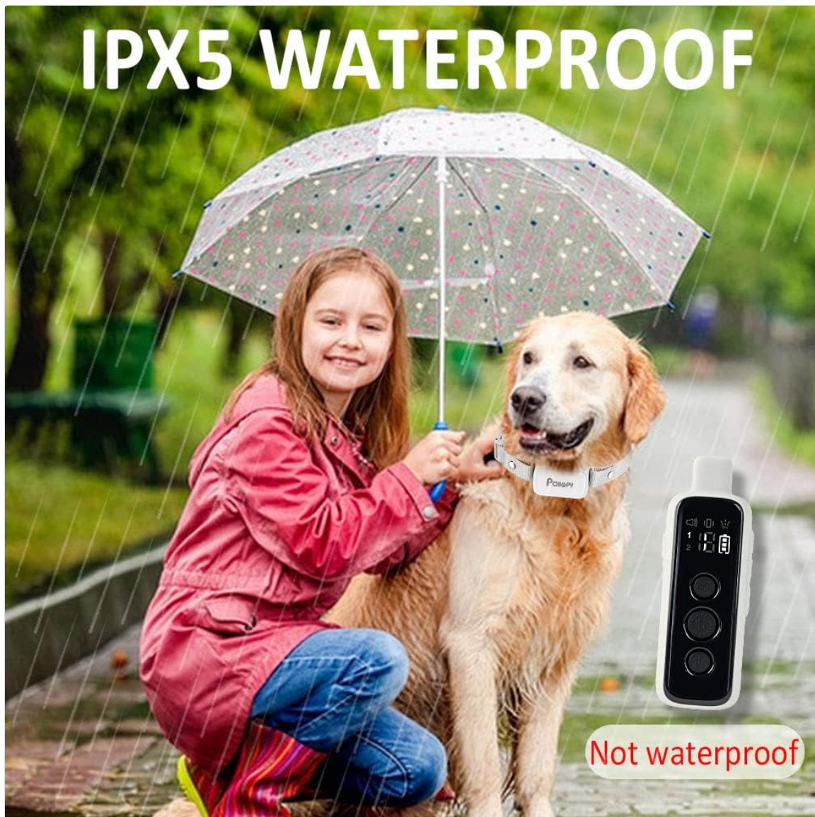
Figure 6.1: IPX5 Daily Waterproof rating for the collar.