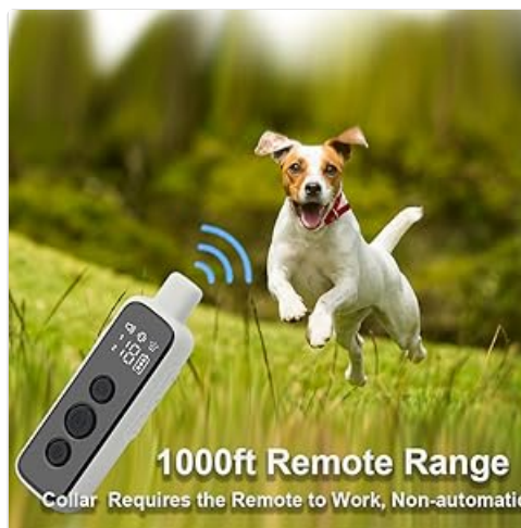
Figure 3.2: Overview of the remote and collar components.