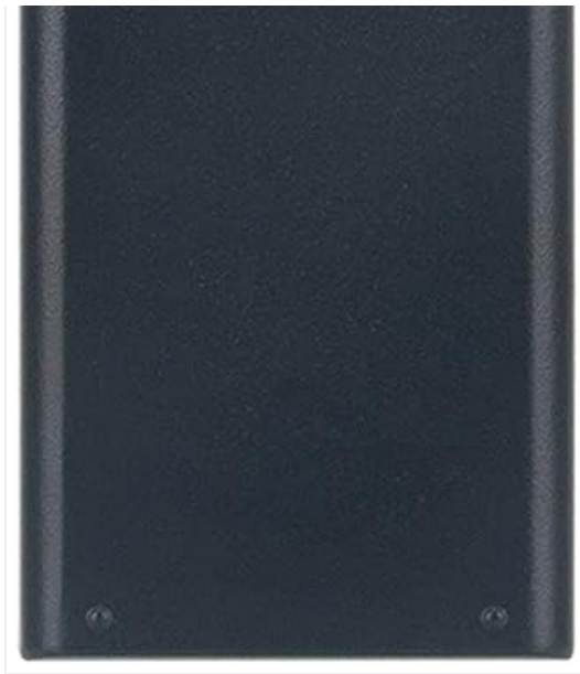
Image: Back view of the VINABTY RMT-AH410U remote control, highlighting the battery compartment cover.