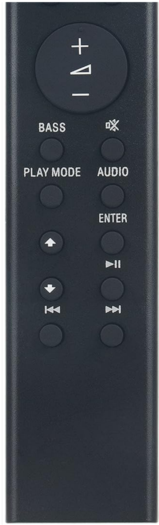
Image: Front view of the VINABTY RMT-AH410U replacement remote control, showcasing its button layout and dark gray finish.