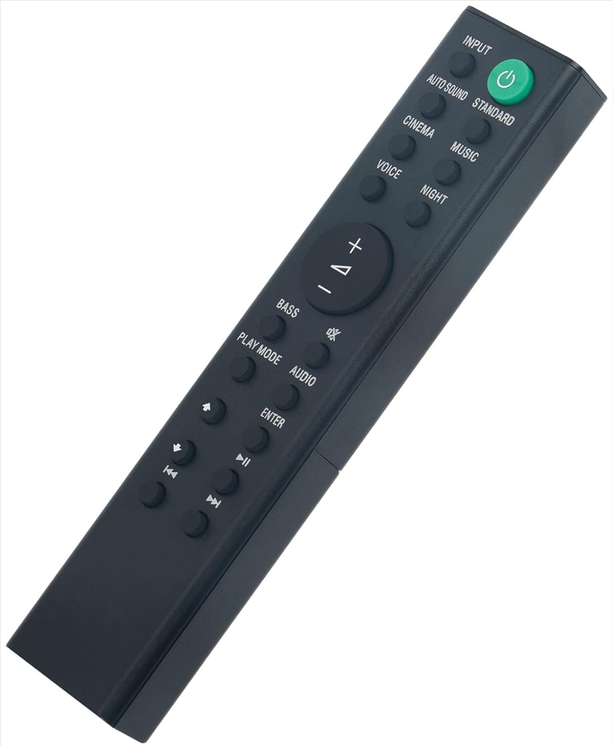
Image: Angled view of the VINABTY RMT-AH410U remote control, providing a clear perspective of the button arrangement.