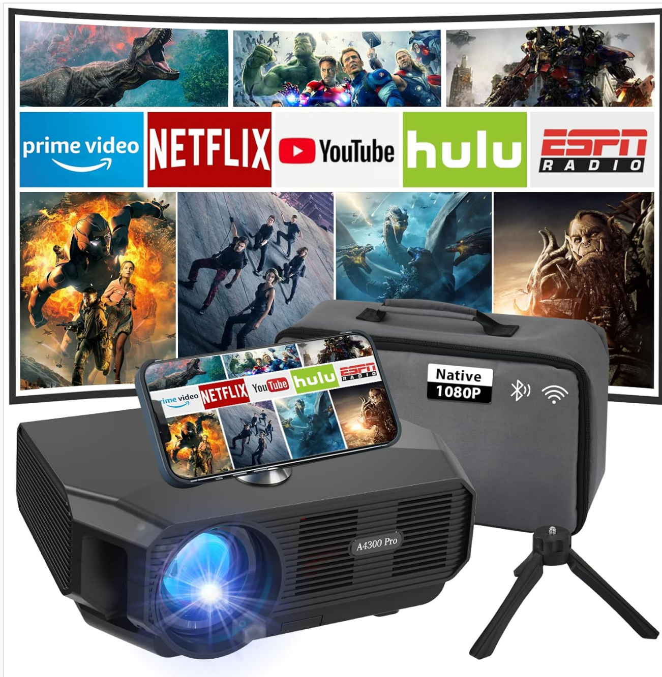
Figure 3.1: The WHDPETS A4300 Pro Projector in a home theater setup, showcasing its multimedia capabilities.