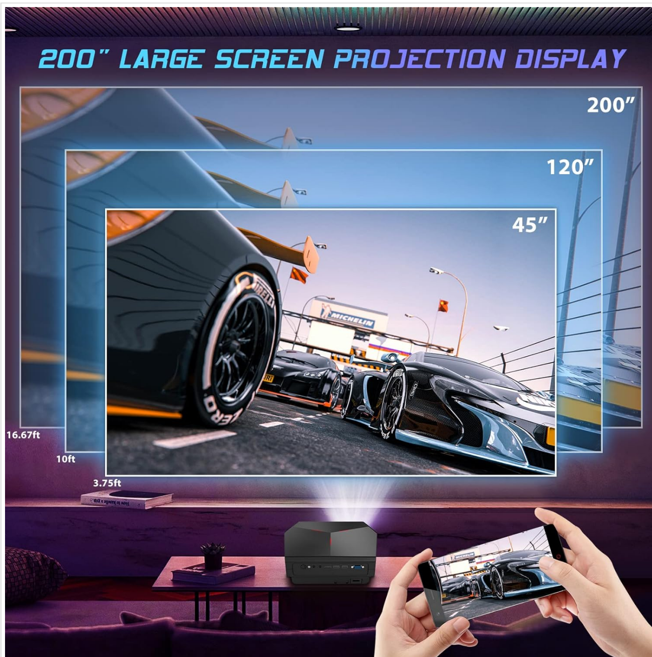
Figure 3.4: The projector's ability to produce a large screen display up to 200 inches.