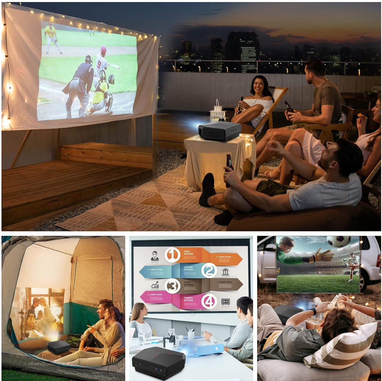
Figure 3.5: Examples of multiple scenarios where the projector can be effectively utilized.