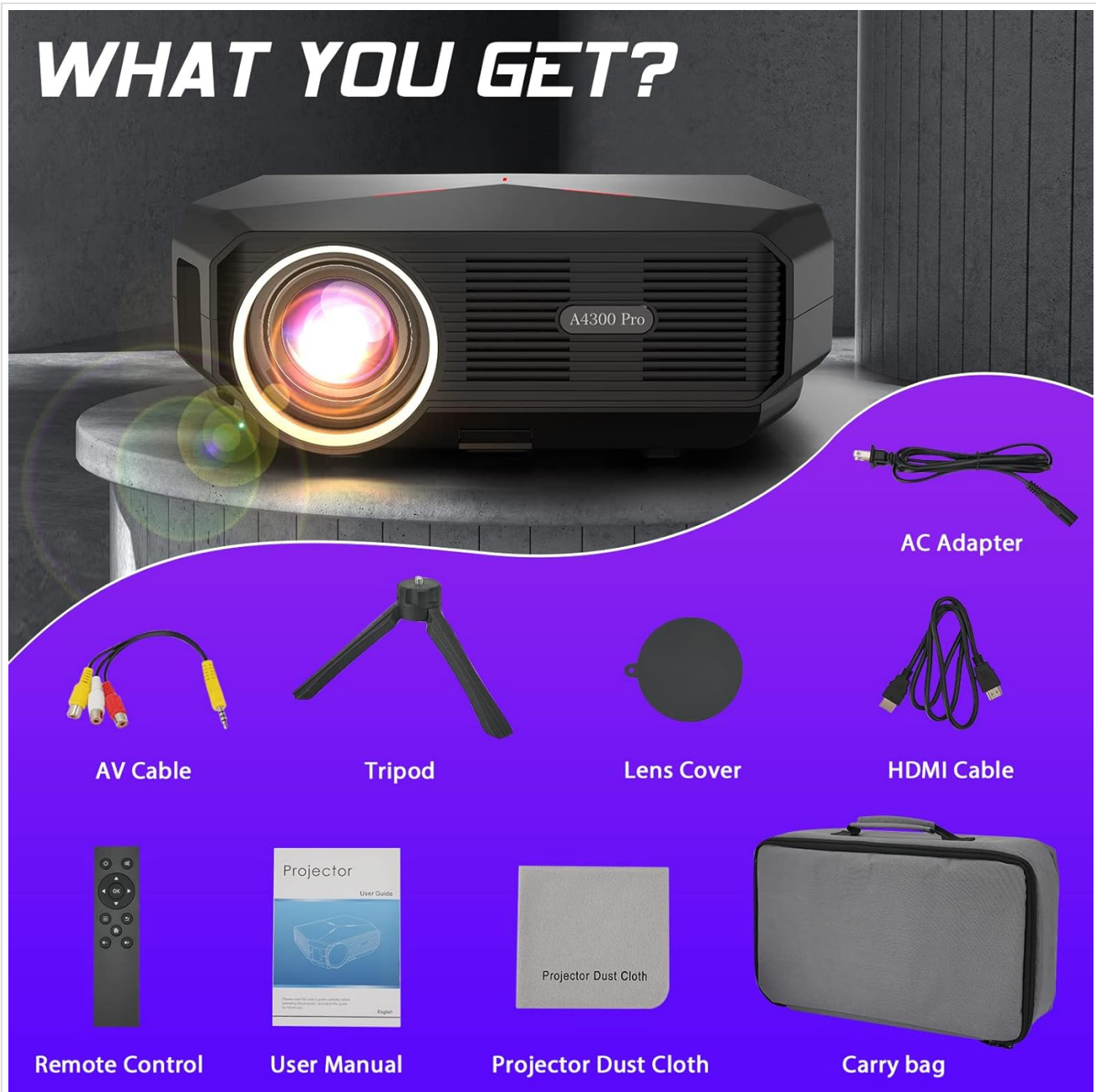
Figure 2.1: All items included in the WHDPETS A4300 Pro Projector package.