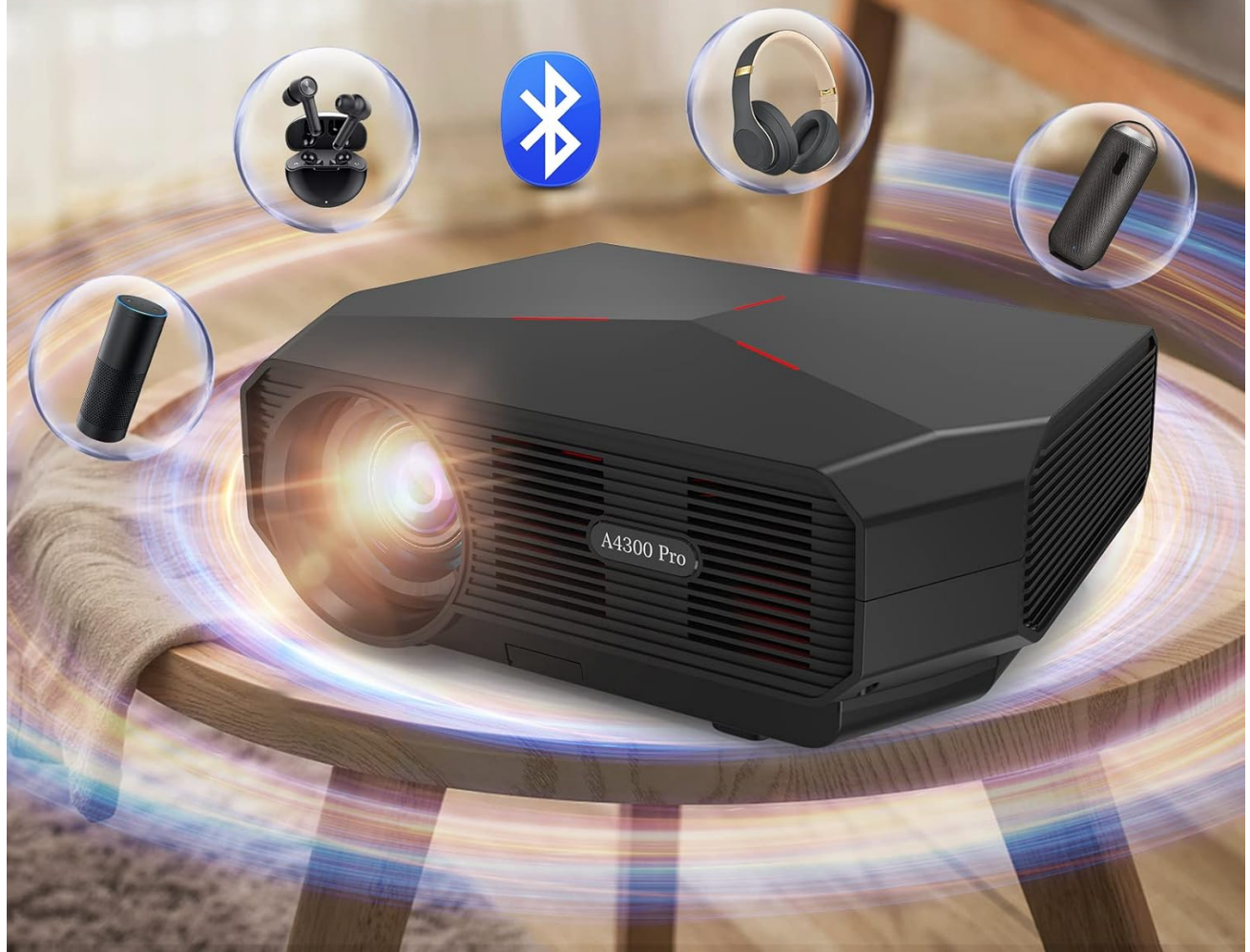
Figure 3.3: The projector's Bluetooth function, allowing connection to external audio devices.