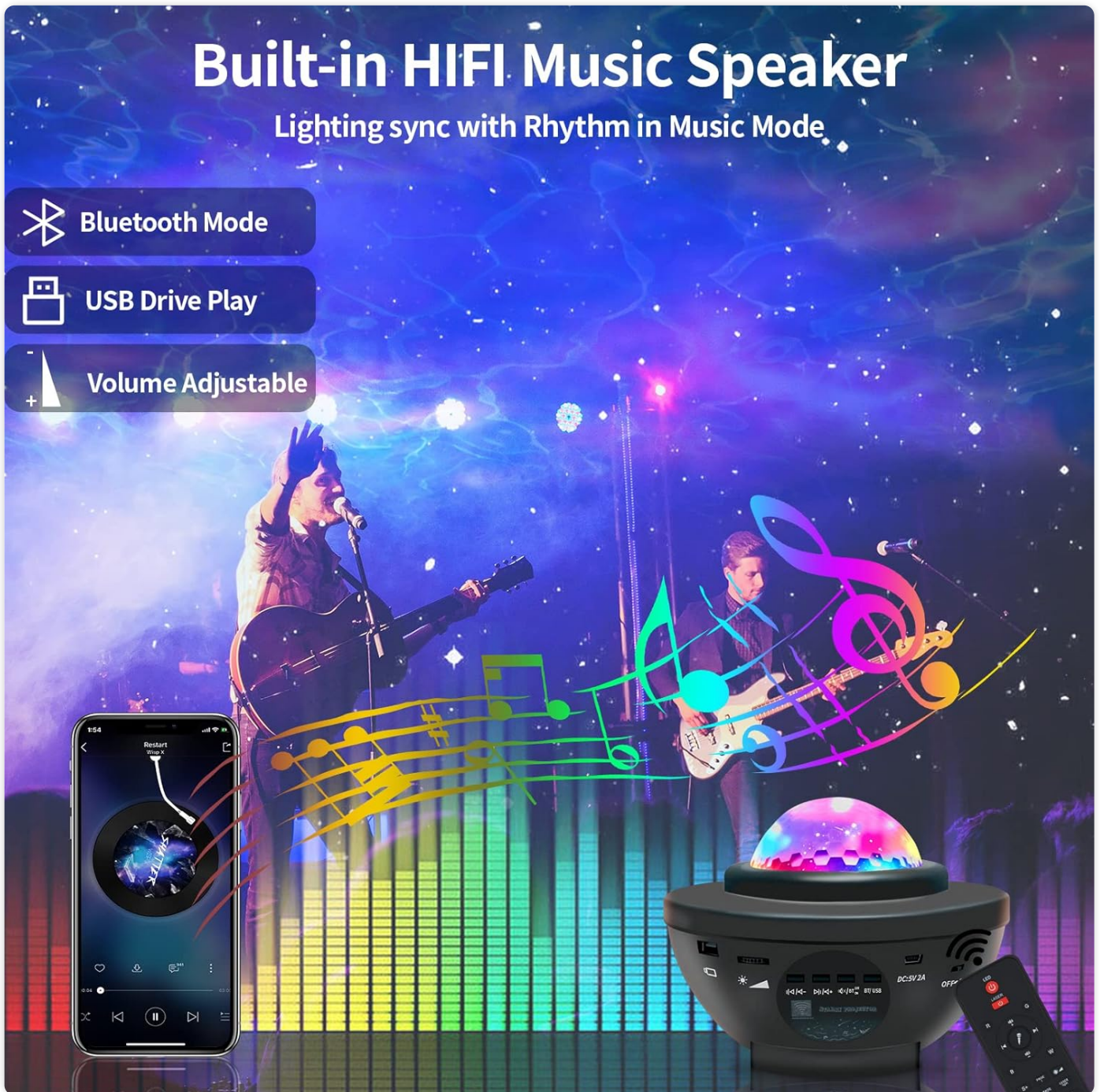
Figure 4: The projector's integrated HiFi Music Speaker, capable of syncing lighting with music rhythm.