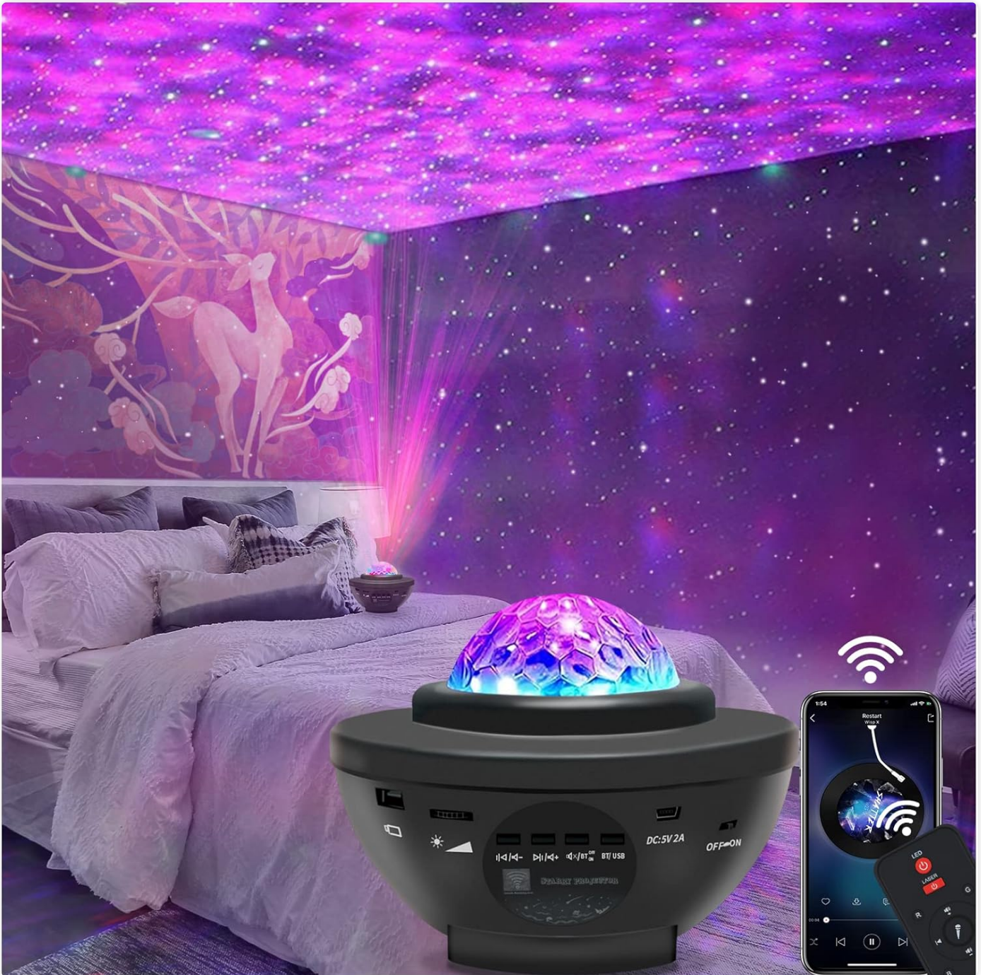
Figure 1: The easeking Star Projector Galaxy Light Projector, showcasing its projection capabilities in a bedroom environment.