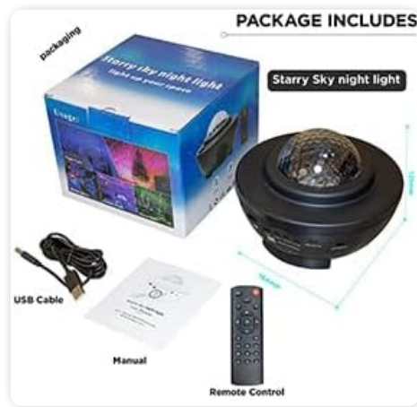
Figure 2: Illustration of the items included in the product package.